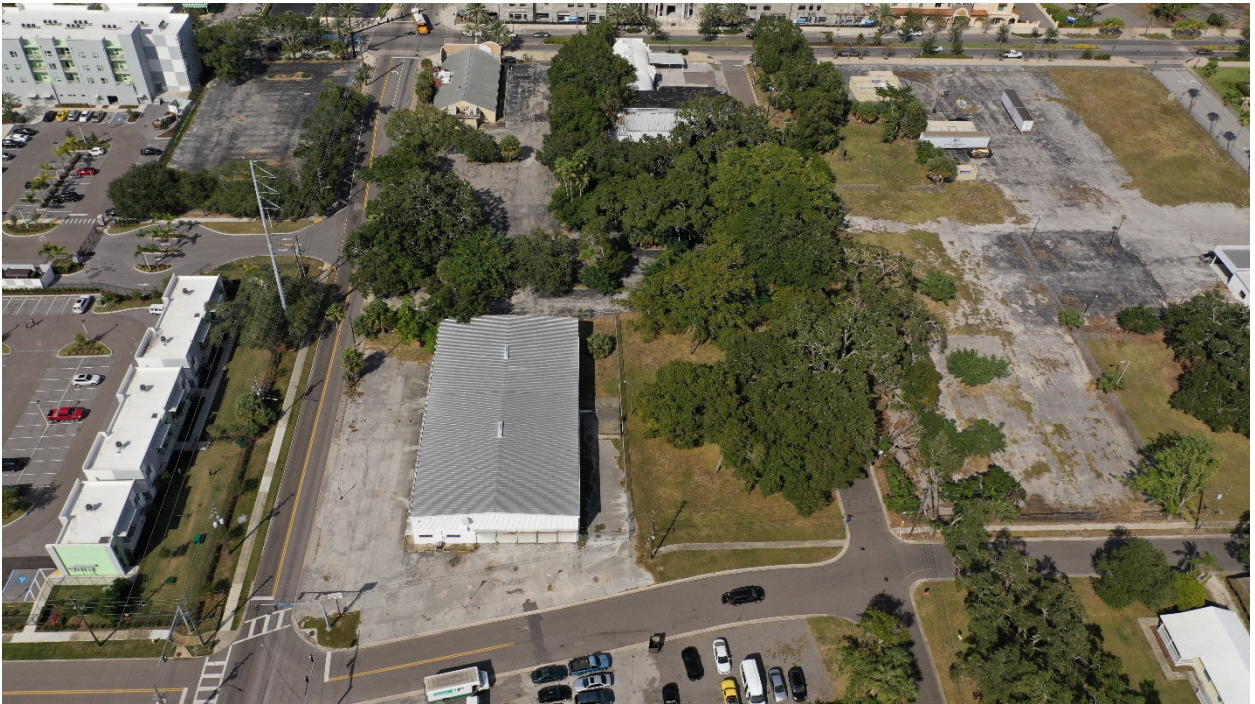
Site overhead view.