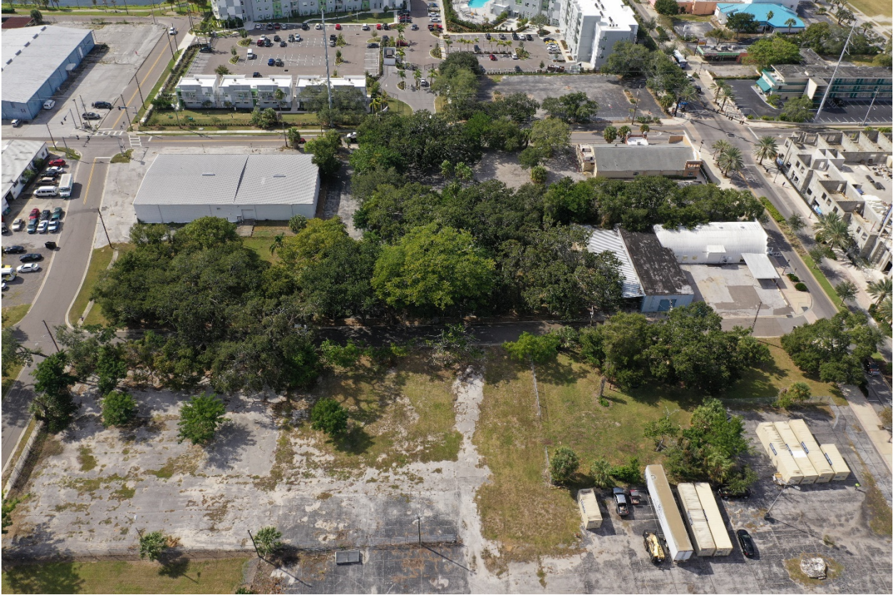
Site looking west.