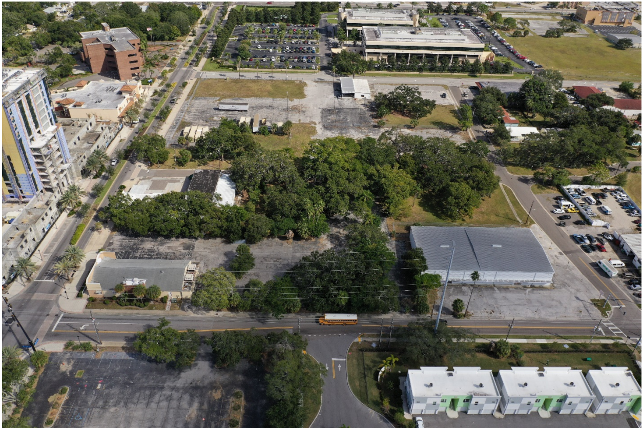
Site looking east.