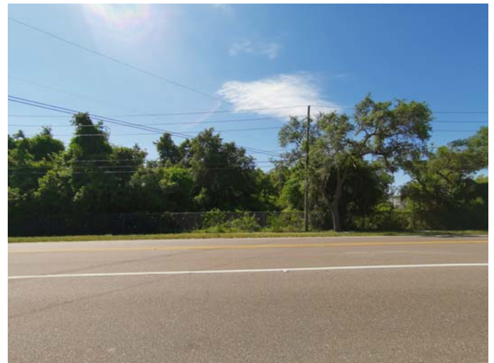
South of subject property, across NE Coachman Road