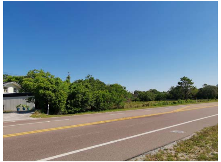
East of subject property