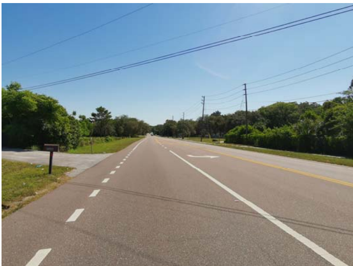
View looking easterly along NE Coachman Road