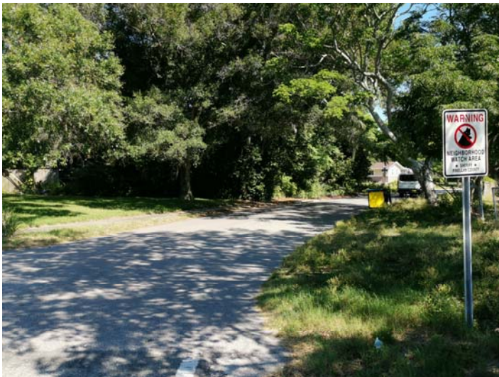
West of subject property