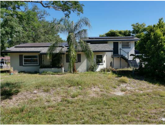
View looking north at subject property, 2248 NE Coachman Rd.