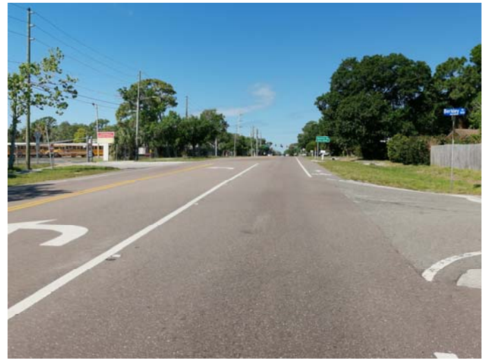
View looking westerly along NE Coachman Road

ANX2021-04006 Jennifer Martin 2248 NE Coachman Road