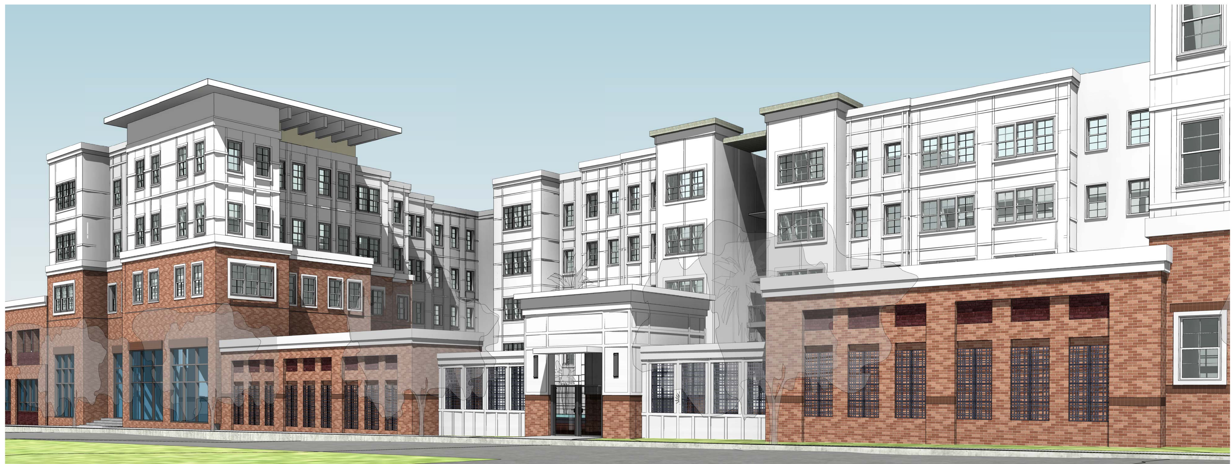
WASHINGTON AVENUE APARTMENTS 306 S WASHINGTON AVE. , CLEARWATER, FLORIDA