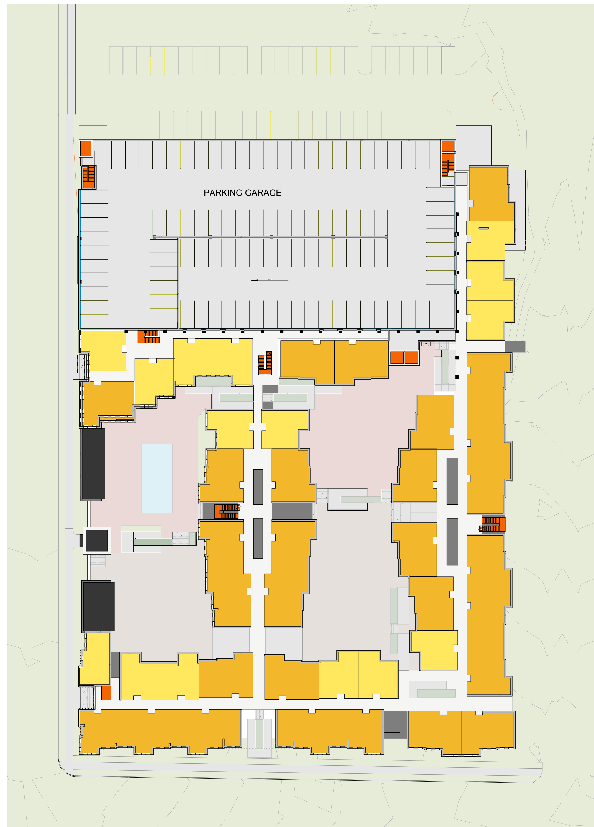
2 UPPER LEVEL 1/32" = 1'-0"