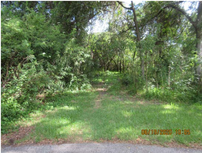
View looking north at the subject property, Elizabeth Avenue right-of-way