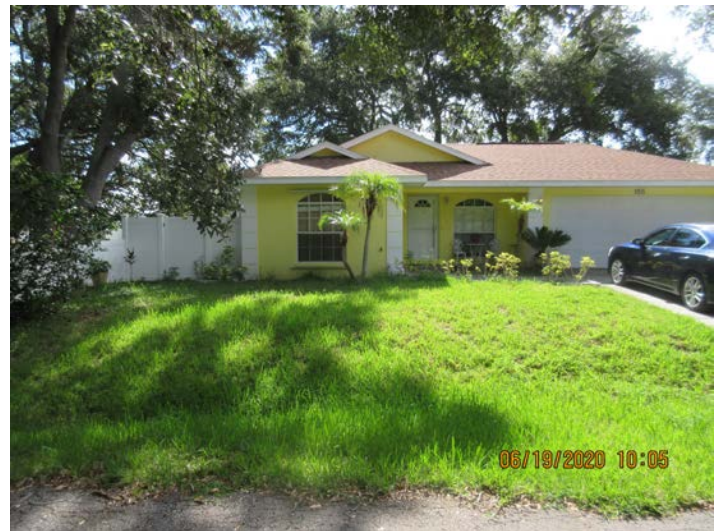
East of the subject property (right-of-way), looking towards 155 Elizabeth Avenue