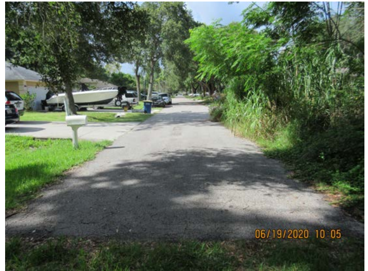
South of the subject property (right-of-way), looking southerly along Elizabeth Avenue