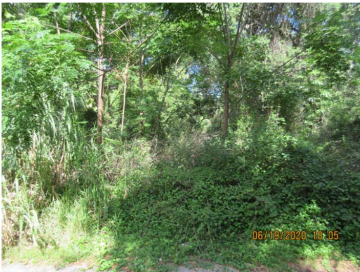
West of the subject property (right-of-way), looking towards 327 David Avenue