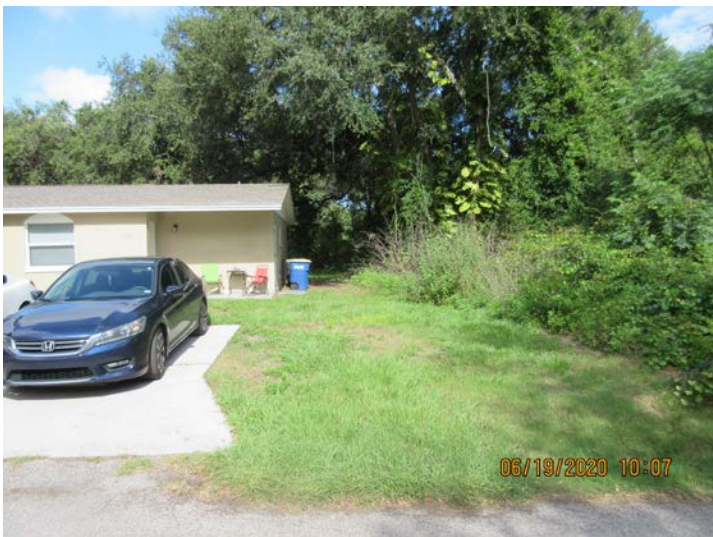
Southwest of the subject property (right-of-way), looking towards 204 Elizabeth Avenue

ANX2020-05005 Pinellas County Elizabeth Avenue Right-of-Way