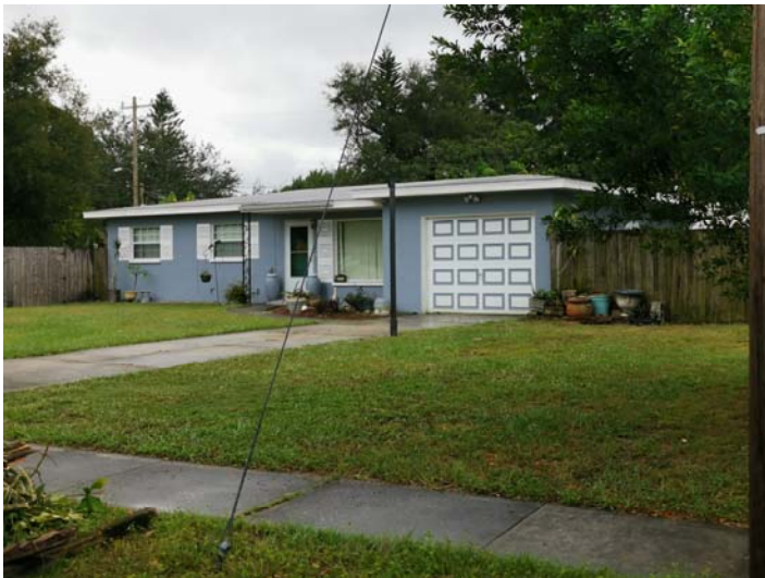
East of subject property