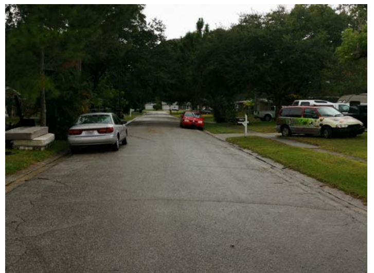
View looking westerly along Avocado Drive

ANX2019-09020 Peter Bakhit 2765 Avocado Drive