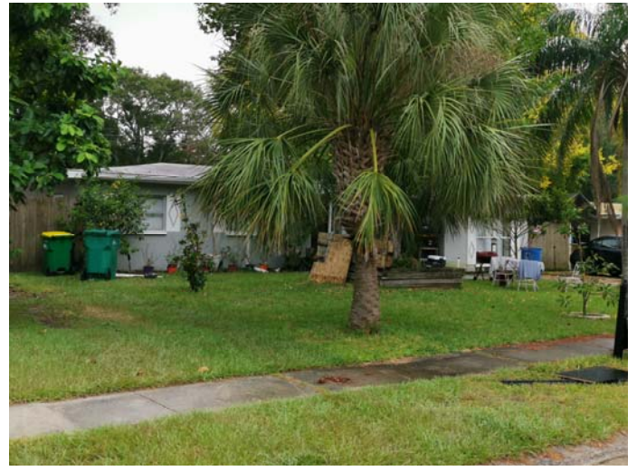
West of subject property