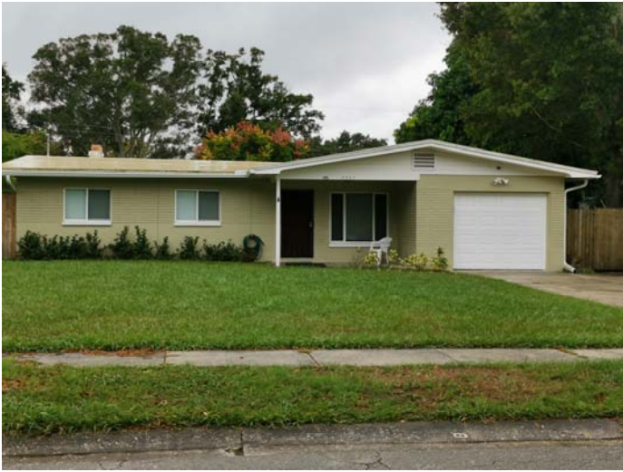
View looking south at subject property, 2765 Avocado Drive