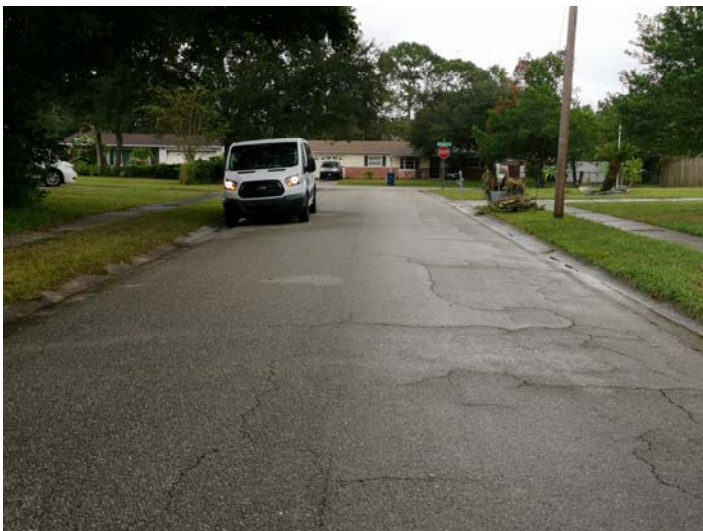
View looking easterly along Avocado Drive