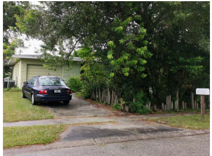
North of subject property, across Avocado Drive