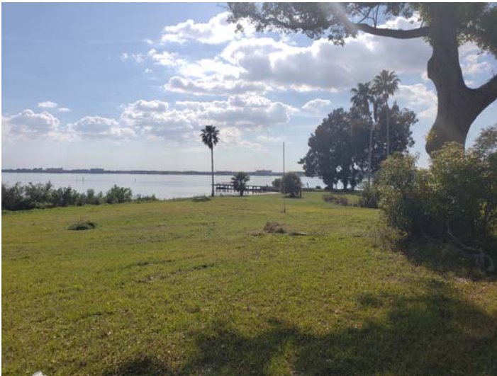
View looking southwest of the subject property