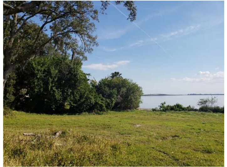
View looking southeast of the subject property