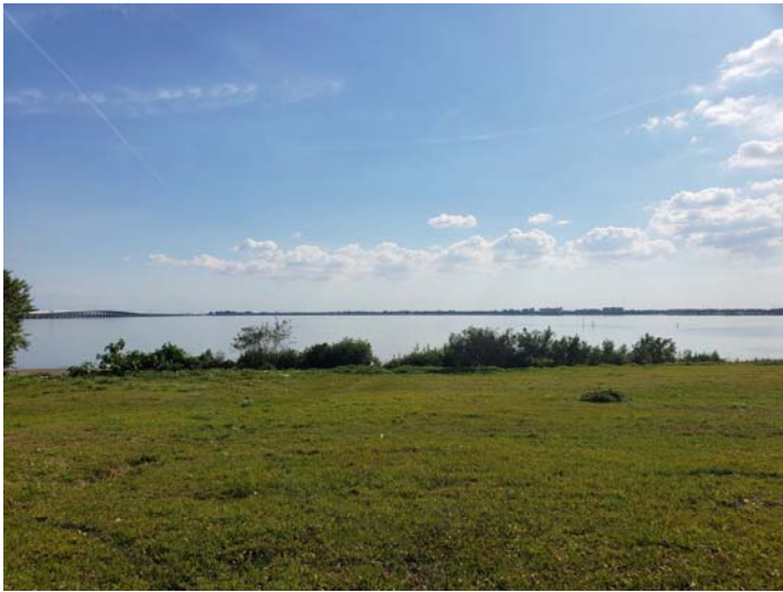
View looking south at subject property, Unaddressed Gulf to Bay Boulevard