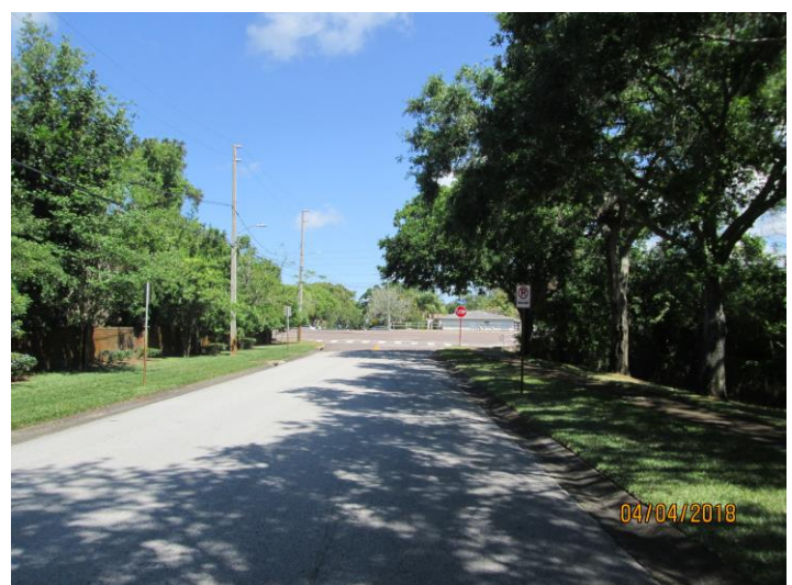
View looking northerly along Lake Shore Lane