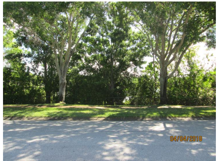
East of the subject property, across Lake Shore Lane