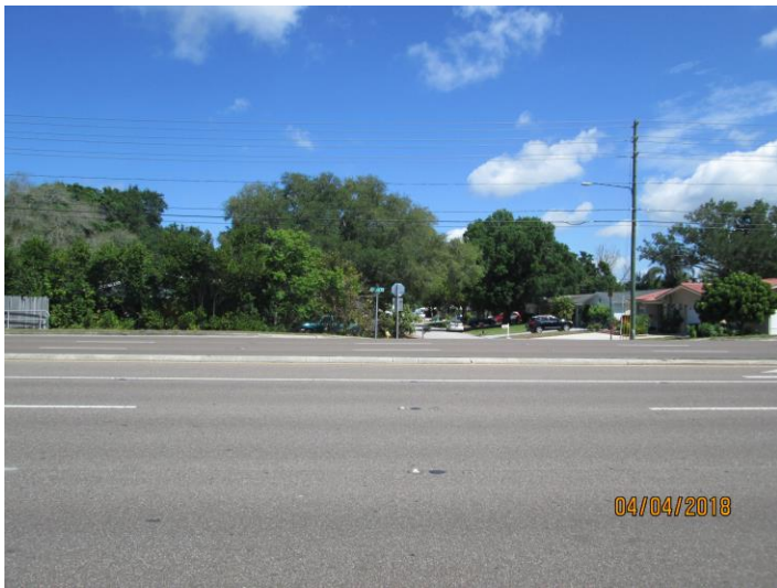
North of the subject property, across Curlew Road