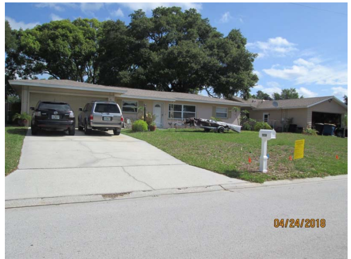
East of the subject property