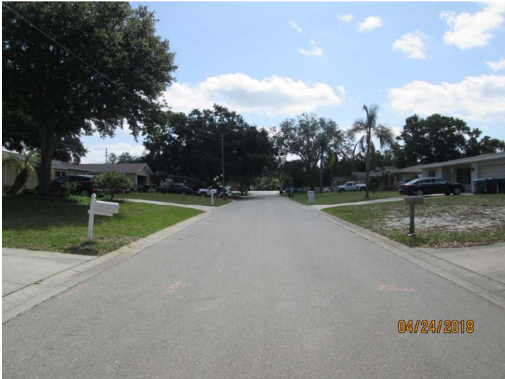
View looking easterly along Merrill Avenue