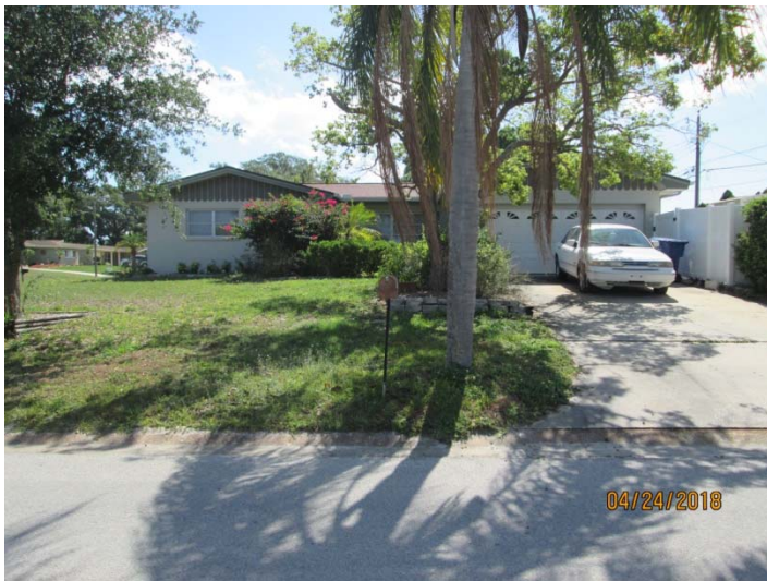
View looking east at the subject property, 511 Moss Avenue