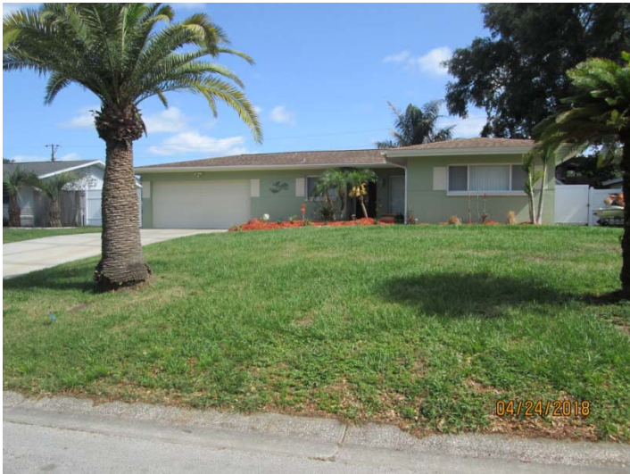
Across the street, to the north of the subject property