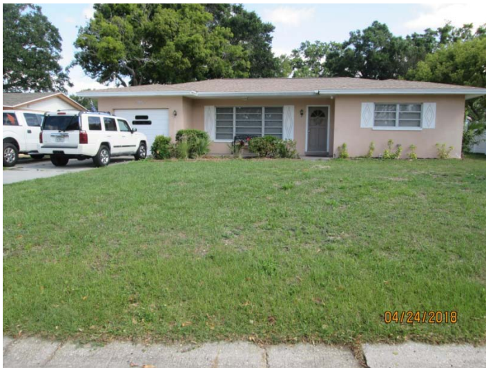
View looking north at the subject property, 3024 Lake Vista Drive