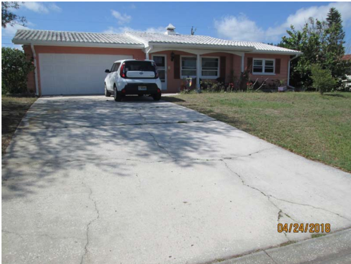
West of the subject property