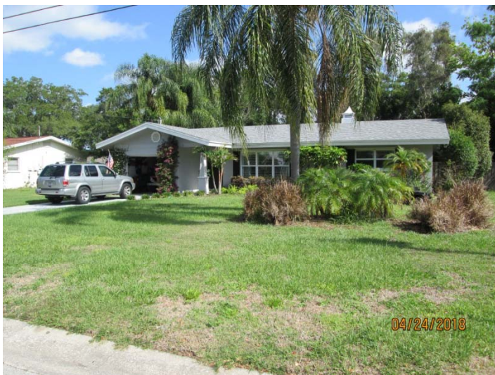
West of the subject property