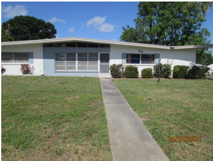
Across the street, to the west of the subject property