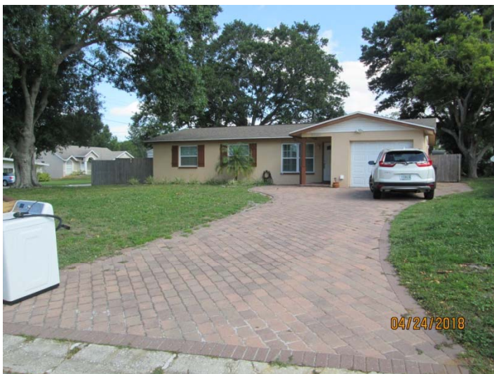
West of the subject property