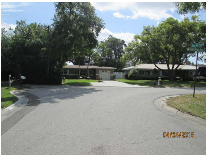
View looking easterly along Glen Oak Avenue North