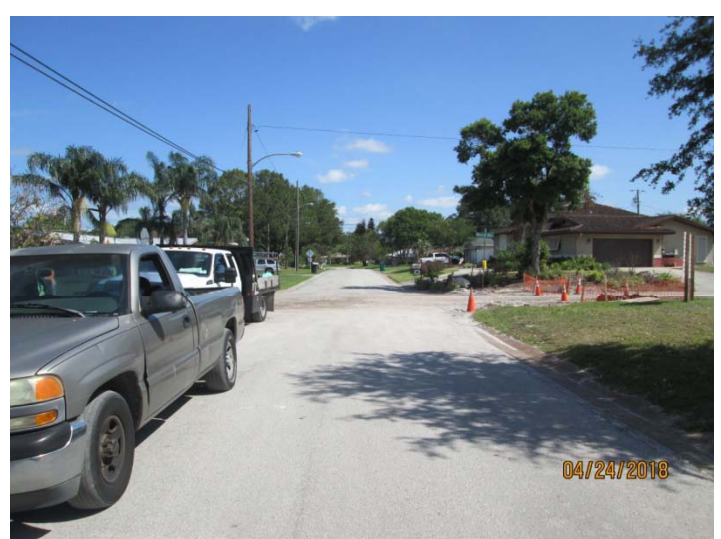
View looking northerly along Moss Avenue

ANX2018-04005 Charles P & Consuelo B. Bickle 511 Moss Avenue