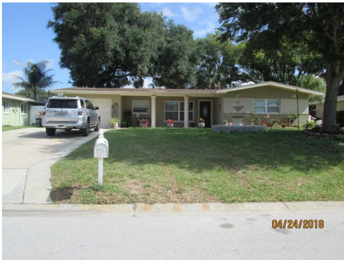
View looking north at the subject property, 3052 Merrill Avenue