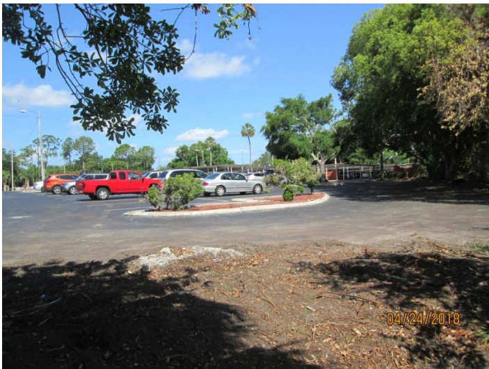
West of the subject property