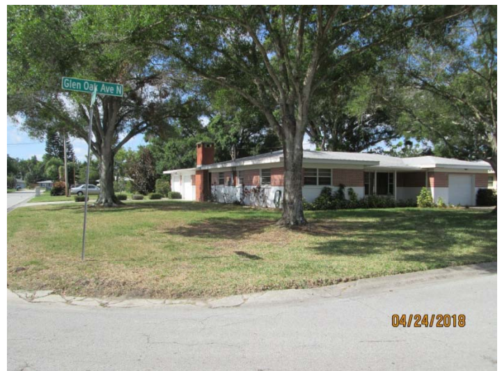
Across the street, to the south of the subject property