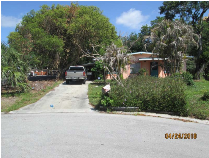
View looking north at the subject property, 3132 San Jose Street