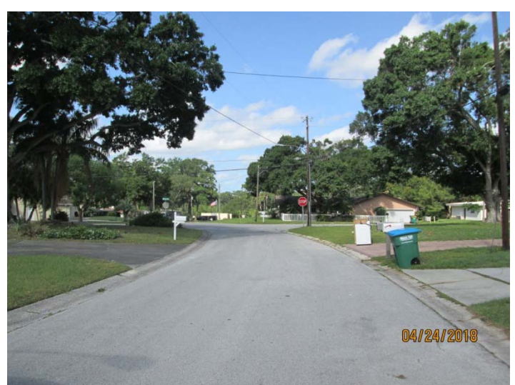
View looking westerly along Lake Vista Drive

ANX2018-04005 Cynthia J. Seats 3024 Lake Vista Drive