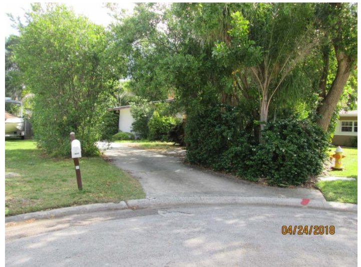
East of the subject property