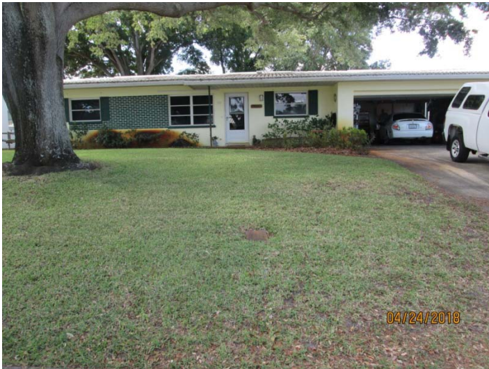
View looking south at the subject property, 3047 Merrill Avenue