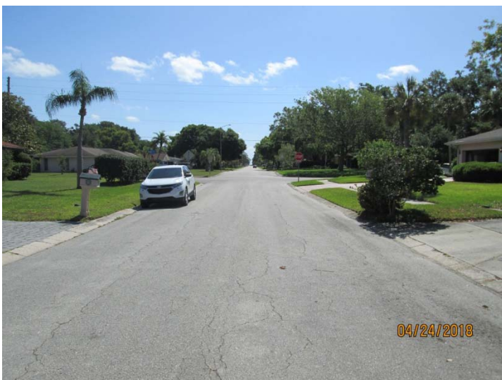
View looking easterly along San Jose Street