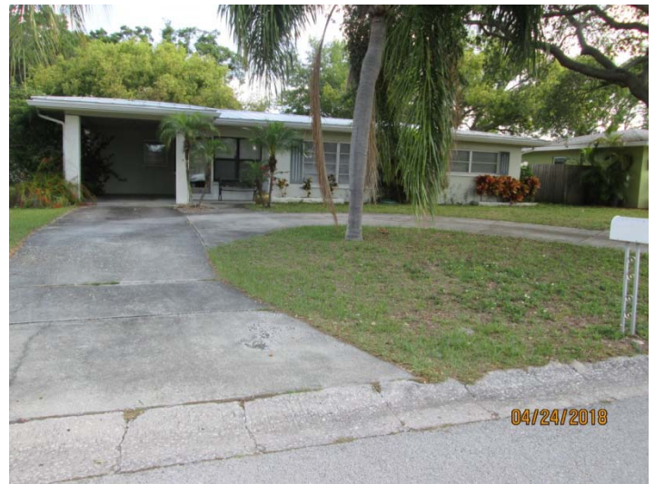
East of the subject property