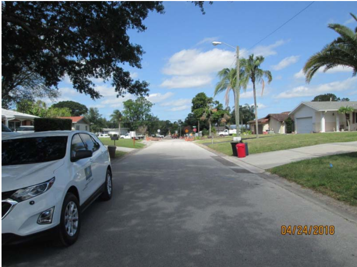
View looking westerly along Merrill Avenue