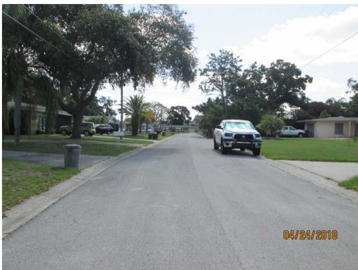
View looking easterly along Lake Vista Drive