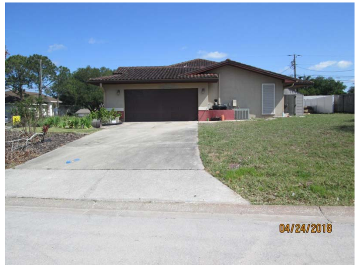
Across the street, to the north of the subject property