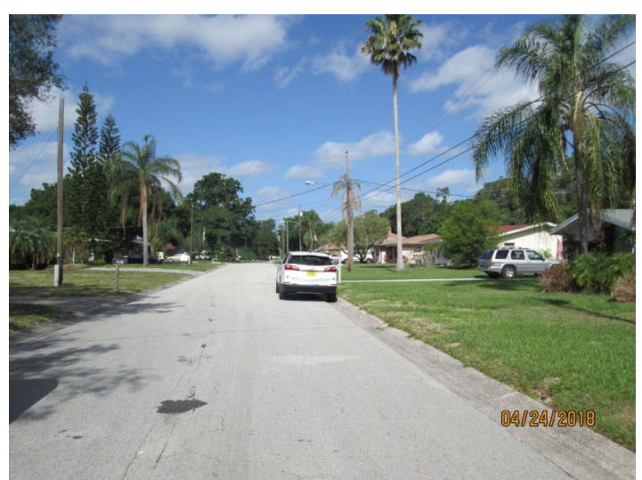
View looking westerly along Glen Oak Avenue North

ANX2018-04005 Wayne S. Ritchie, Adrienne Ritchie 3072 Glen Oak Avenue North