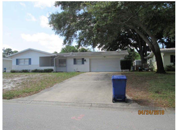
Across the street, to the south of the subject property