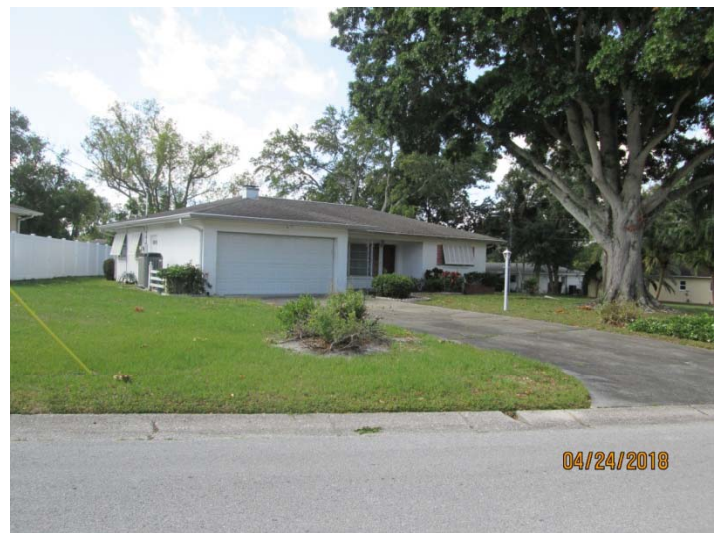
Across the street, to the south of the subject property