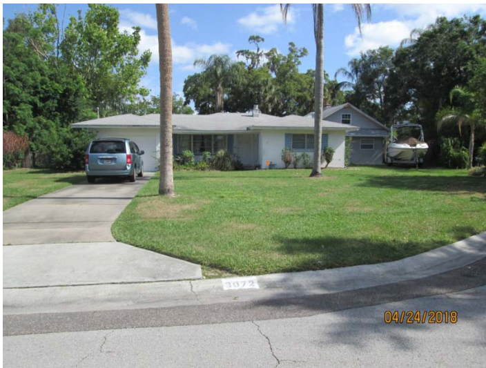
View looking north at the subject property, 3072 Glen Oak Avenue North