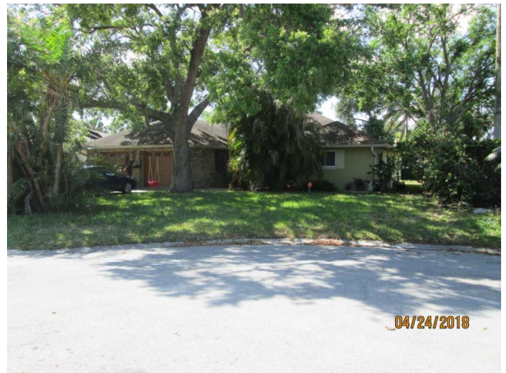
Across the street, to the south of the subject property