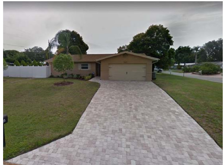
South of the subject property