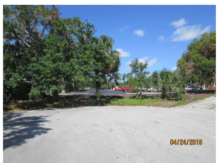
View looking westerly along San Jose Street