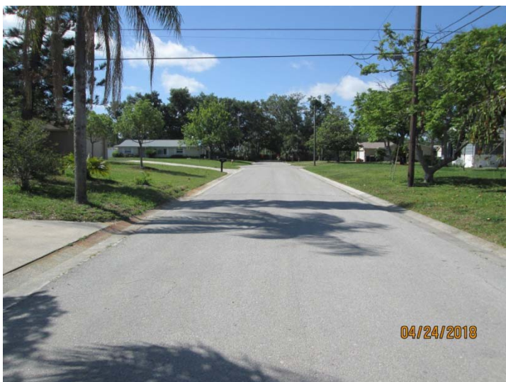
View looking southerly along Moss Avenue