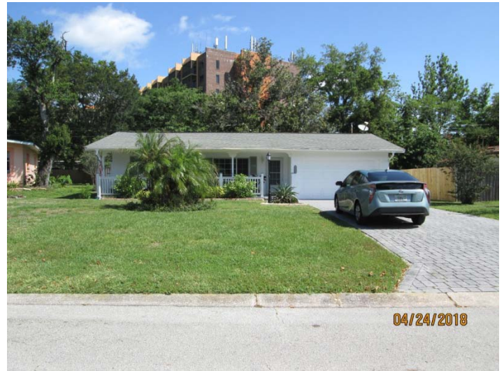
East of the subject property