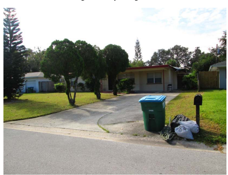
View looking south at the subject property 3069 Terrace View Lane