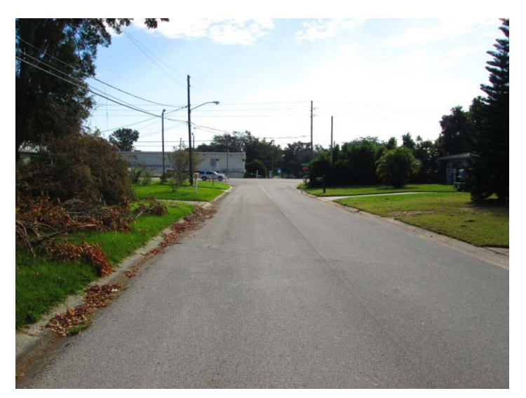
View looking easterly along Terrace View Lane