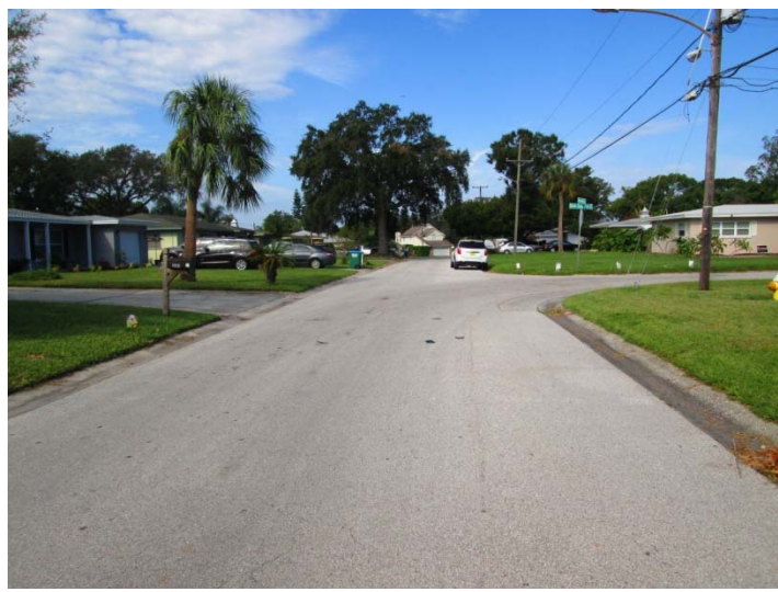
View looking westerly along Terrace View Lane