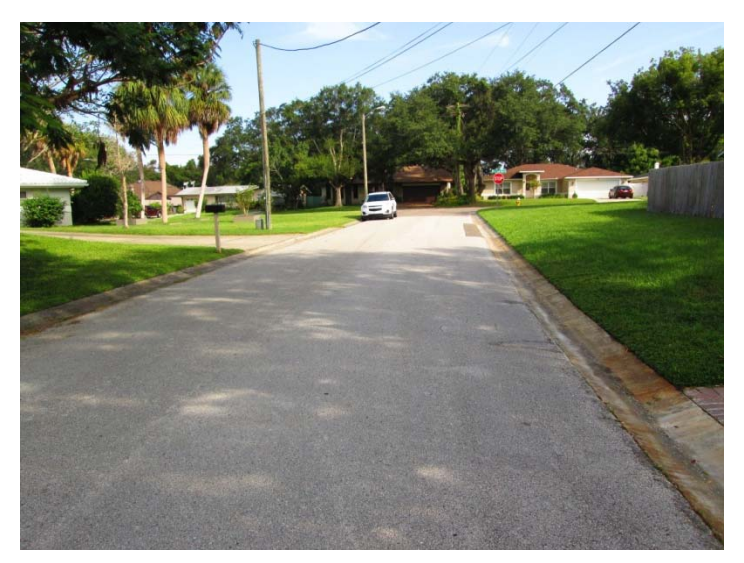
View looking northerly along Moss Avenue