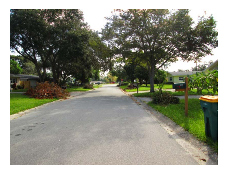
View looking easterly along Grand View Avenue