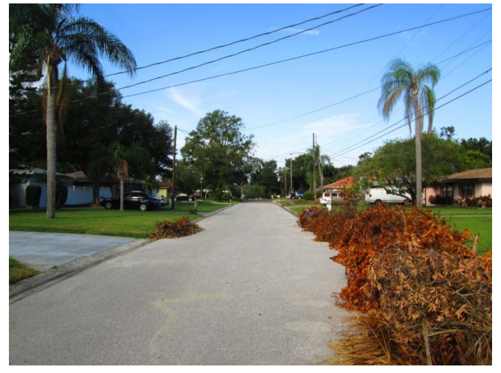
View looking westerly along Glen Oak Avenue North