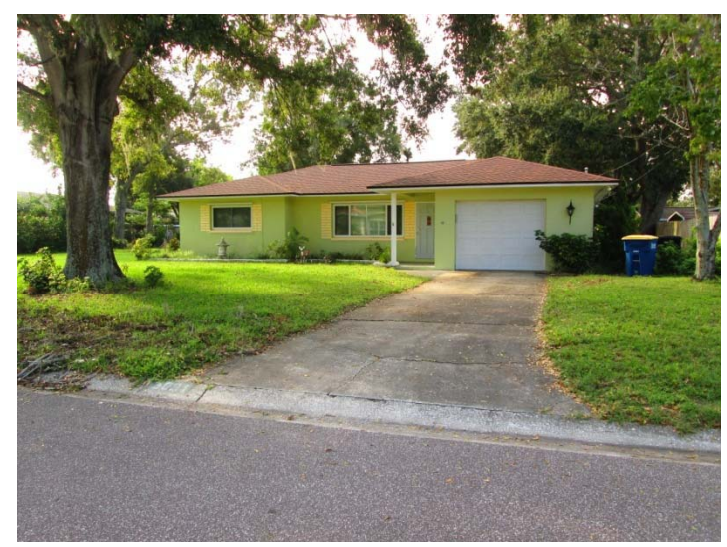
View looking south at the subject property 3031 Glen Oak Avenue North