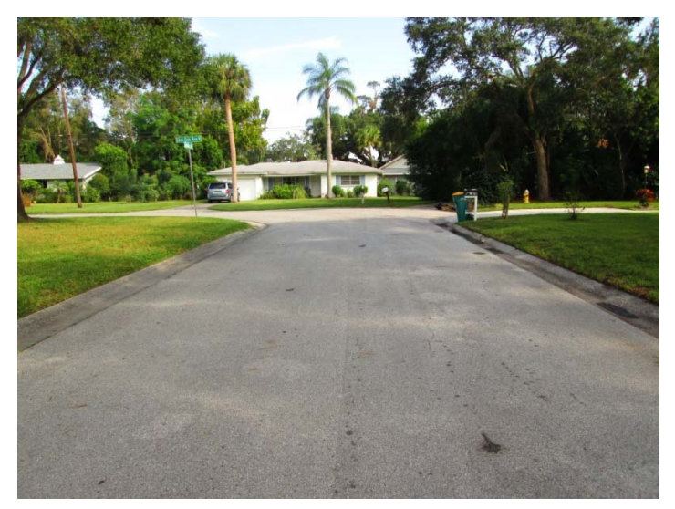
View looking northerly along Glen Oak Avenue East