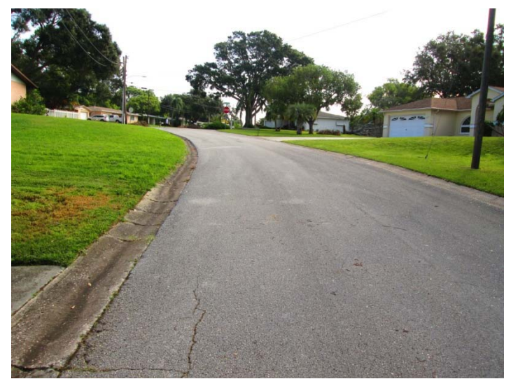
View looking easterly along Lake Vista Drive