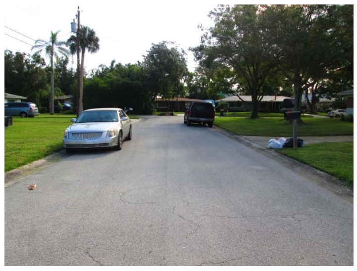
View looking easterly along Glen Oak Avenue North