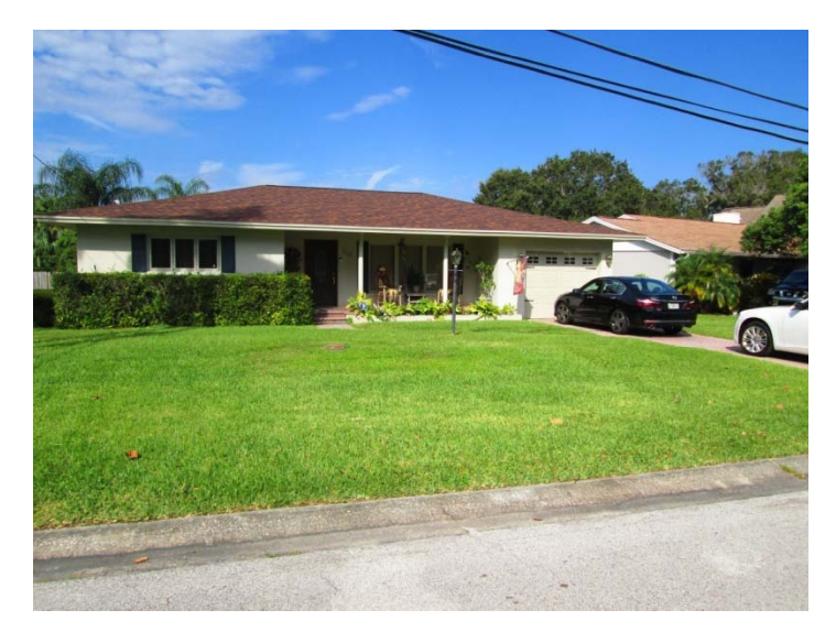
View looking west at the subject property 708 Moss Avenue