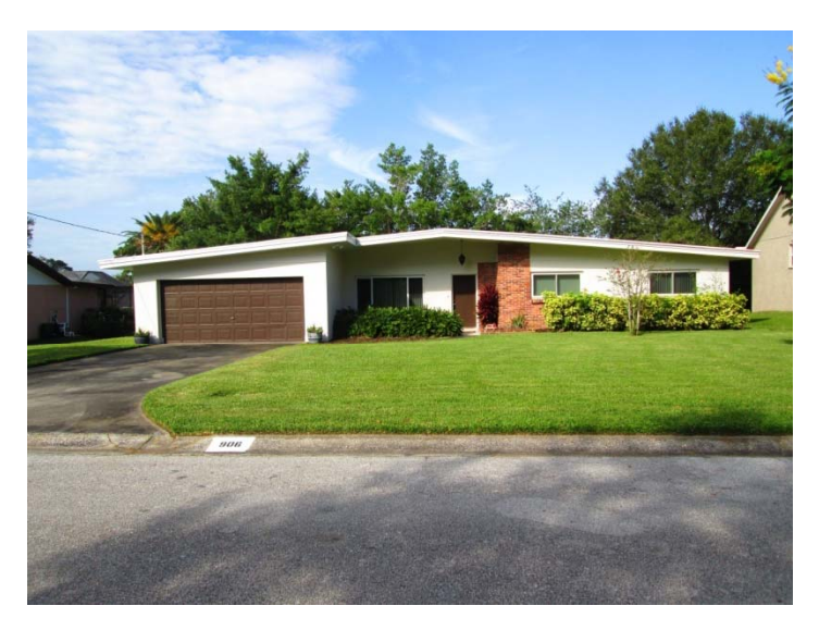
View looking west at the subject property 906 Moss Avenue