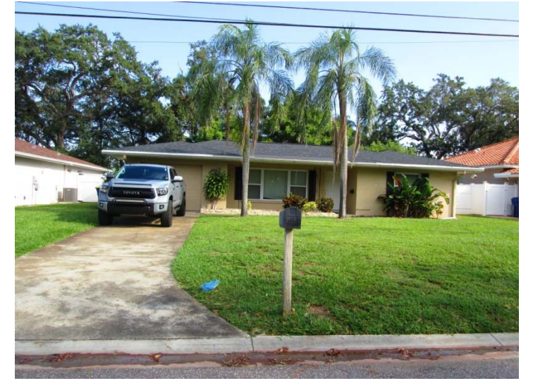
View looking north at the subject property 3030 Glen Oak Avenue North