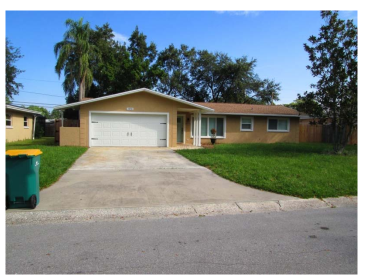
View looking north at the subject property 3058 Grand View Avenue