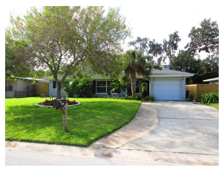
View looking south at the subject property 3063 Terrace View Lane