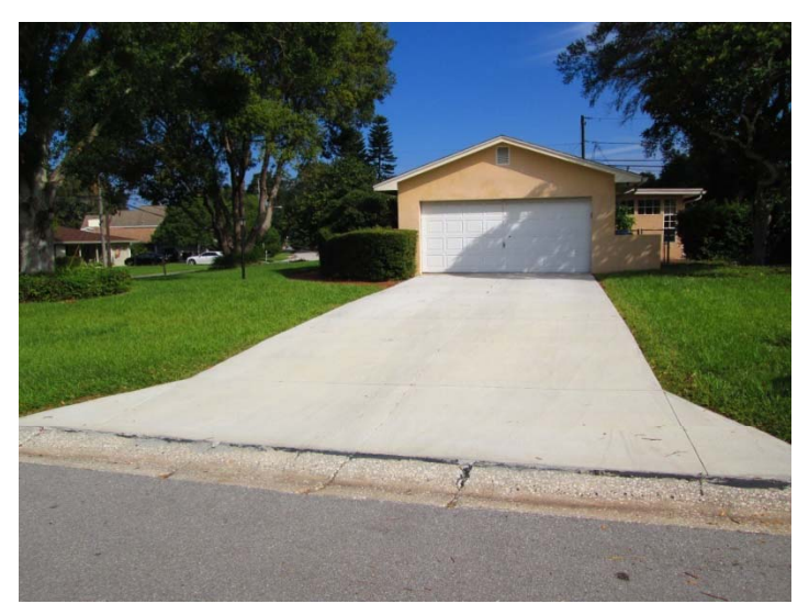
View looking north at the subject property 701 Moss Avenue