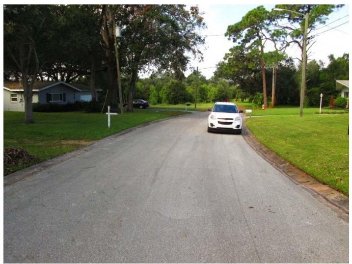
View looking westerly along Lake Vista Drive