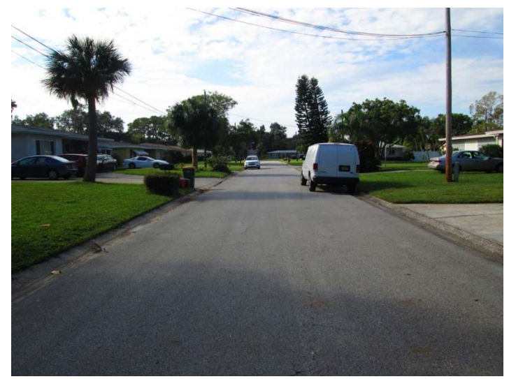
View looking southerly along Glen Oak Avenue East