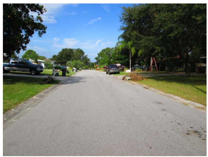
View looking westerly along Grand View Avenue