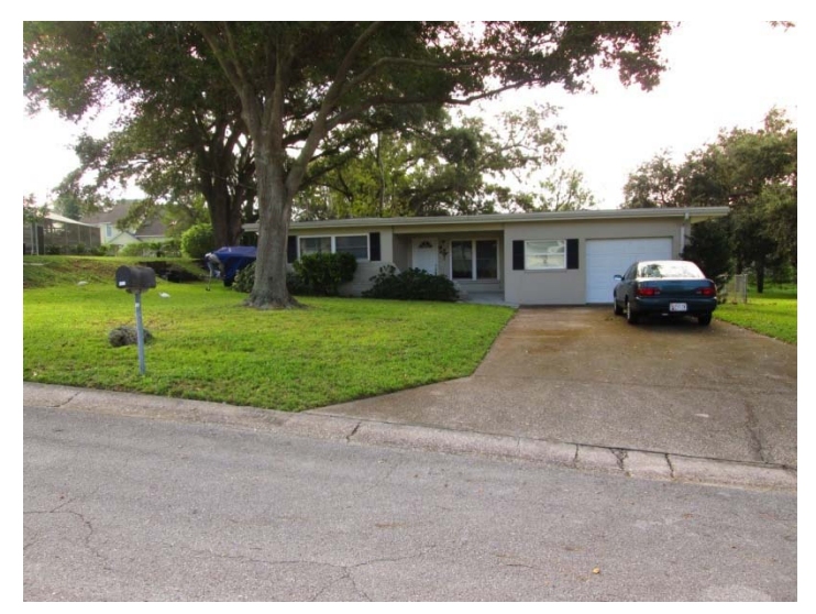
View looking south at the subject property 3013 Lake Vista Drive