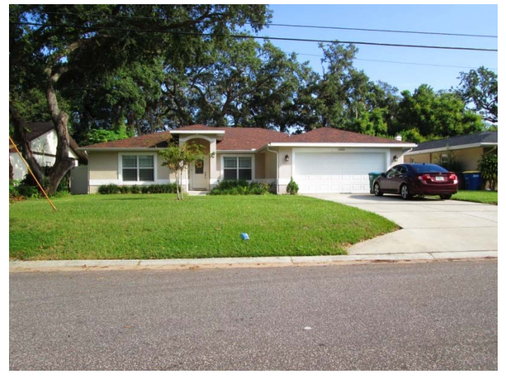
View looking north at the subject property 3024 Glen Oak Avenue North