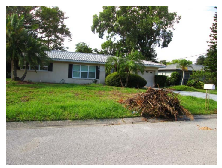
View looking south at the subject property 3055 Glen Oak Avenue North