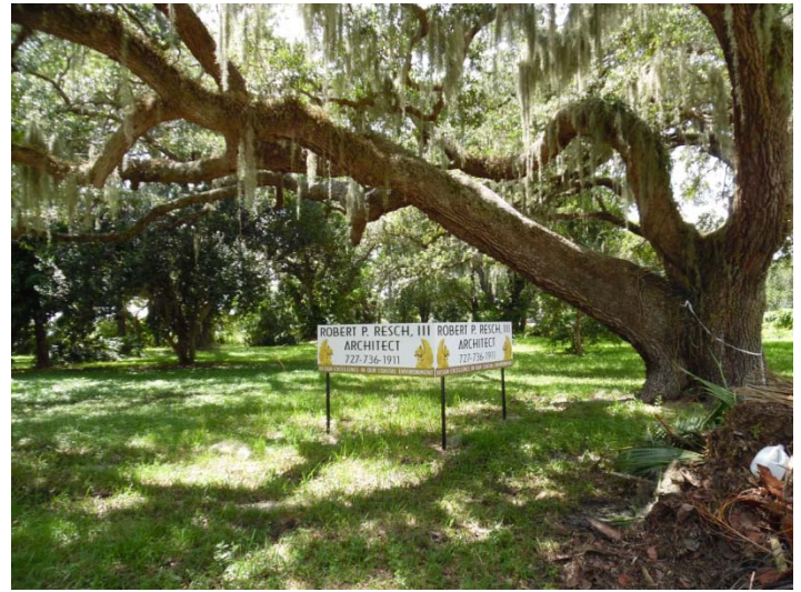
North of the subject property