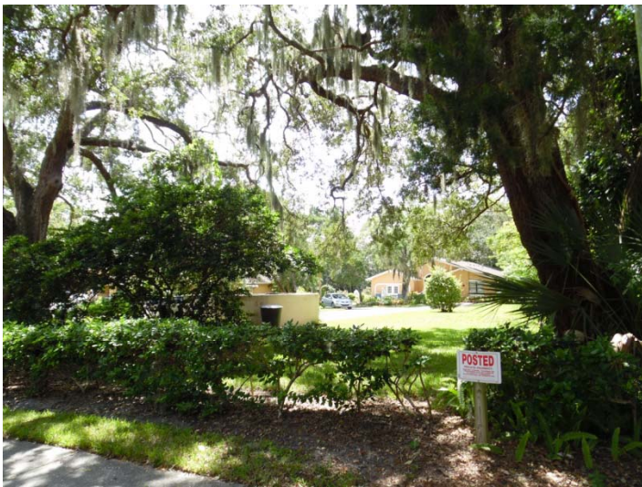
South of the subject property