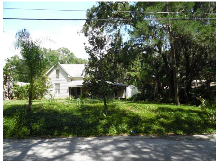
Across the street, to the east of the subject property