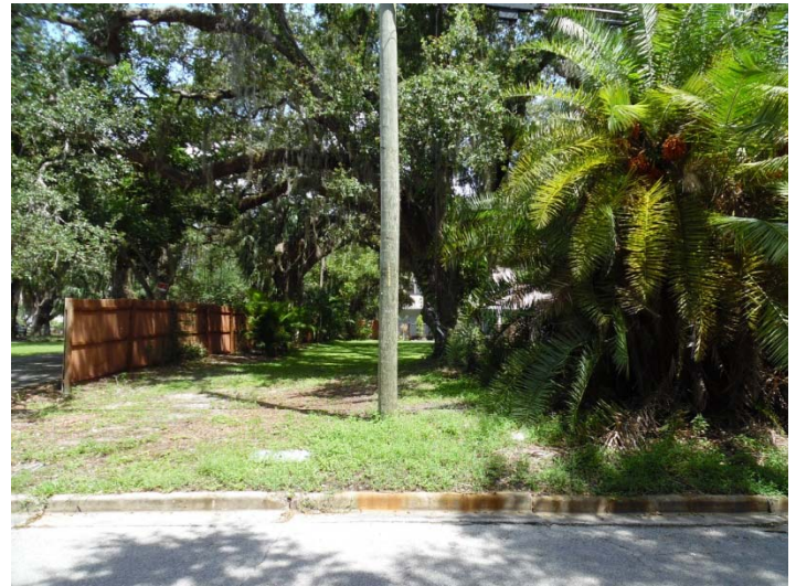
Across the street, to the east of the subject property