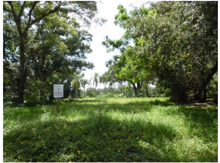
North of the subject property