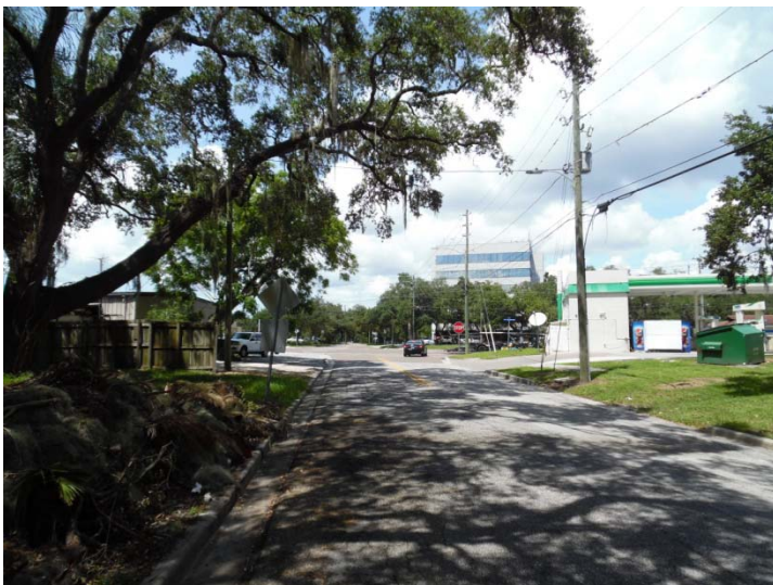
View looking northerly along South Bayview Avenue