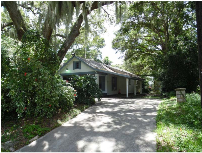
View looking west at the subject property, 606 South Bayview Avenue