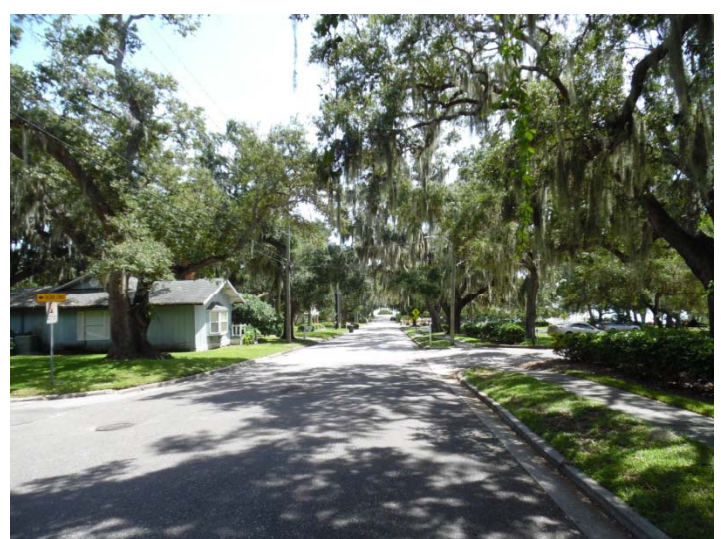
View looking southerly along South Bayview Avenue

ANX2016-08028; LUP2016-08007; REZ2016-08004 Our Lady of Divine Providence, House of Prayer, Inc. 0 South Bayview Avenue