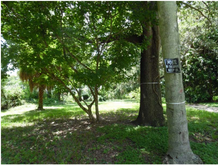
View looking west at the subject property, 0 South Bayview Avenue