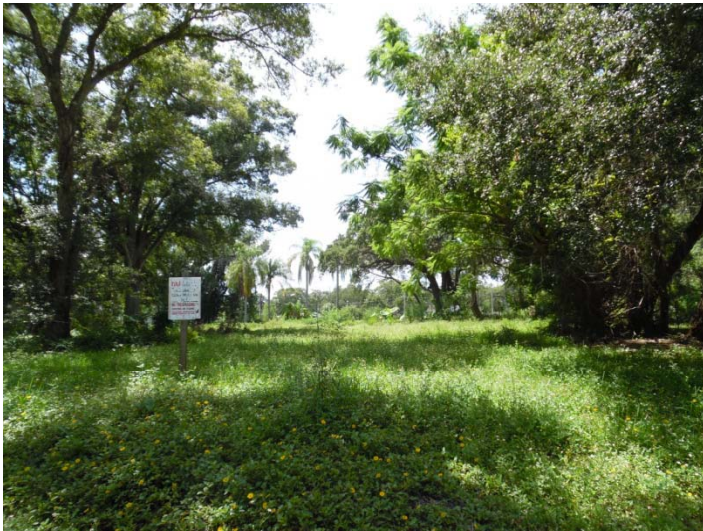
South of the subject property