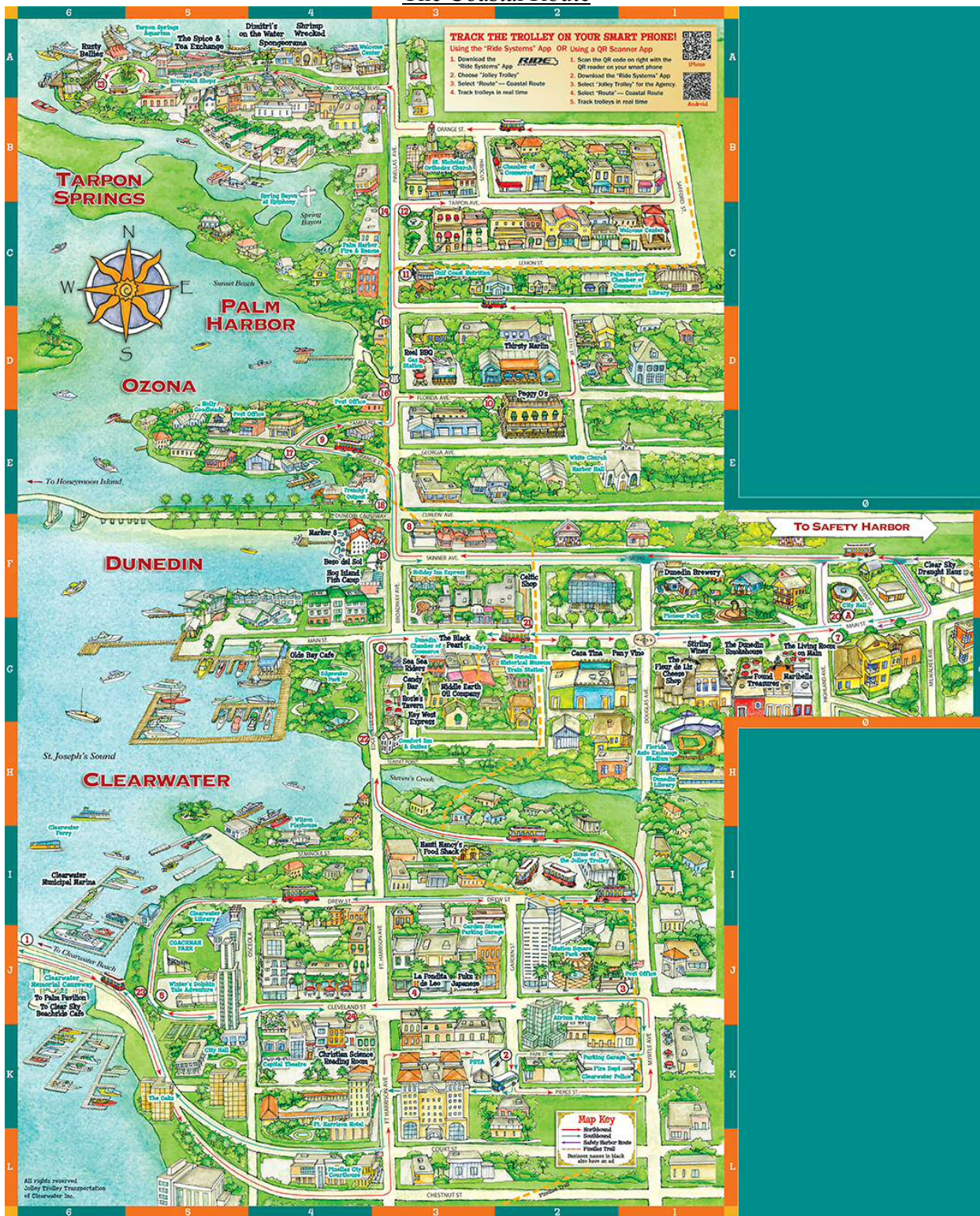
EXHIBIT A The Coastal Route