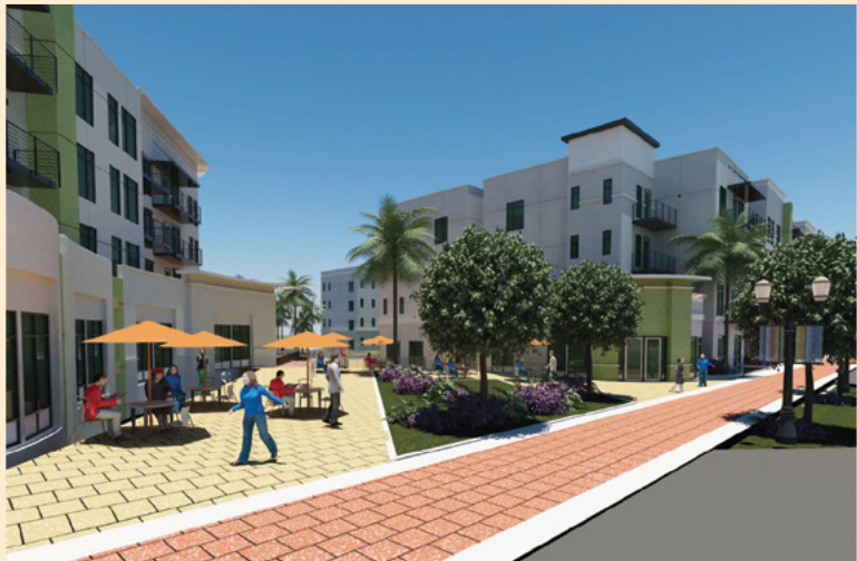
The Nolen, a 257-unit apartment community in downtown Clearwater is under construction and will open in 2016.