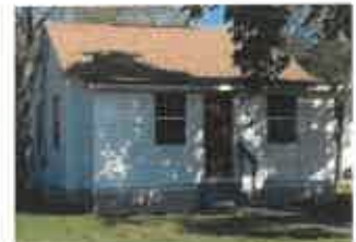
2921 18 th Ave S

CSF recently purchased single family homes in South St. Petersburg. These properties will be renovated and made available to St. Vincent de Paul Cares for use by homeless U.S. veterans needing housing.