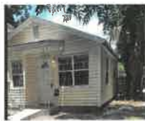
2820 ½ 5 th St S