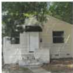
4339 16 th Ave S

The resources of CSF and St. Vincent de Paul Cares are creating a coordinated impact to provide veterans enrolled in their SSVF (Supported Services for Veterans and Families) Program with shared/permanent housing. The SSVF Program assists very low-income Veteran families residing in or transitioning to permanent housing, while providing a range of supportive services that are designed to promote housing stability. This support bridges the gap from an immediate crisis-such as abuse or homelessness-into permanent housing. The project's goal is to offer a safe space in which veterans can process their trauma, work on the issues that led to their homelessness, and build a supportive network that will help them in the future.