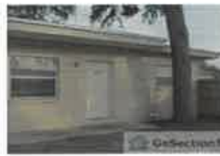
2627 5 th Ave S