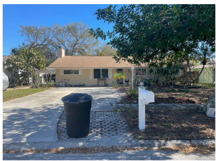
Across the street, to the east of the subject property