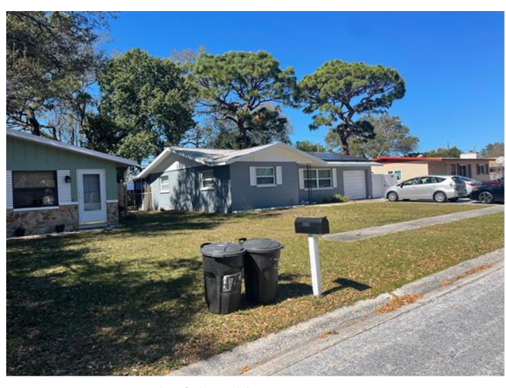
North of the subject property