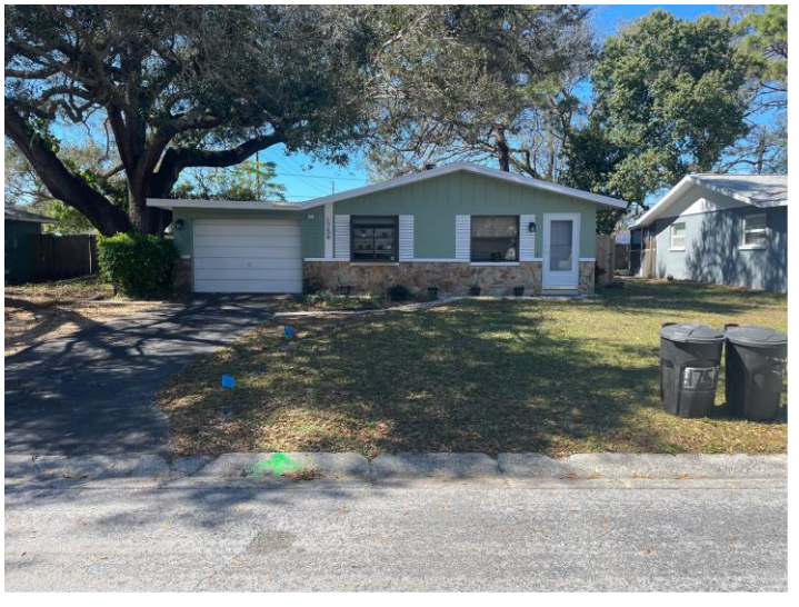
View looking west at subject property on West Manor Avenue