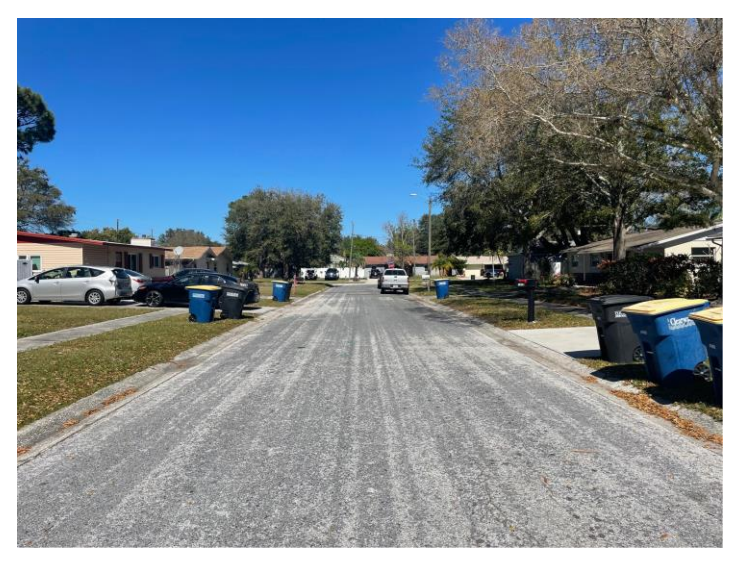
View looking northerly along West Manor Avenue