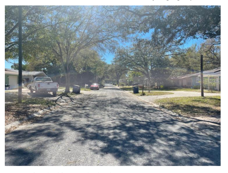
View looking southerly along West Manor Avenue

ANX2023-01001 Louis Rowlands and Melissa Carr 1754 West Manor Avenue