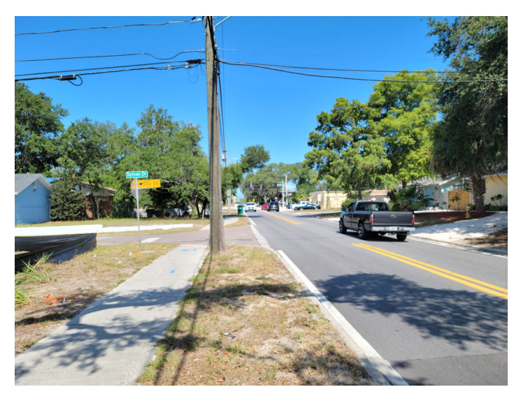
View looking westerly along Sunset Point Road

ANX2022-05008 Weekley Homes, LLC 1219 Sunset Point Road