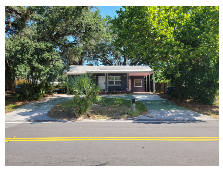
Across the street, to the north of the subject property