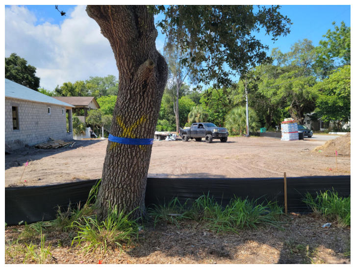
View looking south at subject property 1219 Sunset Point Road