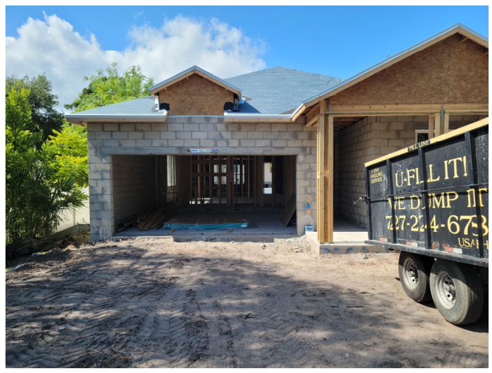
East of the subject property