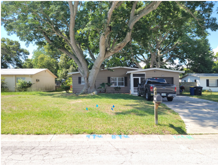
View looking south at subject property 2843 St. John Drive