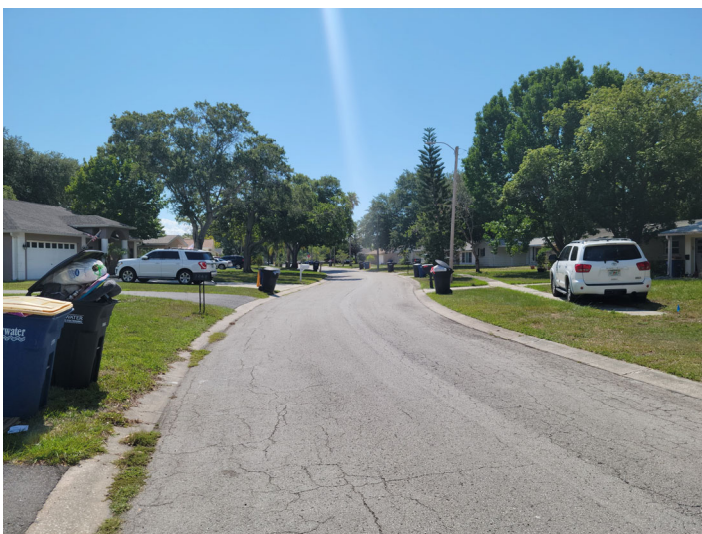
View looking easterly along St. John Drive