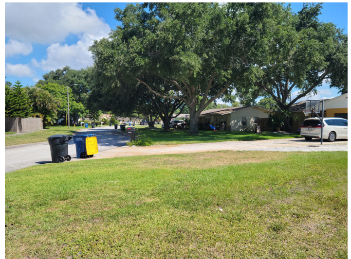
Across the street, to the north of the subject property