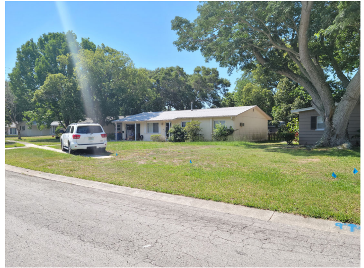
East of the subject property