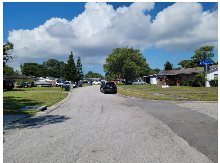
View looking westerly along St. John Drive