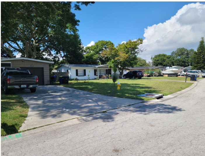
West of the subject property