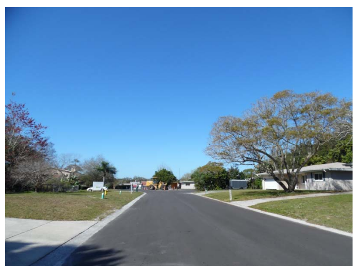
View looking westerly along Grove Circle Ct.

ANX2016-01007 Diana L. Turner 1484 Grove Circle Court