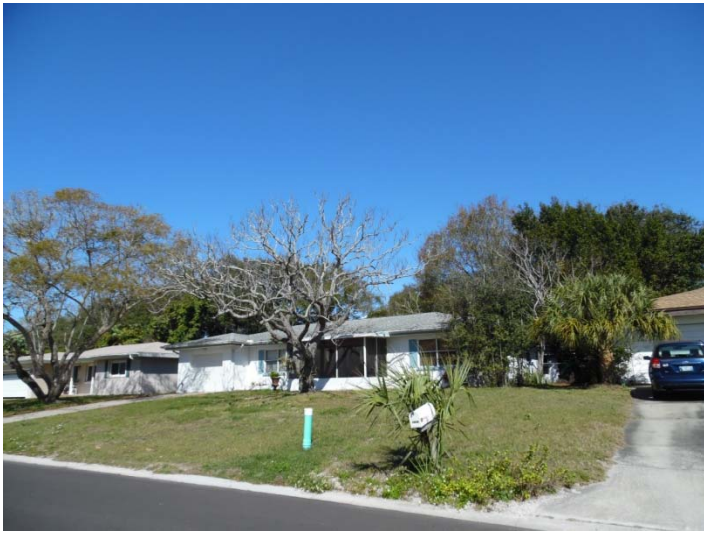
View looking north at the subject property, 1484 Grove Circle Ct.