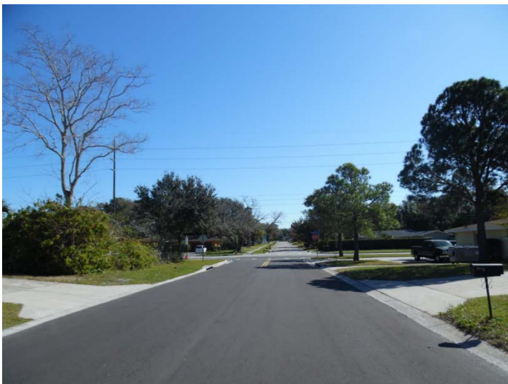
View looking easterly along Grove Circle Ct.