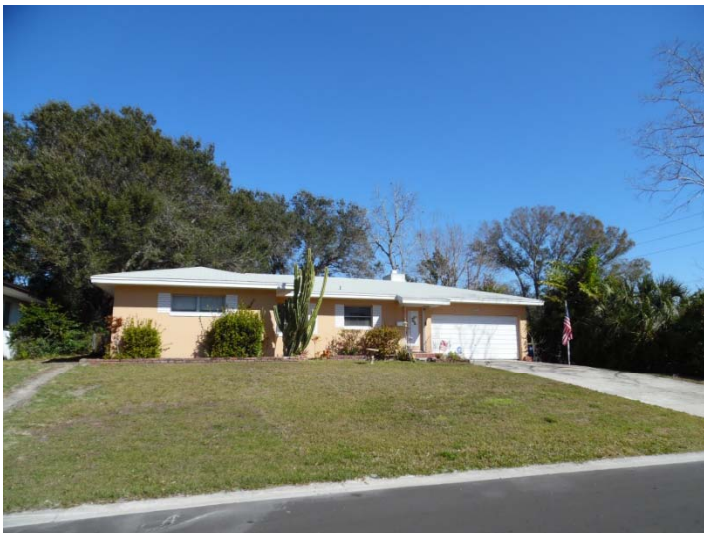
East of the subject property