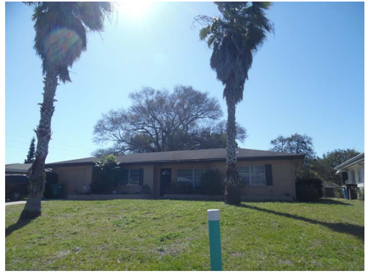
Across the street, south of the subject property