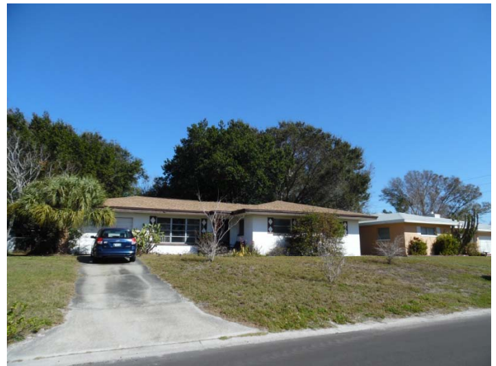
West of the subject property