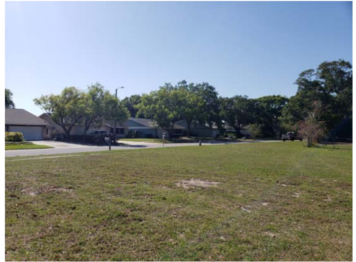
East of the subject property