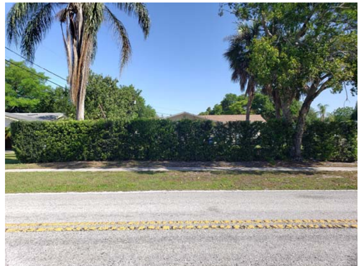
Across the street, to the north of the subject property