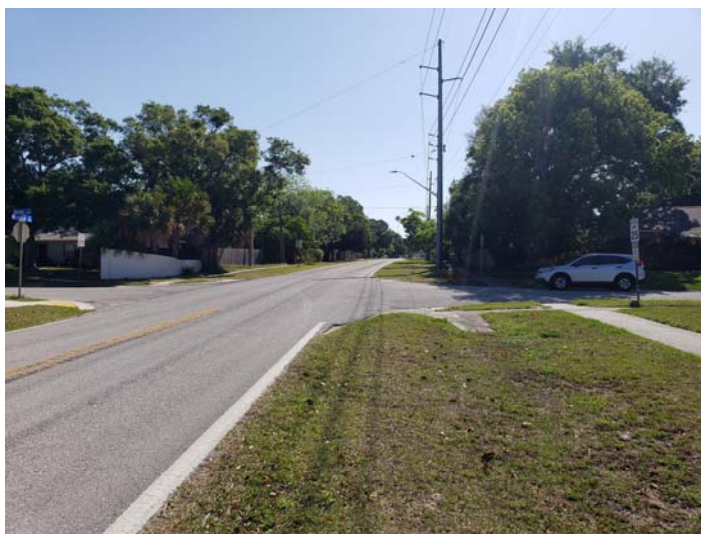
View looking easterly along Montclair Road