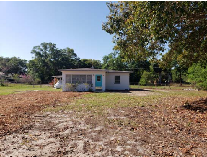
View looking south at subject property 1881 Montclair Road