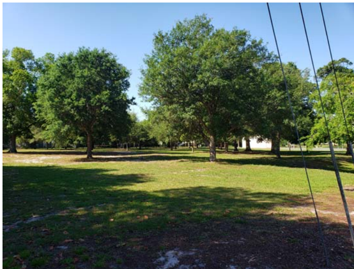
West of the subject property