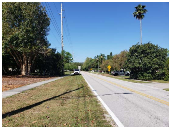
View looking westerly along Montclair Road

ANX2021-03004 Richard H. & Dixie D. Ross 1881 Montclair Road