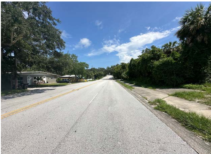
View looking northerly along Douglas Avenue