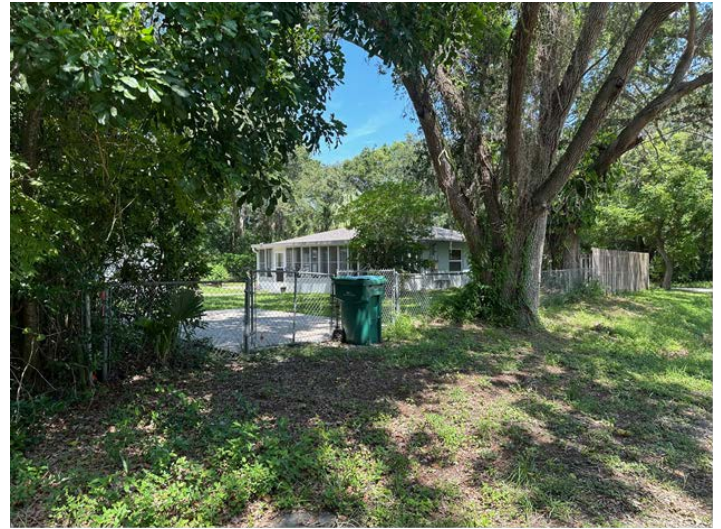
North of the subject property, Sylvan Drive frontage