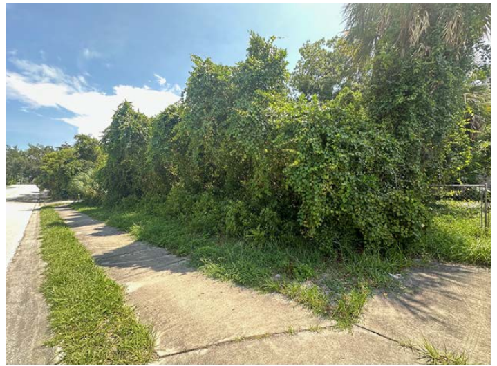
North of the subject property