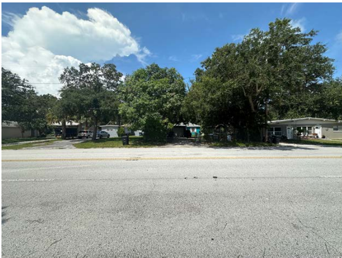
Across the street, to the west of the subject property