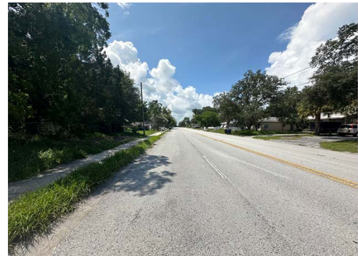
View looking southerly along Douglas Avenue

ANX2024-07004 Cozy Homes LLC and L & R Luxury Homes LLC 1827 Douglas Avenue