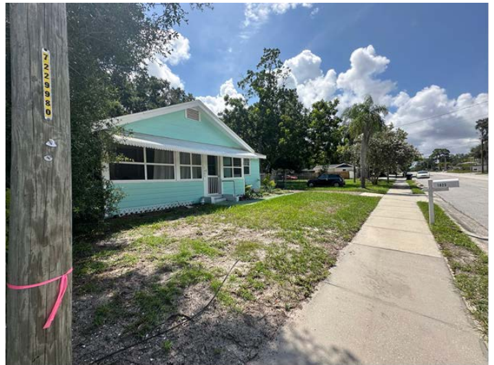
South of the subject property