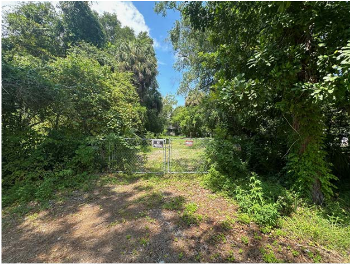
View looking west at the subject property, Sylvan Drive frontage