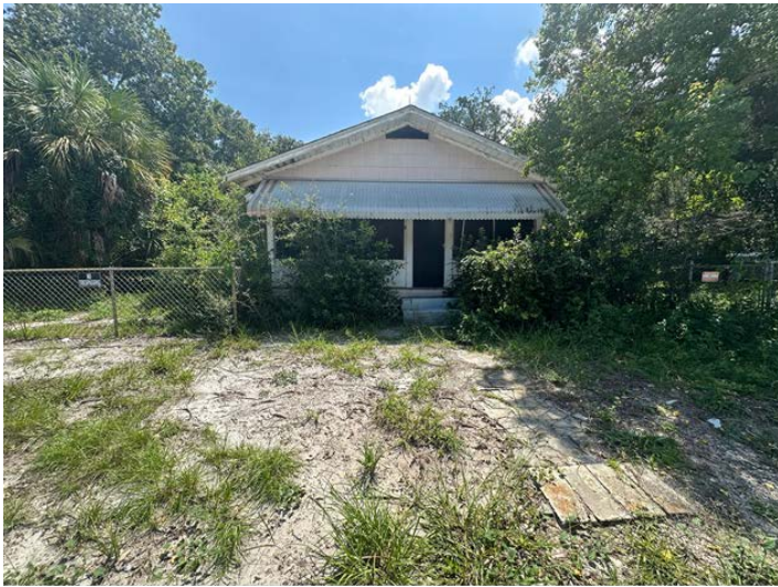
View looking east at the subject property