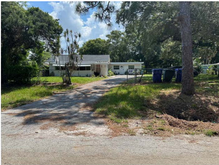
Across Sylvan Drive, to the east of the subject property