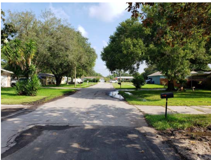
View looking northerly along East Drive