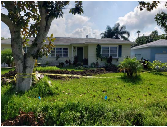
View looking east at subject property, 1861 East Drive.