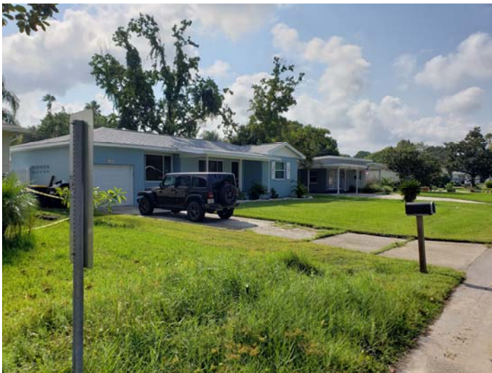
South of the subject property