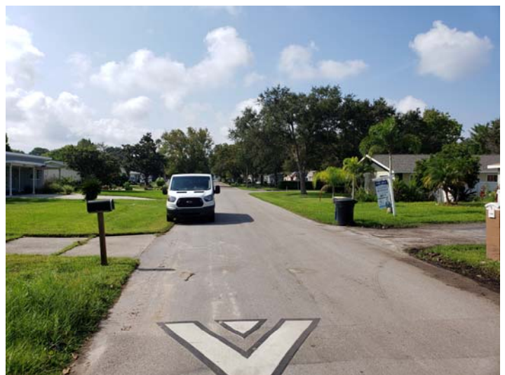
View looking southerly along East Drive

ANX2019-07017 Natalie and Roberto Rodriguez 1861 East Drive