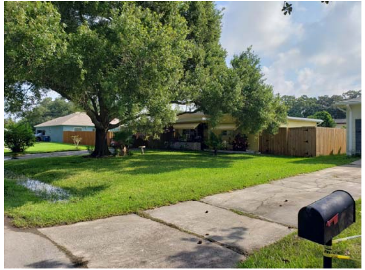
North of the subject property