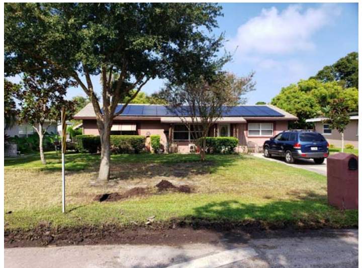
Across the street, to the west of the subject property