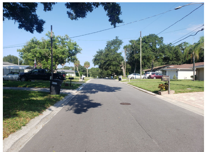
View looking westerly along Glen Oak Avenue N