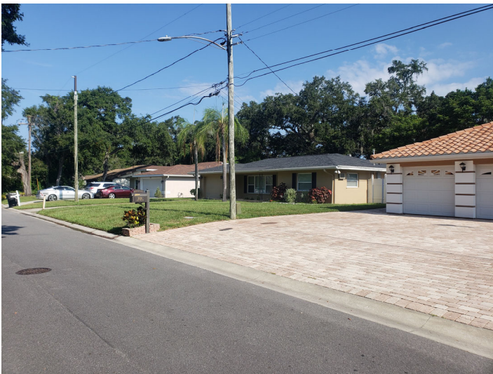
West of the subject property