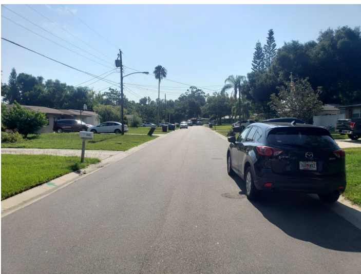
View looking easterly along Glen Oak Avenue N