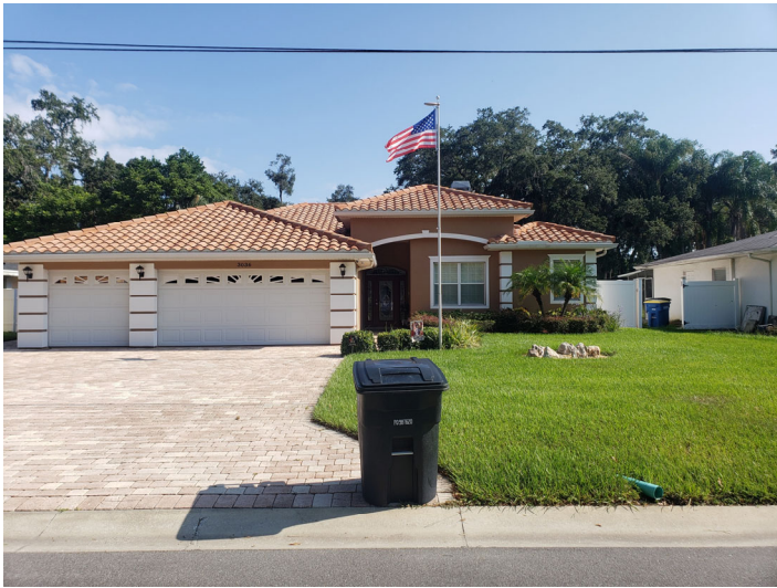
View looking north at subject property 3036 Glen Oak Avenue N