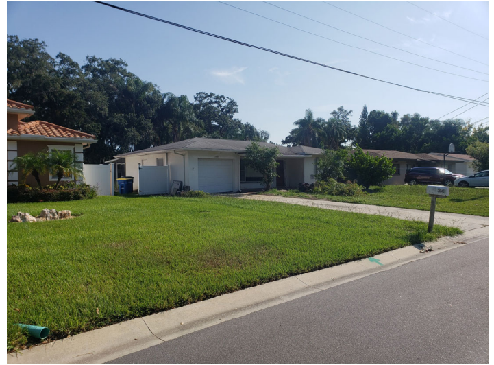
East of the subject property