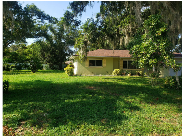
Across the street, to the south of the subject property