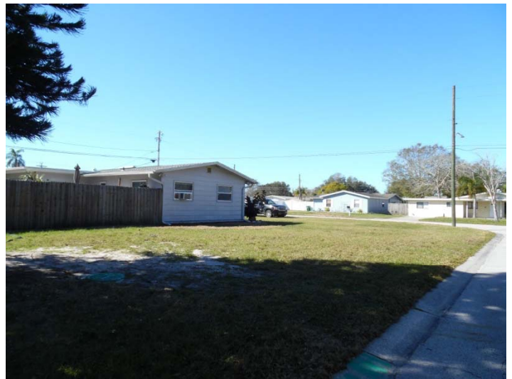
West of the subject property