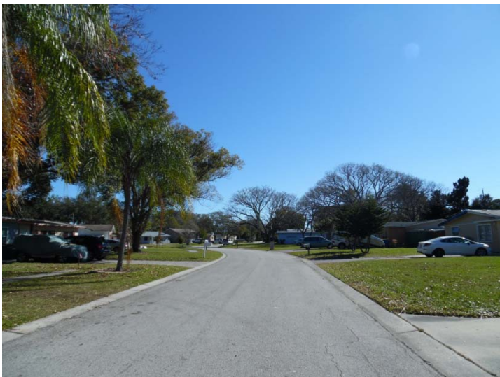
View looking easterly along St. John Drive