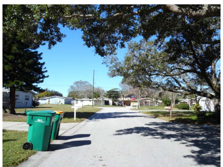
View looking westerly along St. John Drive