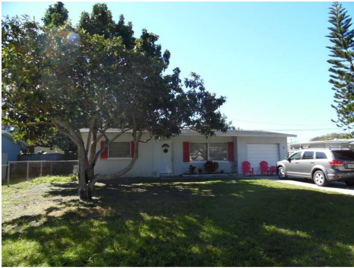
View looking south at the subject property, 2823 St. John Drive