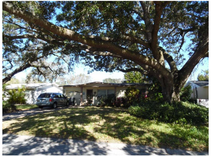
Across the street, north of the subject property