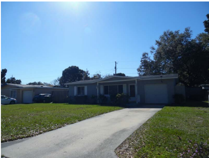
East of the subject property