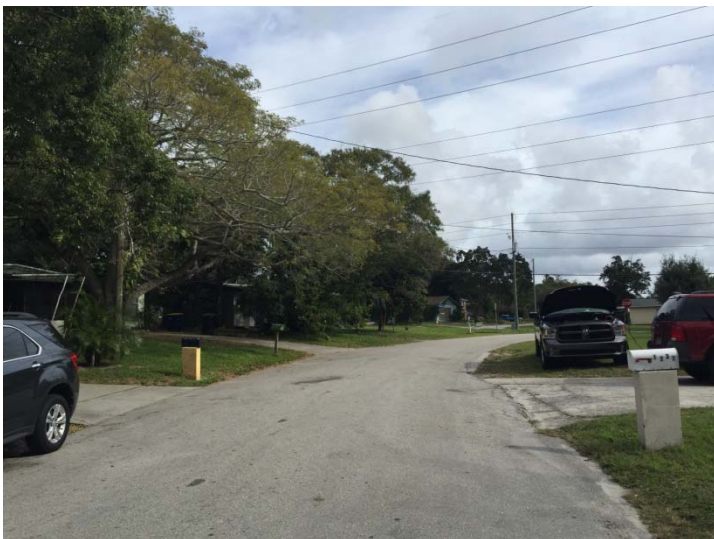
View looking easterly along Carol Drive