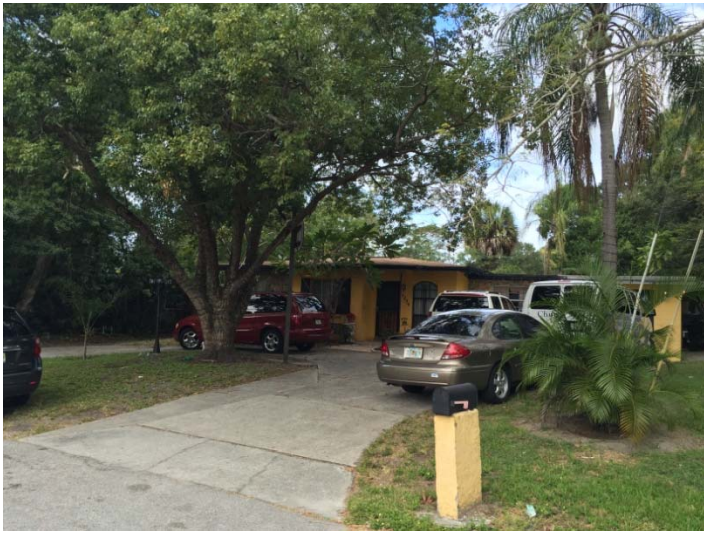
View looking north at the subject property, 1234 Carol Drive