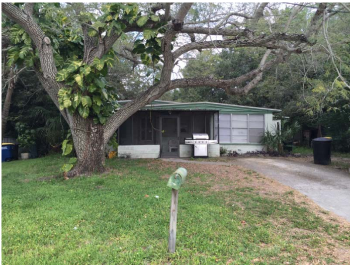
East of the subject property