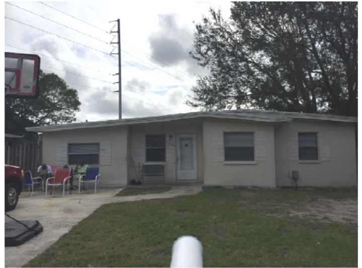
Across the street, south of the subject property