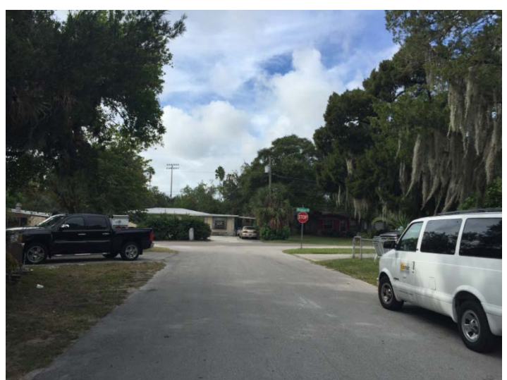
View looking westerly along Carol Drive