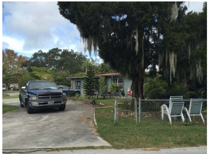
West of the subject property