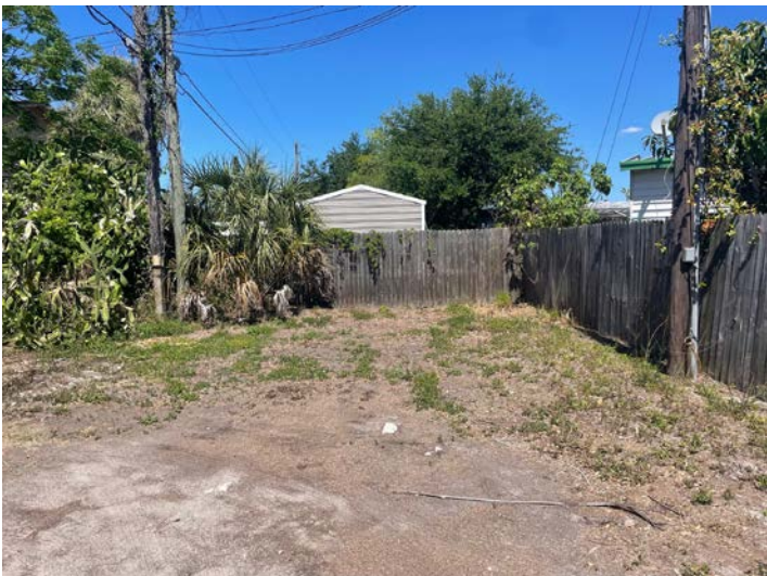
View looking northerly along Adams Avenue