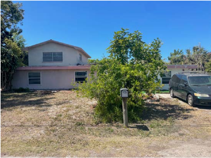
View looking west at subject property on Adams Avenue