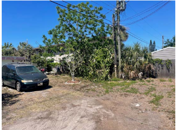
North of the subject property