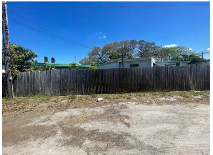
Across the street, to the east of the subject property