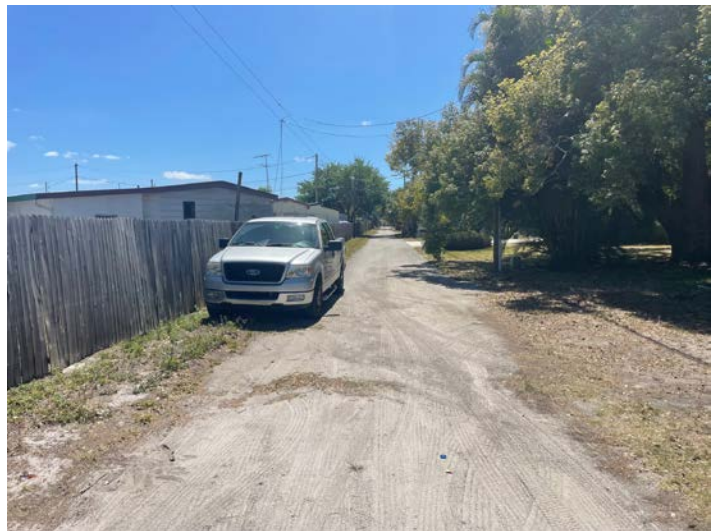
View looking southerly along Adams Avenue

ANX2022-11017 Juanito Gaspar 1224 Adams Avenue