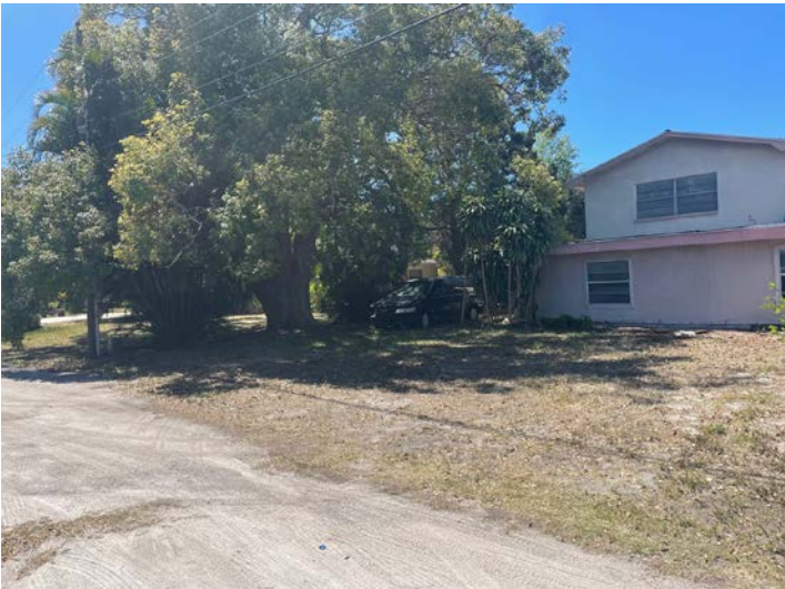
South of the subject property