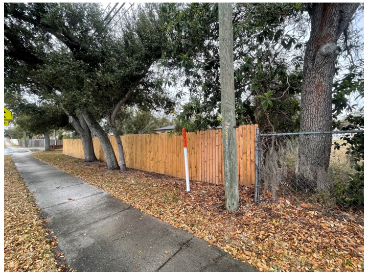
West of the subject property