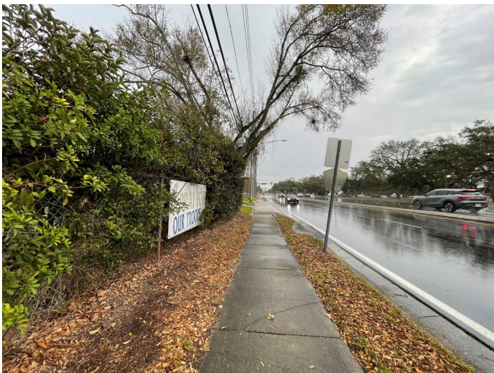
View looking easterly along Sunset Point Road