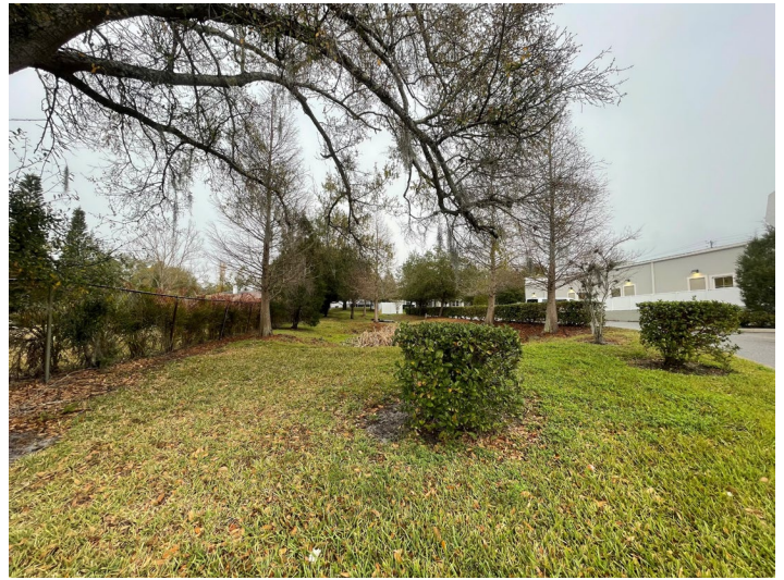
East of the subject property