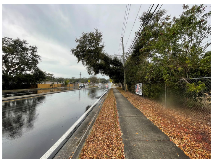
View looking westerly along Sunset Point Road

ANX2026-02003 Bryan M. Hall Unaddressed Sunset Point Road