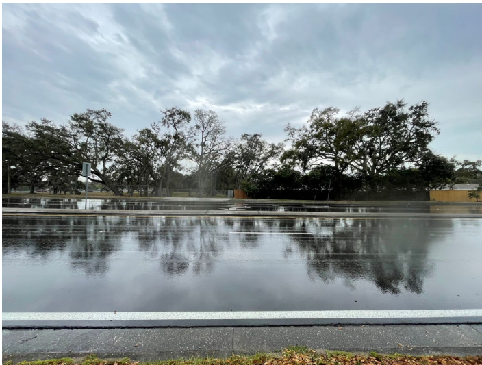
Across the street, to the south of the subject property