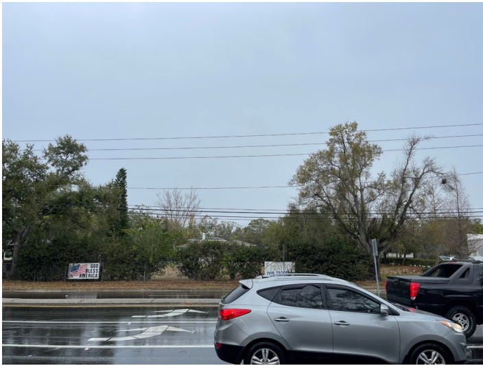
View looking north at the subject property, 0 Sunset Point Road