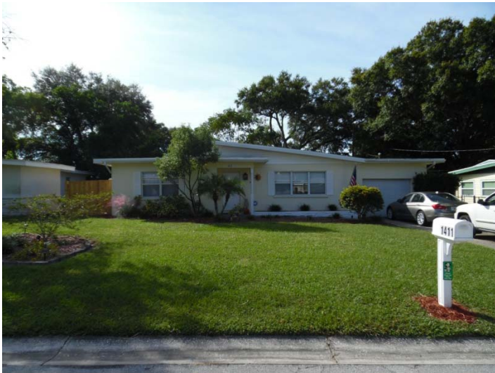
View looking south at the subject property, 1411 Lemon Street