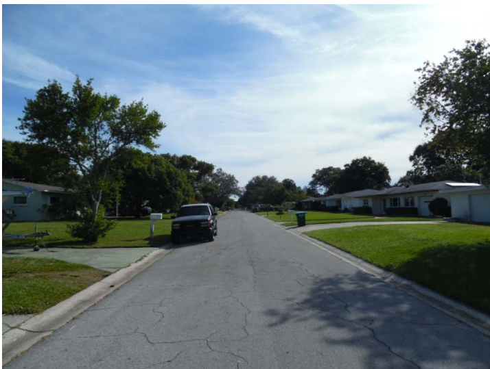
View looking easterly along Lemon Street