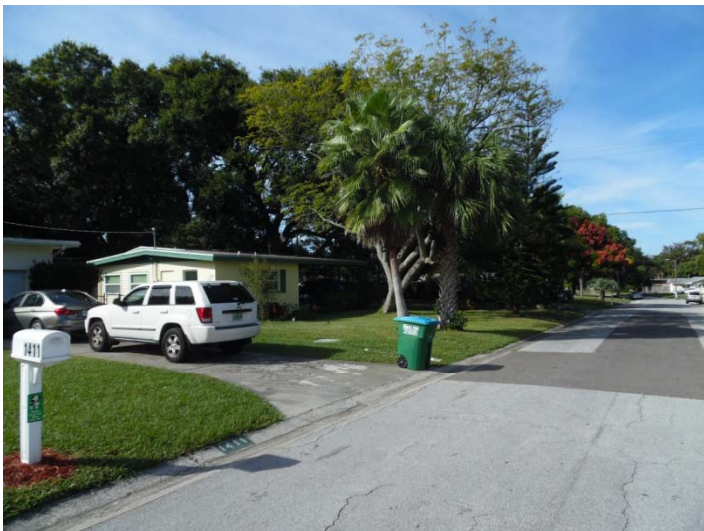
West of the subject property