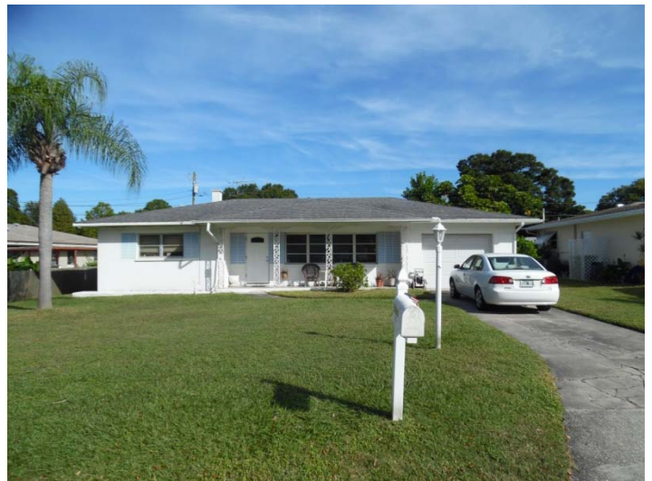
Across the street, to the north of the subject property