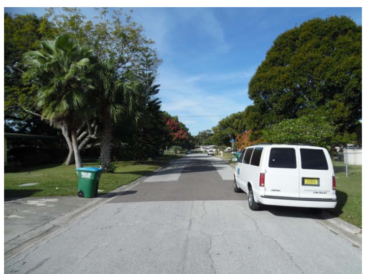
View looking westerly along Lemon Street

ANX2016-09030 David & Karla Deas 1411 Lemon Street