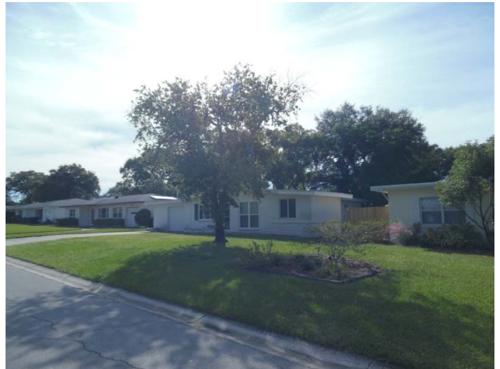
East of the subject property