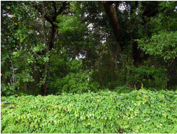
View looking west at the subject property, Unaddressed McMullen Booth Road