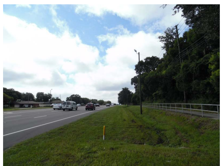
View looking southerly along McMullen Booth Road

LUP2015-09003, REZ2015-09002 HR Tampa Bay LLC 2425 McMullen Booth Road