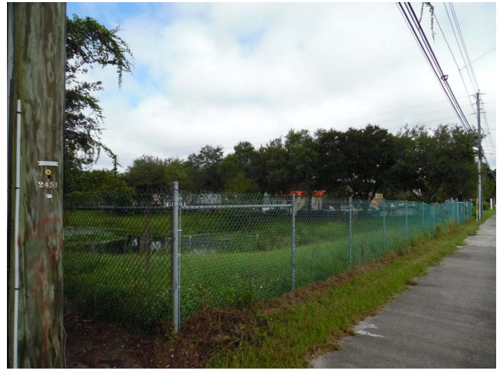
North of the subject property