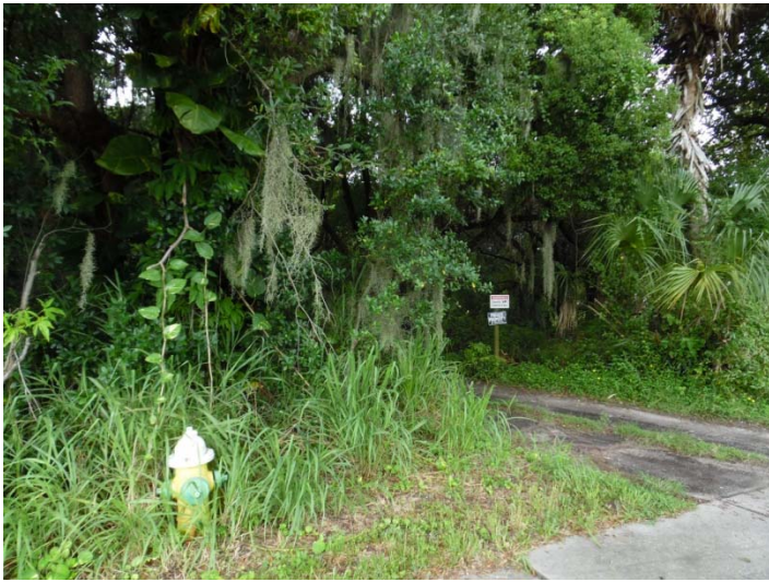
View looking west at the subject property, 2425 McMullen Booth Road