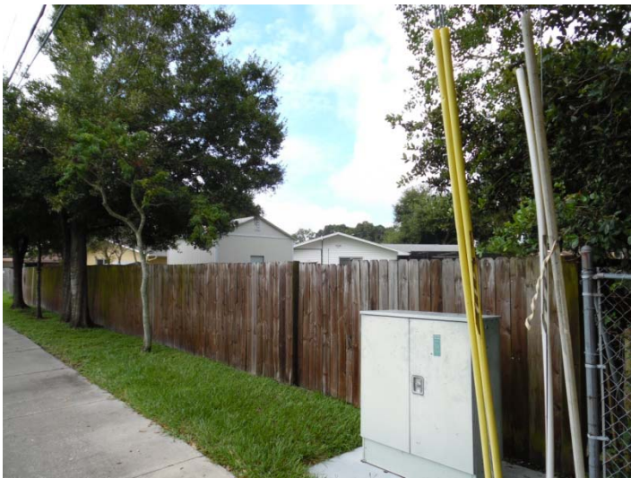
South of the subject property