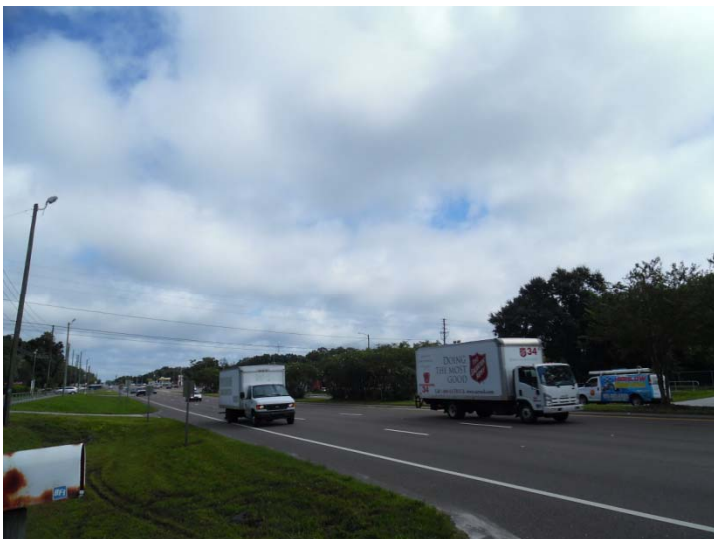
View looking northerly along McMullen Booth Road