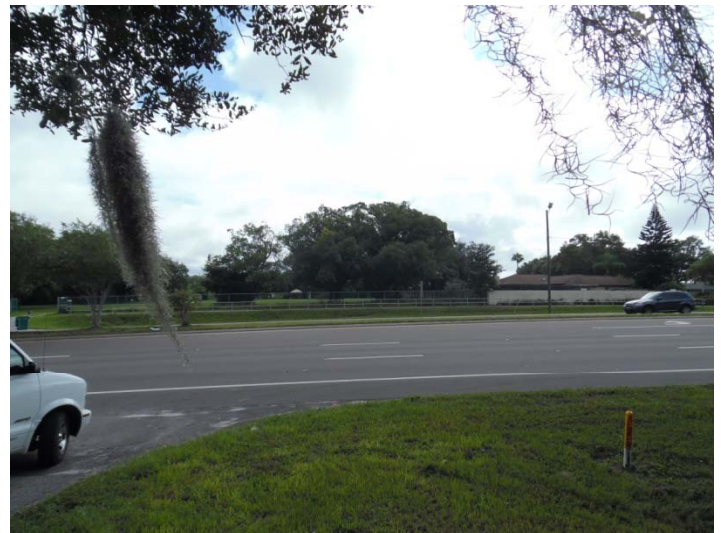
Across the street, to the east of the subject property