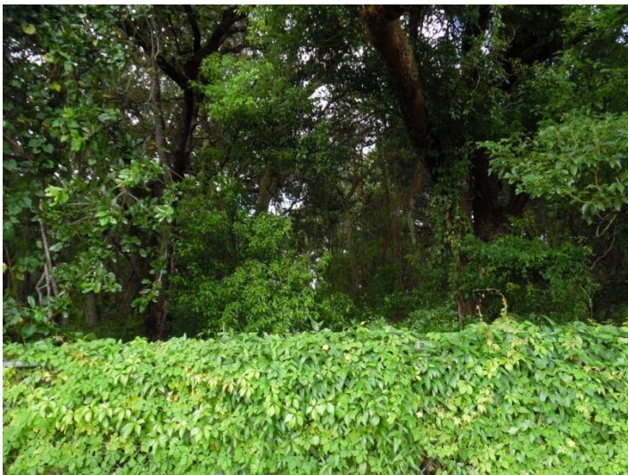
South of the subject property