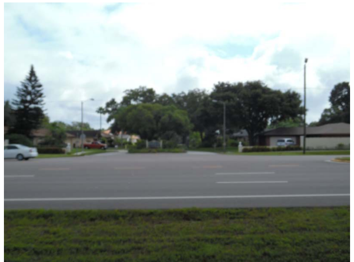
Across the street, to the east of the subject property