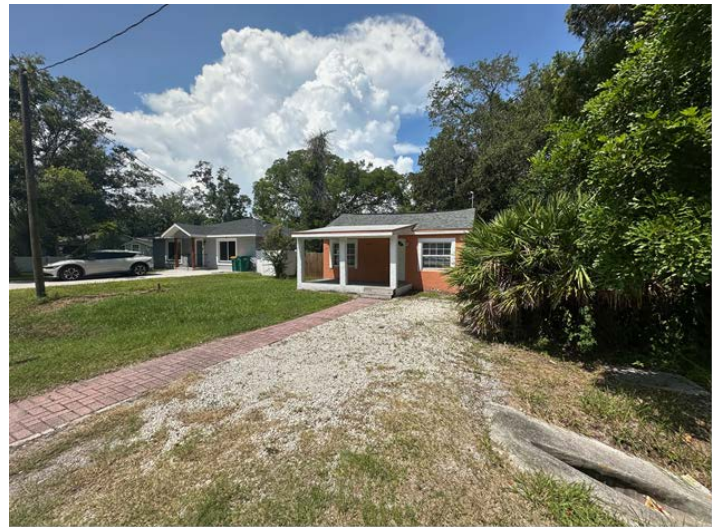
South of the subject property