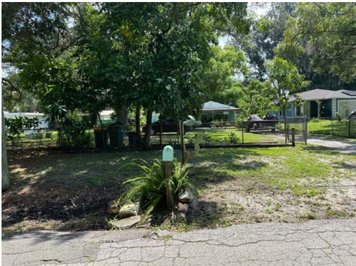
Across Sylvan Drive, to the east of the subject property