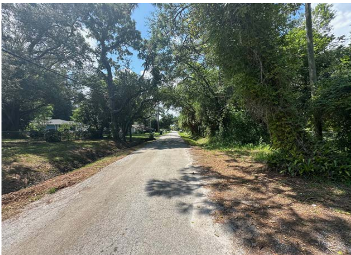
View looking northerly along Sylvan Drive