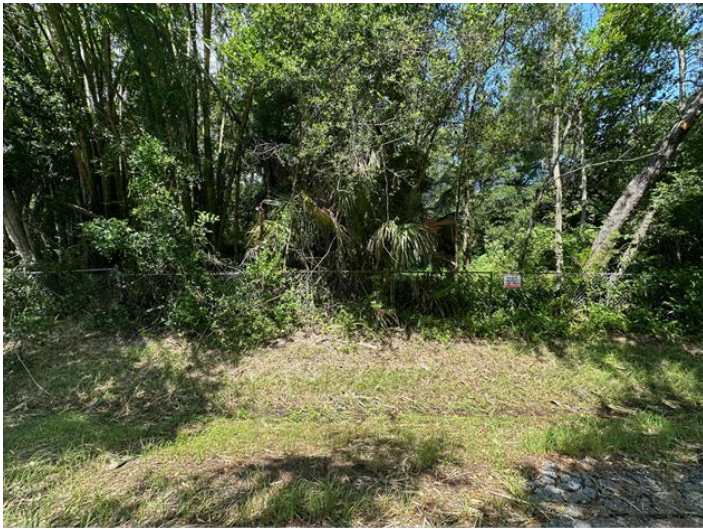
View looking west at the subject property