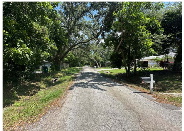
View looking southerly along Sylvan Drive

ANX2024-07005 Cozy Homes LLC and L & R Luxury Homes LLC Unaddressed Sylvan Drive