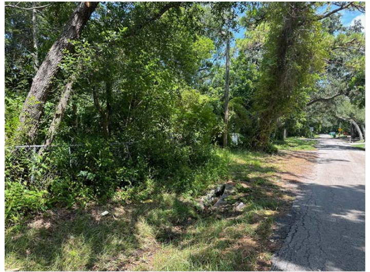
North of the subject property