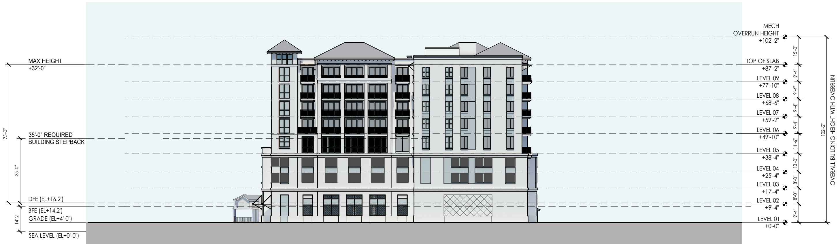
2 EASTERN ELEVATION 1" = 30'