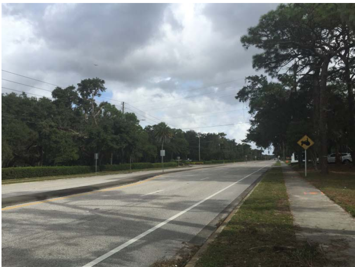
View looking easterly along Sunset Point Road