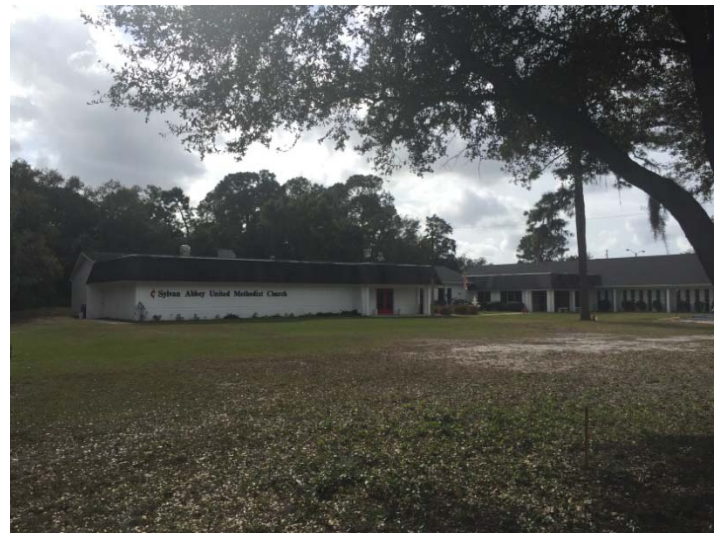
West of the subject property