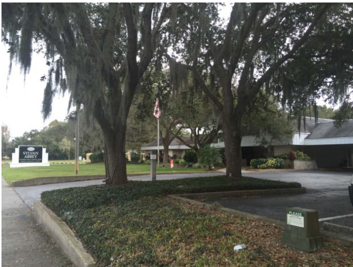
East of the subject property