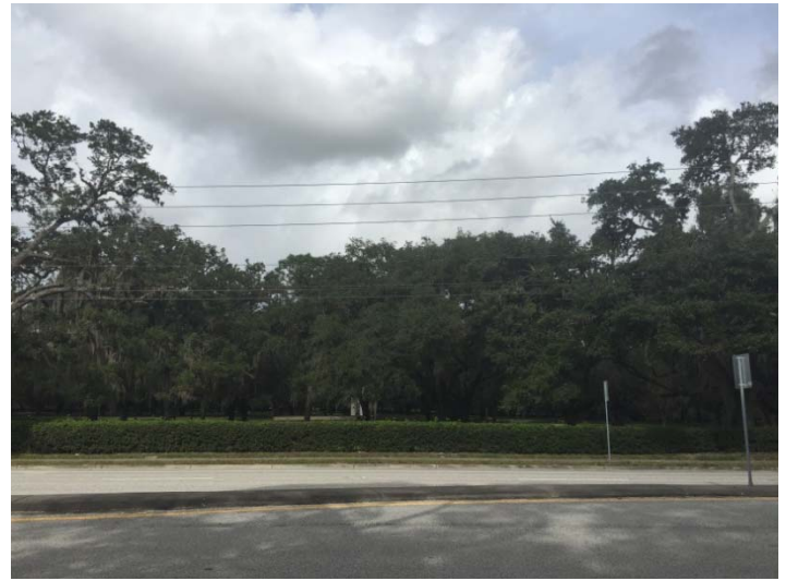
Across the street, north of the subject property