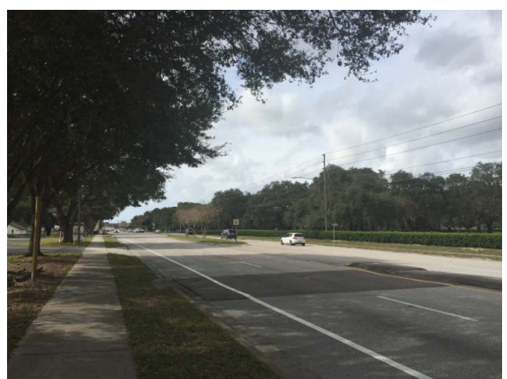
View looking westerly along Sunset Point Road

ANX2015-11033 S. E. Combined Services of Florida, LLC 2829 Sunset Point Road