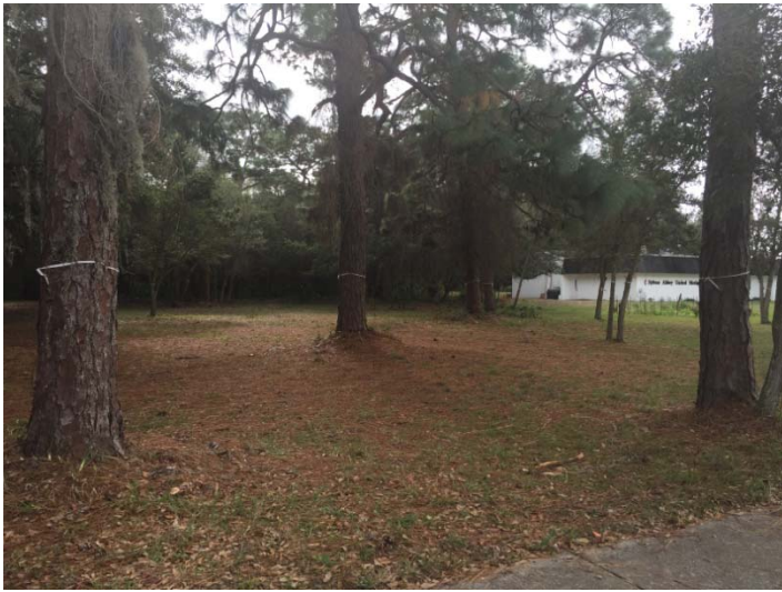
View looking south at the subject property, 2829 Sunset Point Rd