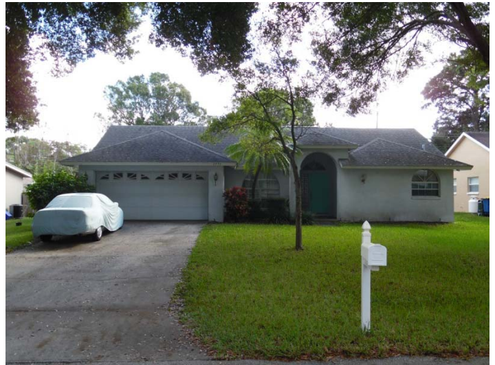
Across the street, to the east of the subject property