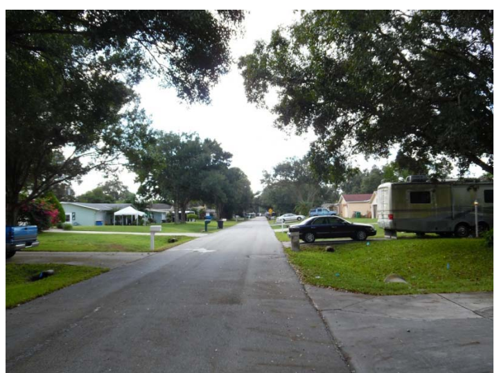
View looking southerly along El Trinidad Drive

ANX2015-10028 BREP 1-2 LLC 1764 El Trinidad Drive