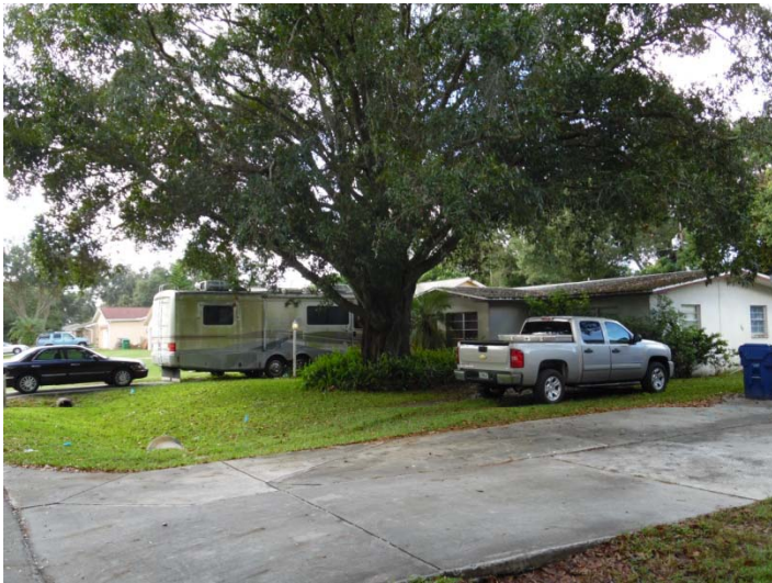
South of the subject property