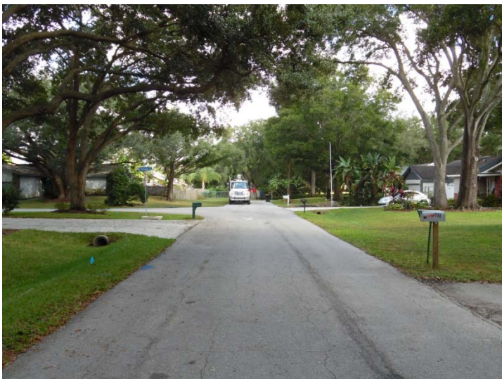
View looking northerly along El Trinidad Drive