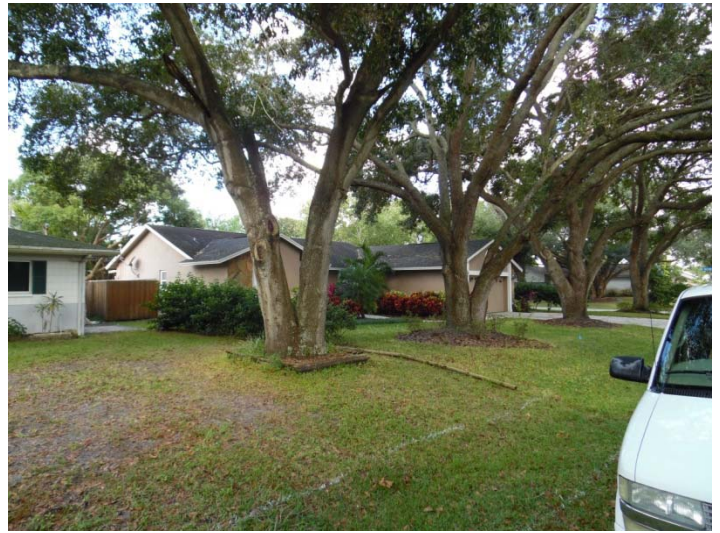
North of the subject property