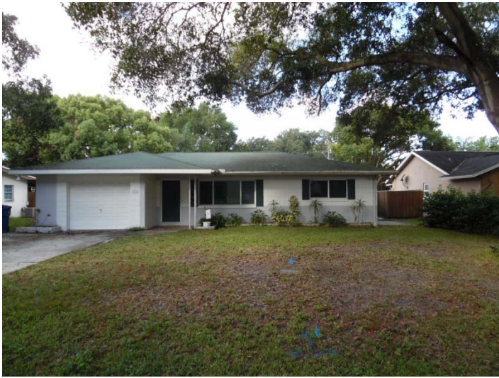
View looking west at the subject property, 1764 El Trinidad Drive