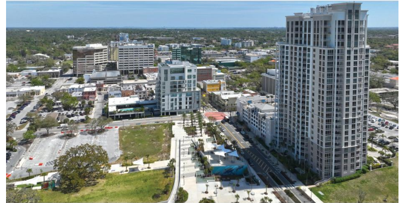
CLEARWATER COMMUNITY REDEVELOPMENT AGENCY COMMUNITY OUTREACH MEETING