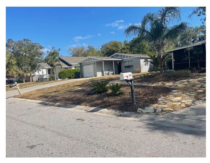
North of the subject property