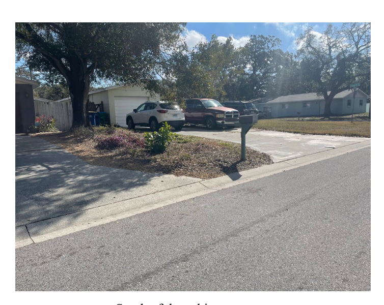
South of the subject property