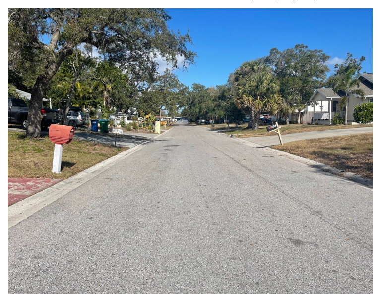
View looking northerly along Poinsetta Avenue