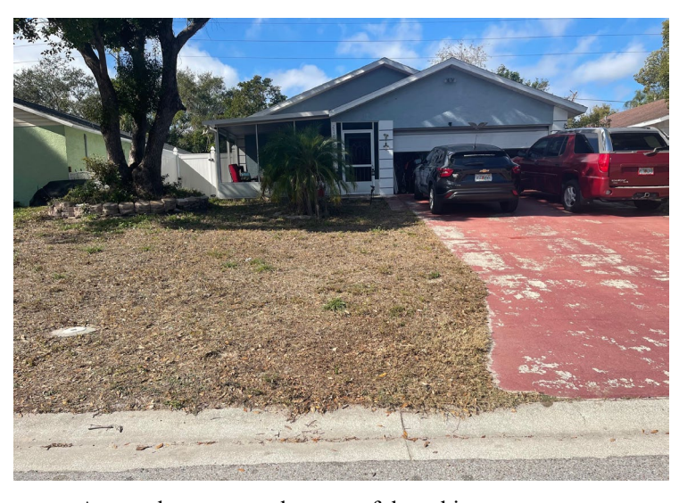
Across the street, to the west of the subject property