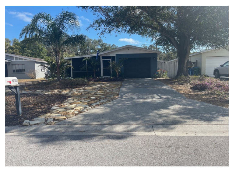
View looking east at the subject property, 2039 Poinsetta Avenue