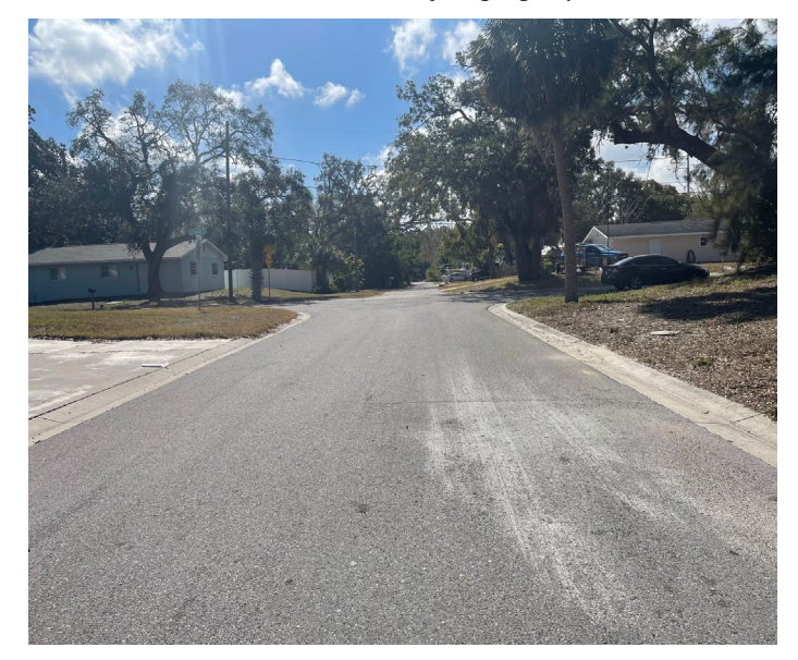
View looking southerly along Poinsetta Avenue

ANX2025-01001 Joseph & Anne Reed 2039 Poinsetta Avenue