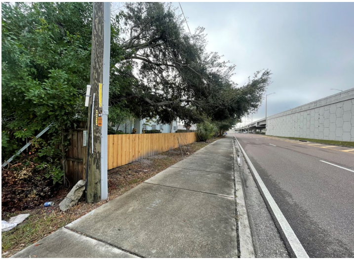
South of the subject property