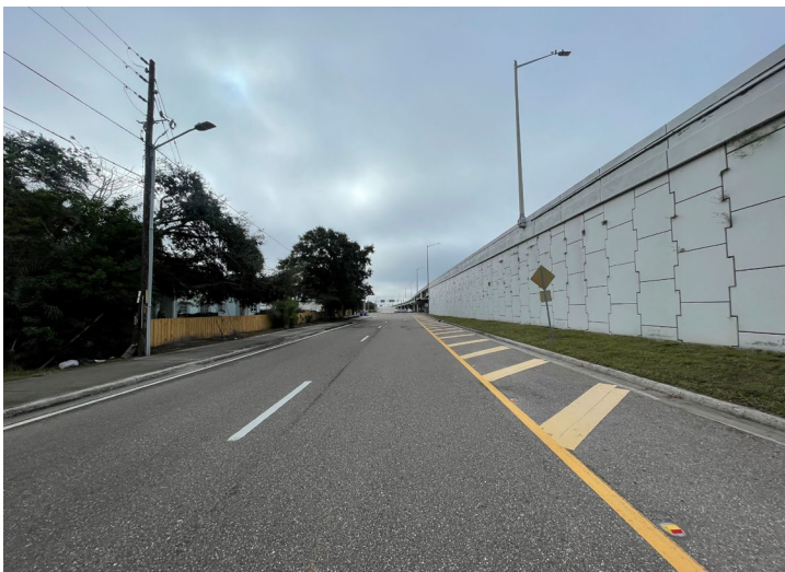
Facing south along S. McMullen Booth Road