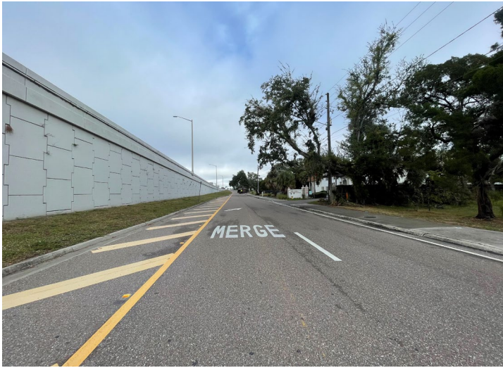
View looking north along S. McMullen Booth Road