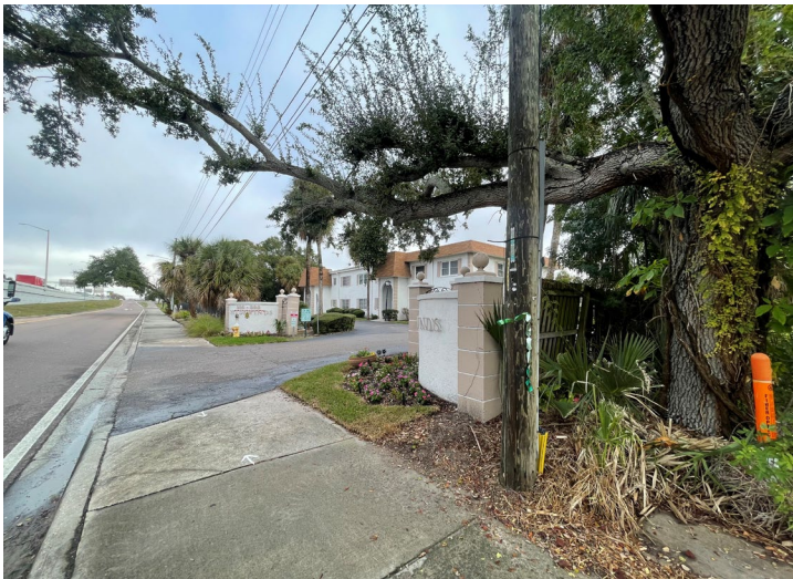
North of the subject property