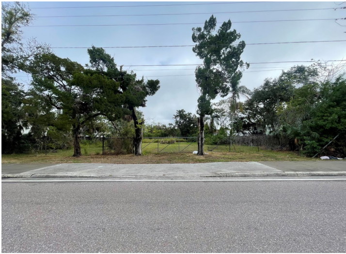
Facing east at the subject property, from McMullen Booth Road