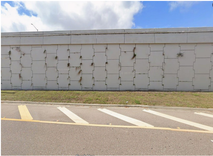
Across the street, to the west of the subject property