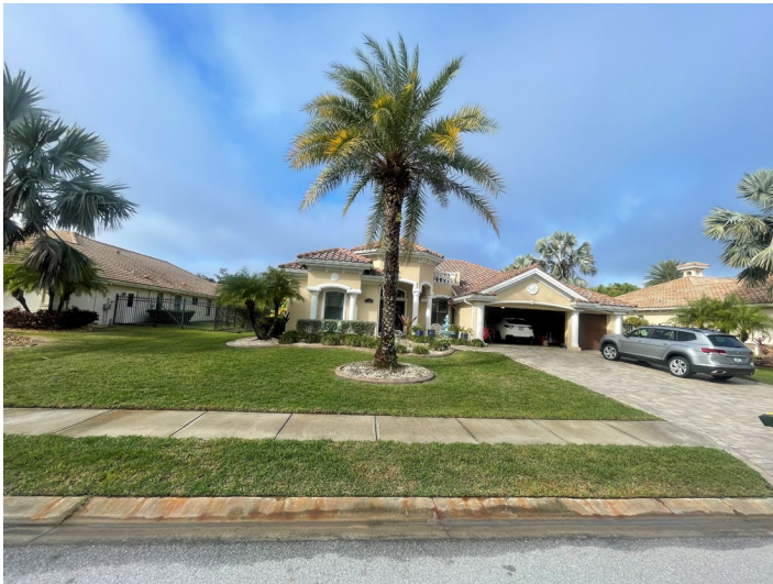
Across the street, to the West of the subject property