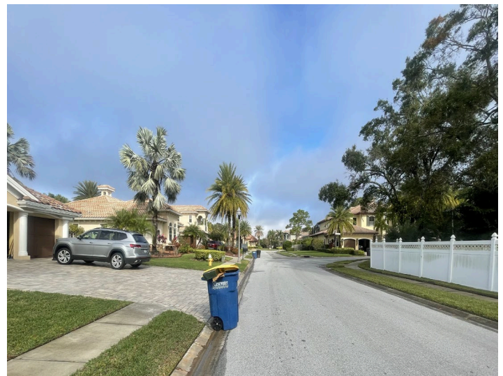
Facing north along Lauren Lane, subject property located to the right