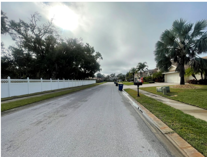
Facing South along Lauren Lane, subject property located to the right