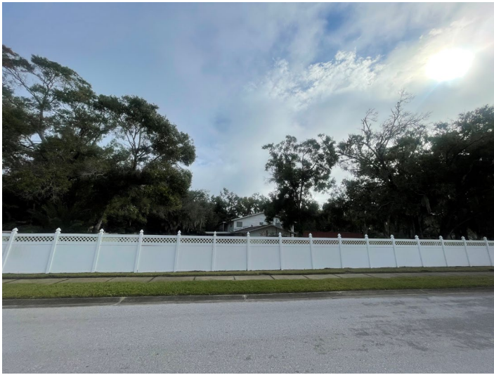
Facing east towards the subject property, 2265 North McMullen Booth Road