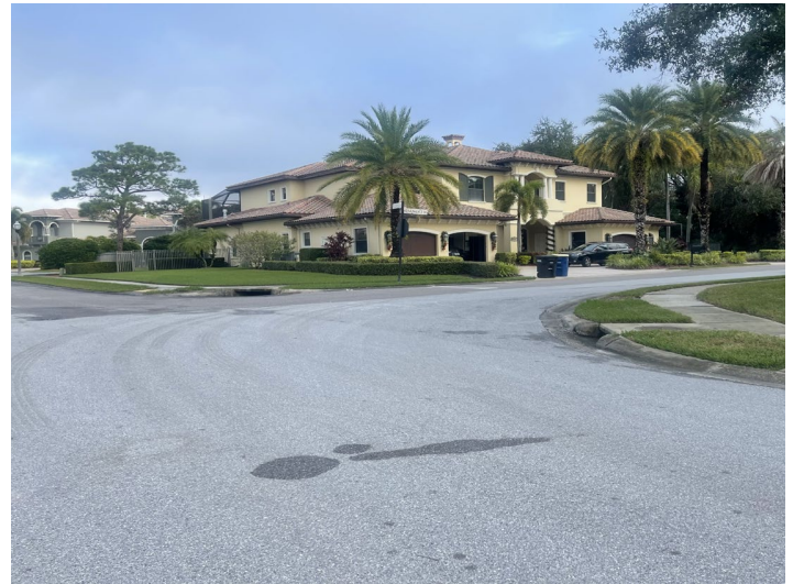
North of the subject property