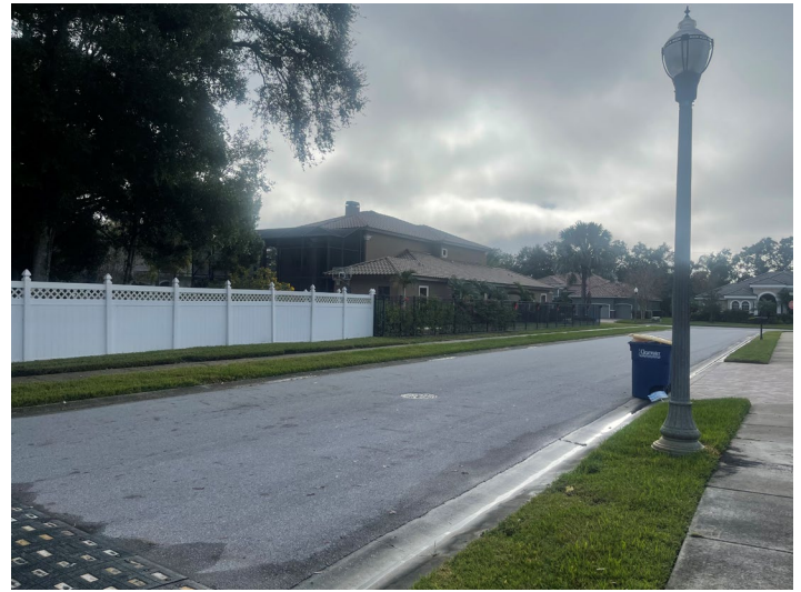
Side of Lauren Lane facing of the subject property