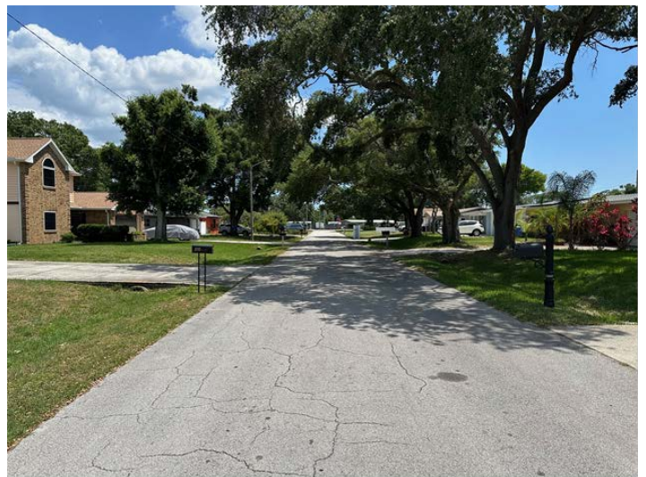
View looking southerly along El Trinidad Drive East

ANX2024-07003 Timothy and Rebecca Gleeson 1721 El Trinidad Drive East