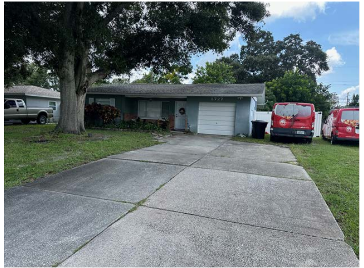
North of the subject property