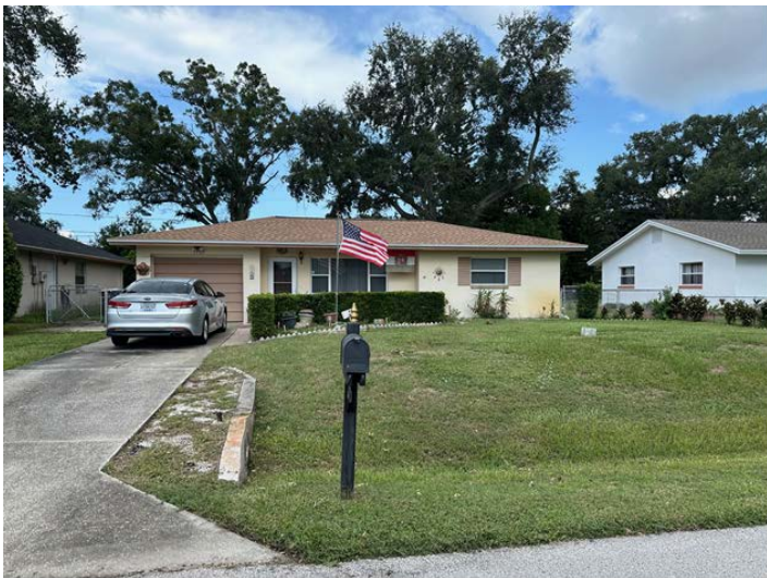
Across the street, to the west of the subject property