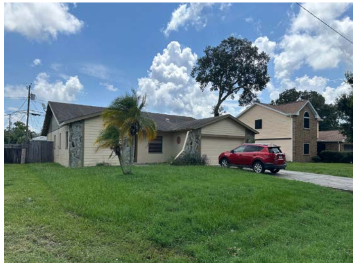
South of the subject property