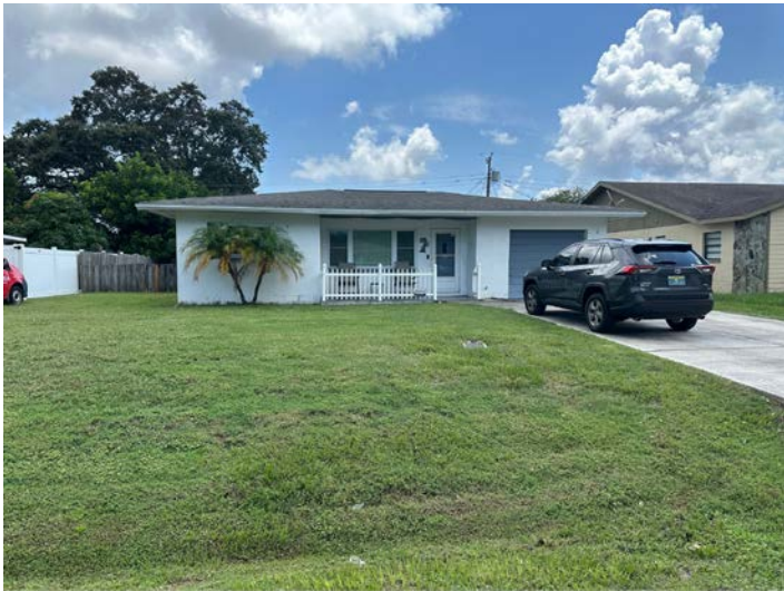
View looking east at the subject property