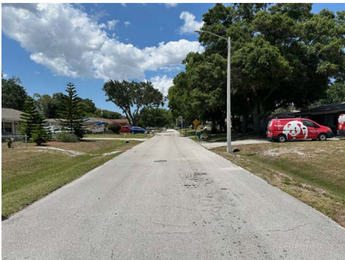
View looking northerly along El Trinidad Drive East