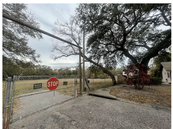
View looking east of subject property

ANX2026-02004 City of Clearwater 1399 Pineapple Lane