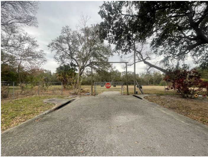
View looking south at the subject property, 1399 Pineapple Lane