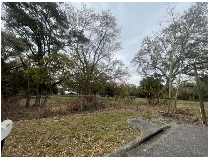
View looking west of subject property