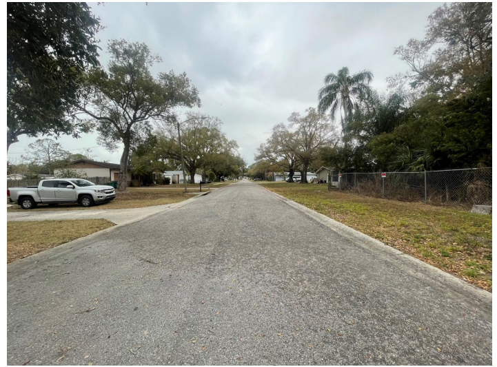
View looking north from the subject property