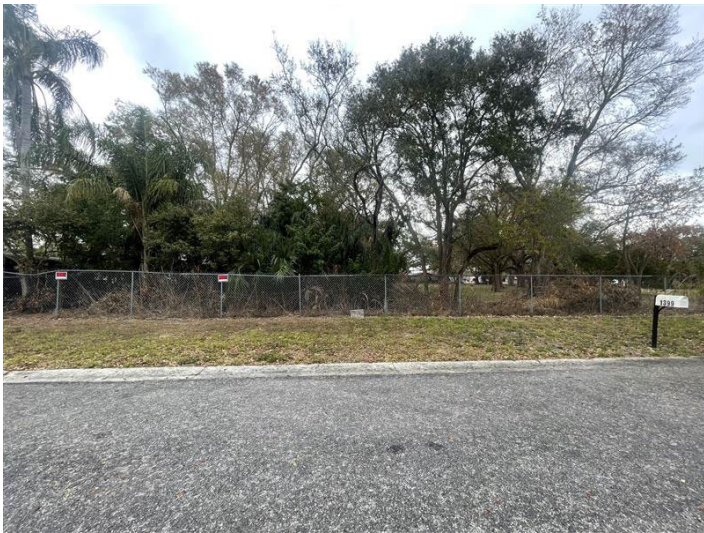
West of the subject property