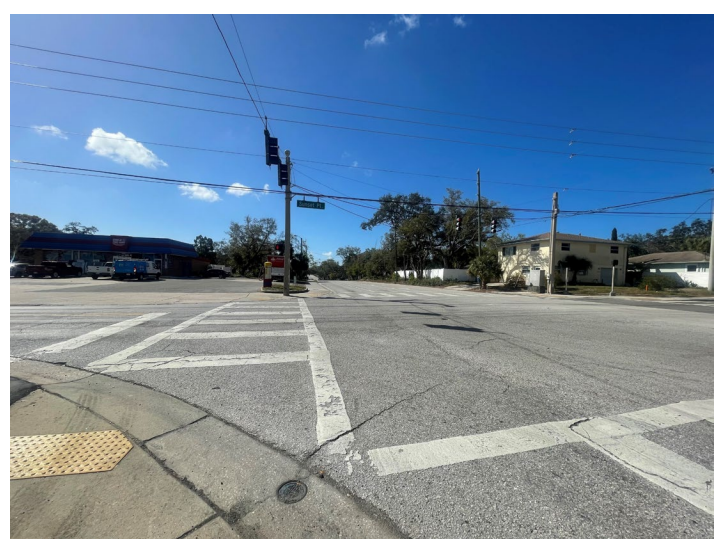
View looking south, along Douglas Avenue

ANX2026-01001 Abdalla Salous & Samaher Salous 1903 Douglas Avenue