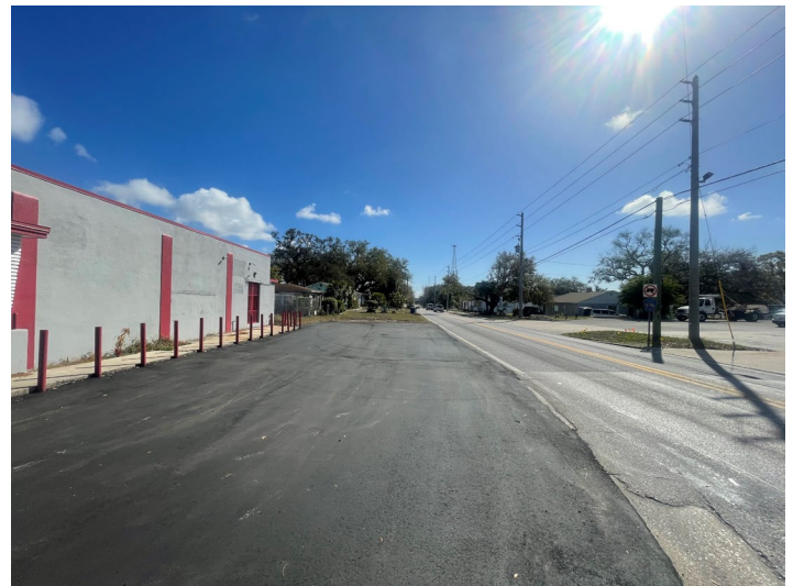
West of the subject property, along Sunset Point Road.