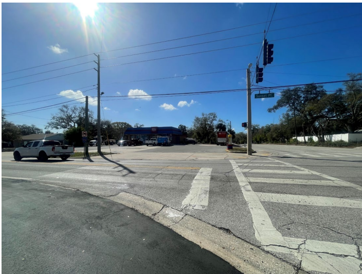
Across Sunset Point Road, to the south of the subject property.