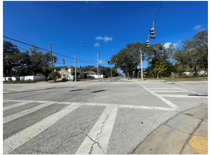
East of the subject property, along Sunset Point Road.