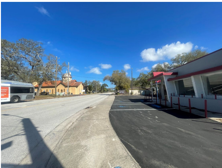
View looking north, along Douglas Avenue