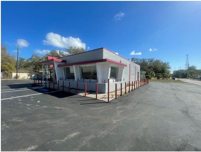
View looking northeast at the subject property, 1903 Douglas Avenue.