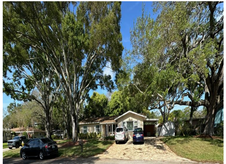
Across the street, to the west of the subject property