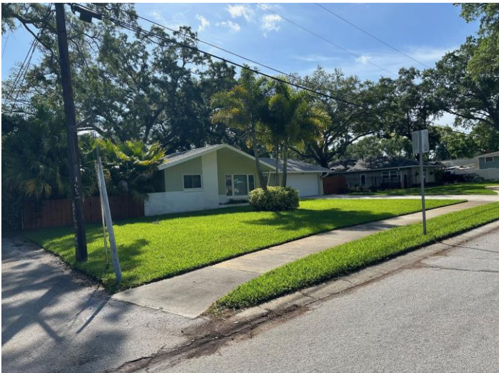
South of the subject property