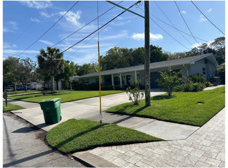
North of the subject property