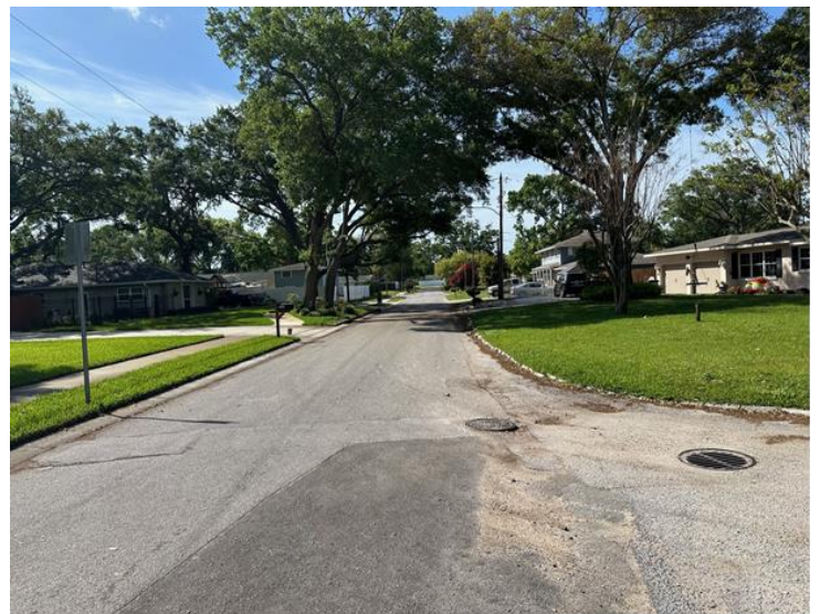
View looking easterly along Brookside Drive

ATA2024-03002 Henry McCullough 1239 Brookside Drive