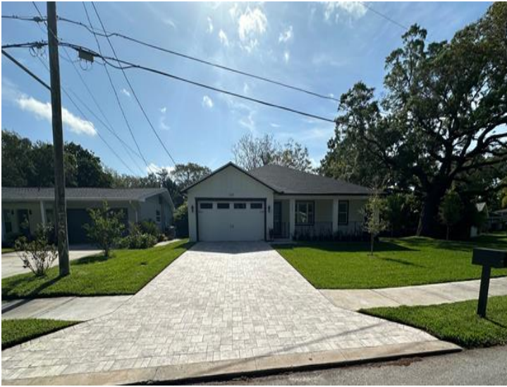
View looking east at subject property on Brookside Drive