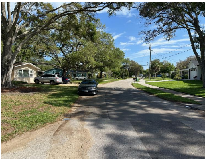
View looking northerly along Brookside Drive