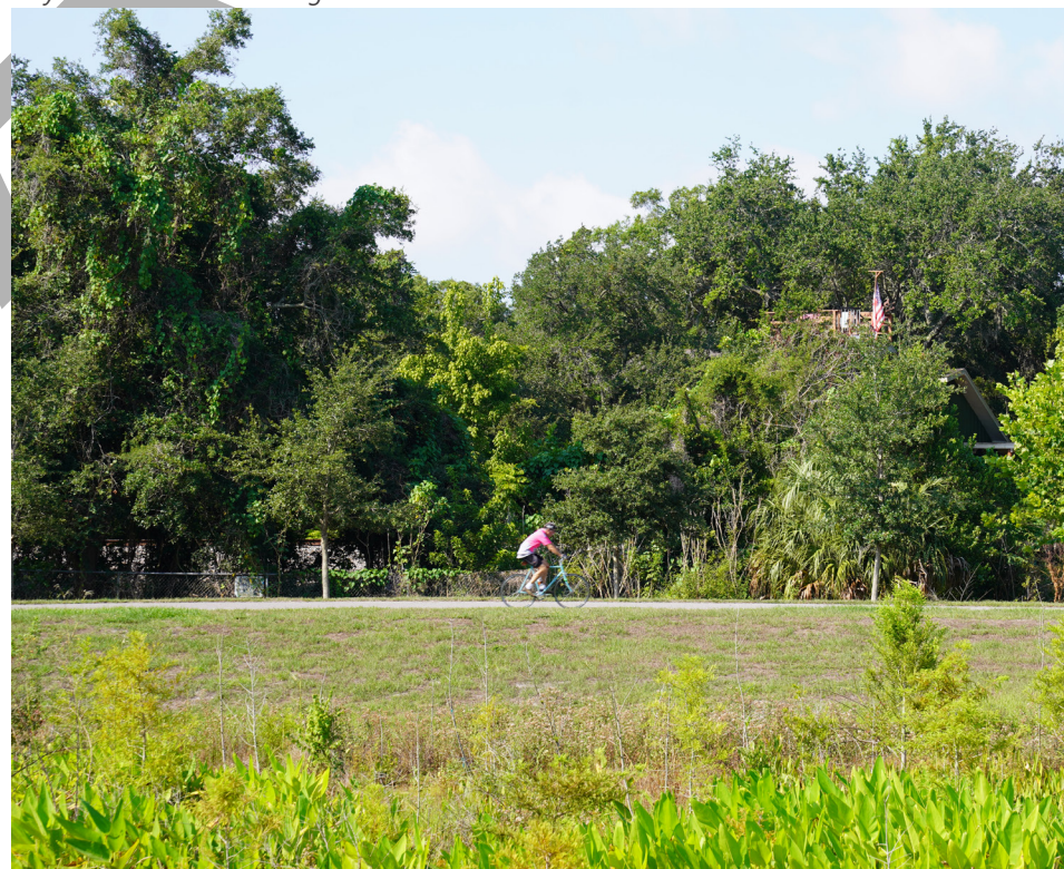
Bicyclist at Coachman Ridge

Provide new access or enhance/maintain existing access to blueways where possible for recreational use.