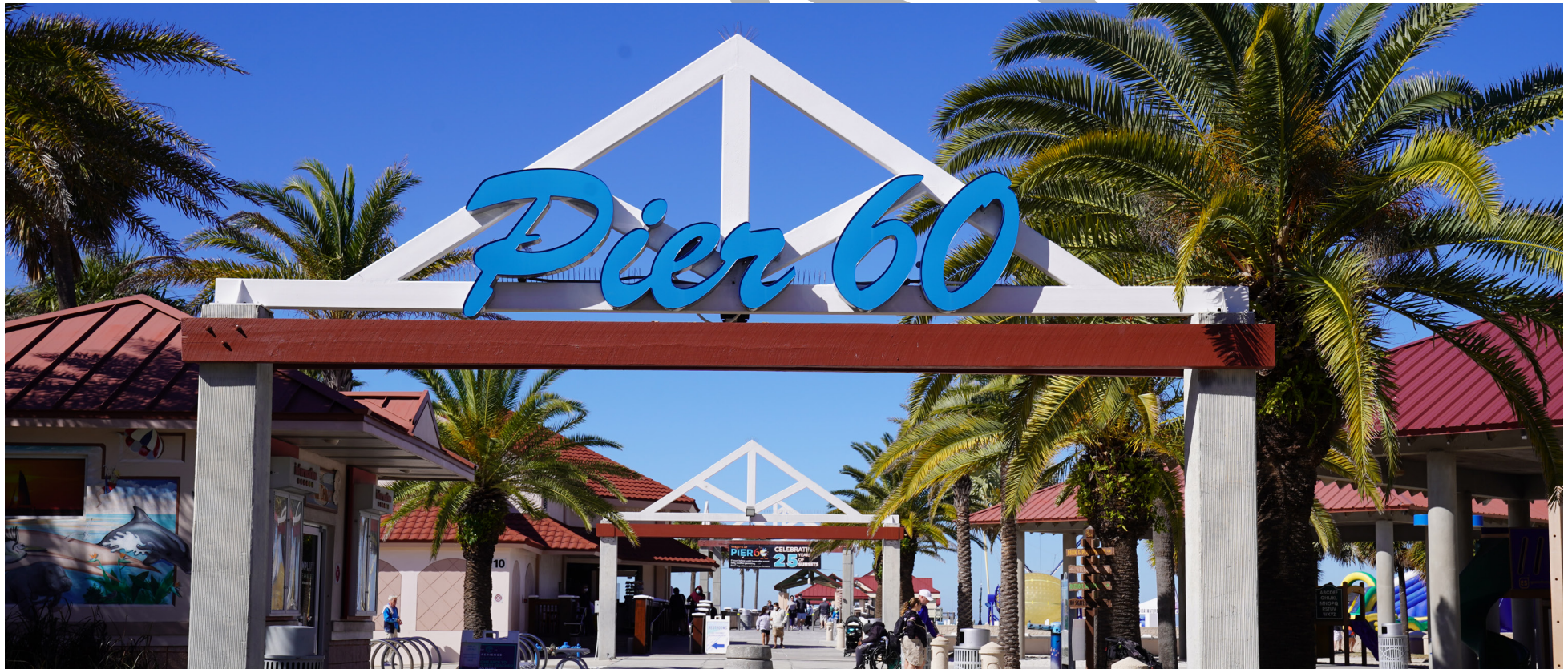
Pier 60 Park

The city is also currently providing just over twice as much acreage of core parkland acreage, 8.85 acres per 1,000 people, then the current adopted LOS of 4 acres per 1,000 people. Core parkland is defined as community, neighborhood, and environmental parks, with the city currently providing 1,048.38 acres of core parkland. Additionally, the city maintains 722.17 acres of special facilities and open space parkland. When coupled with core parkland, the city has a total of 1,770.55 acres in total parkland, which equates to 14.94 acres per 1,000 residents, based on 2022 population estimates. Currently, there are 109 parks within the city broken down as follows: 7 community, 28 environmental, 24 neighborhood, 23 open space, and 27 special facilities which include golf courses, baseball/softball fields, or multiuse fields.