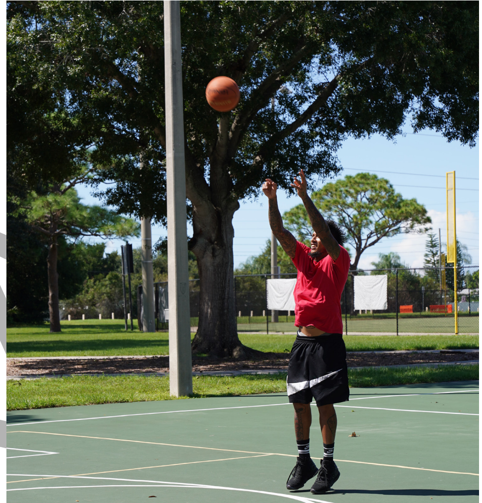
Outdoor Basketball at Countryside Recreation Center

Continue to implement the priority, medium-term and long-term actions, and continuous actions/policies as detailed in the 2013 Parks and Recreation System Master Plan as funds become available.