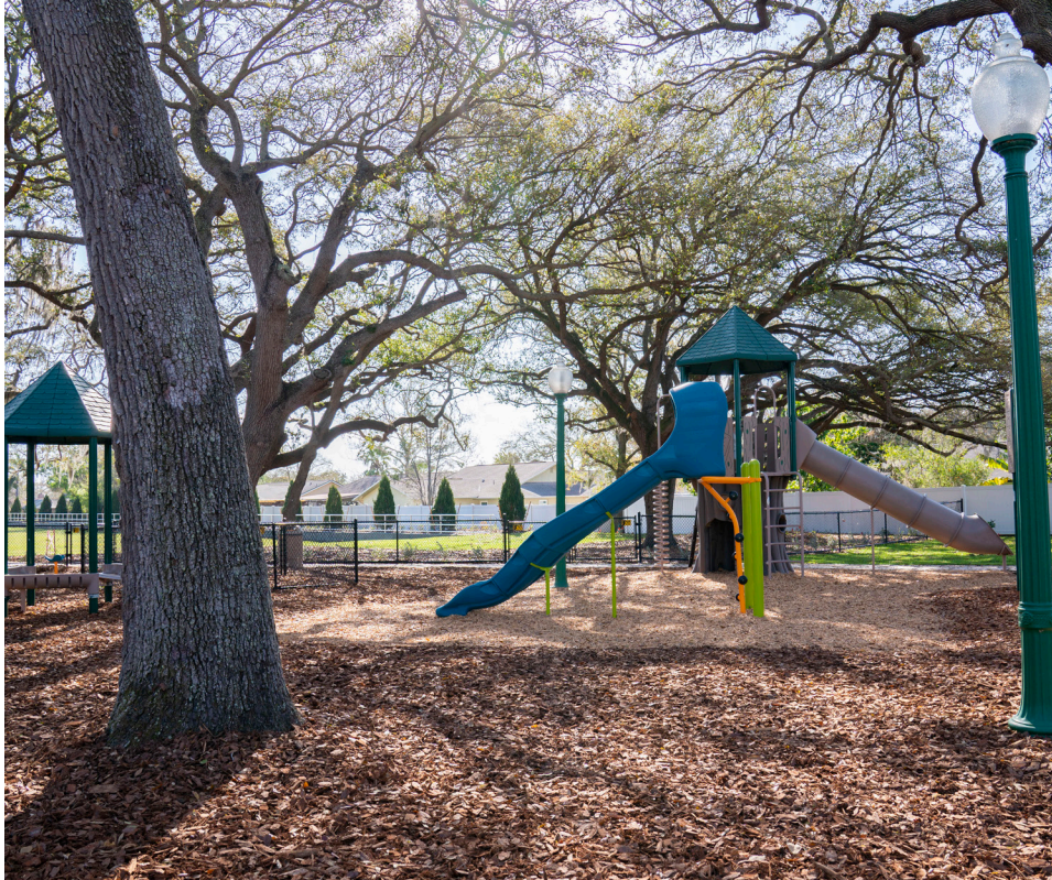
Playground at Del Oro Park

Continue to locate new community parks and expansions to existing community parks adjacent to arterial streets and/or transit routes whenever possible.