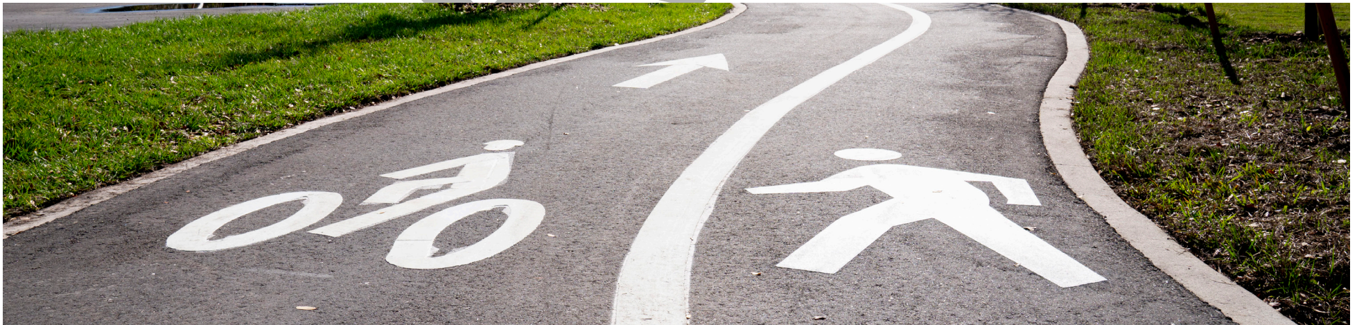
Shared Use Path

Continue to provide accessible bicycle parking at all park and recreation facilities.