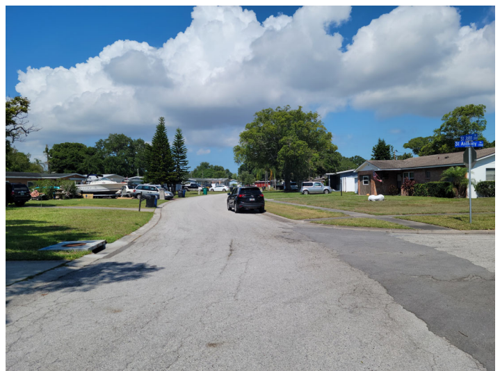
View looking westerly along St. John Drive