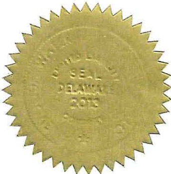
Authorized Signature Title