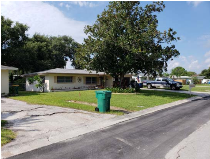
West of the subject property