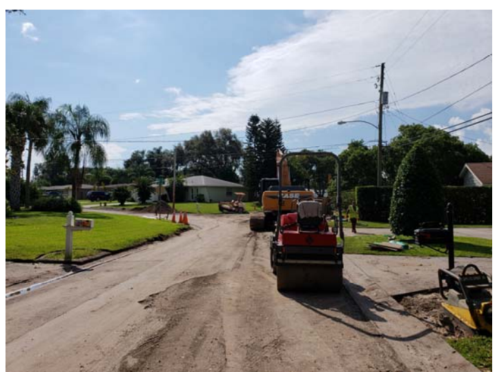
View looking southerly along Moss Avenue