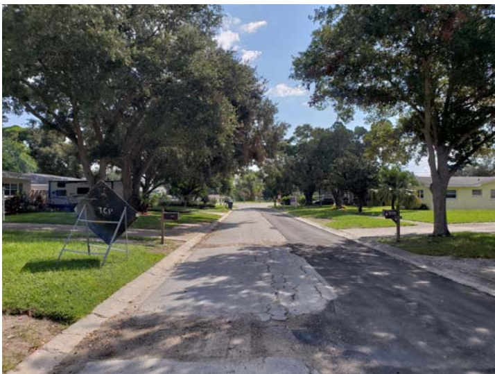
View looking easterly along Grand View Avenue