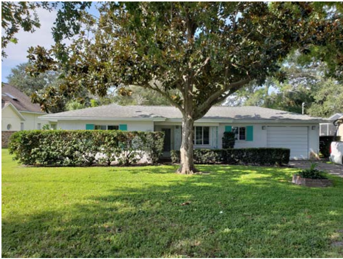
View looking west at subject property, 806 Moss Avenue.