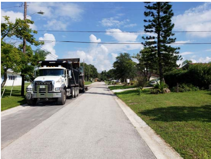
View looking northerly along Moss Avenue