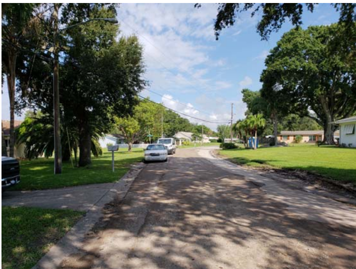
View looking northerly along Moss Avenue