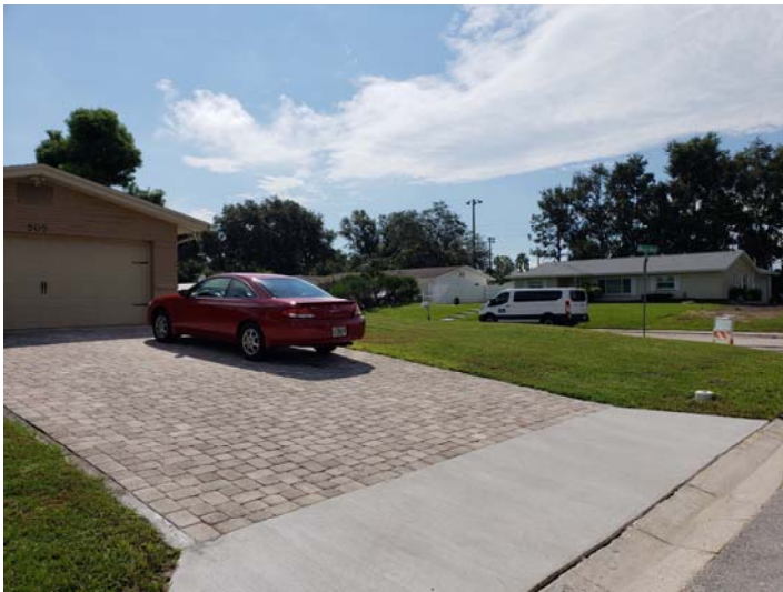
South of the subject property