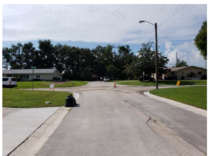
View looking southerly along Moss Avenue

ANX2018-09018 Anthony Masselli 505 Moss Avenue