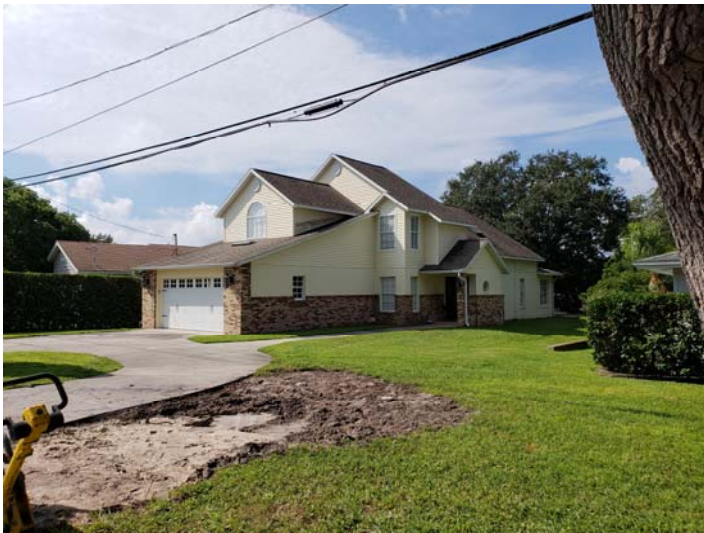
South of the subject property