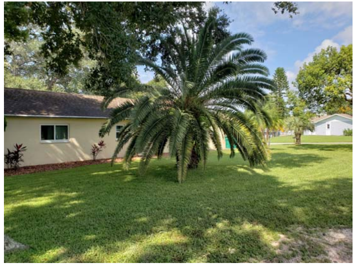
North of the subject property