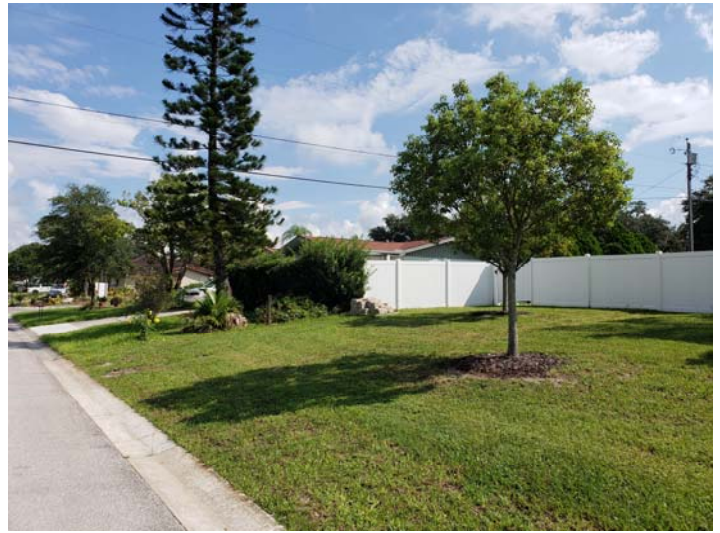
North of the subject property