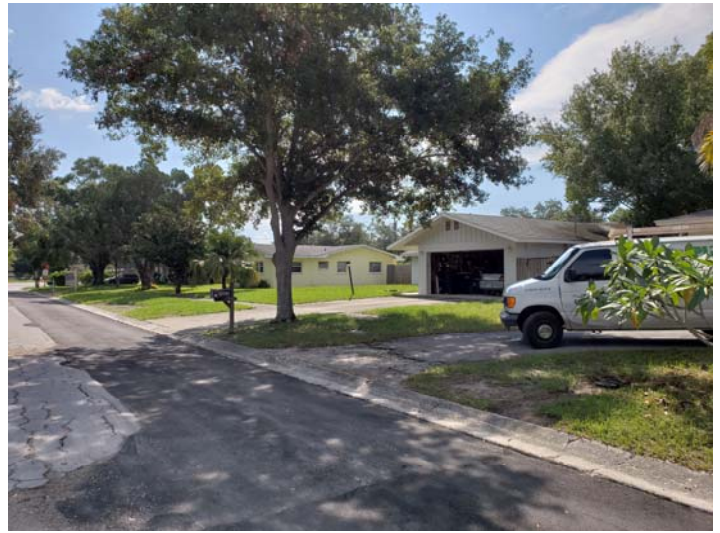
East of the subject property