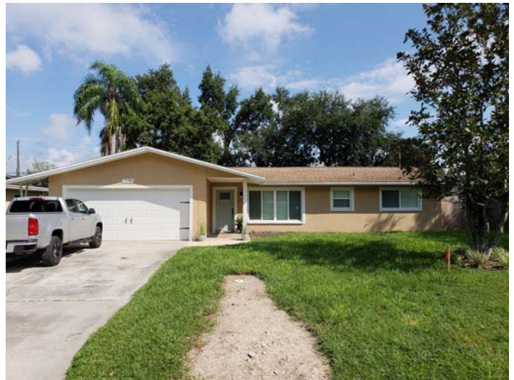
Across the street, to the north of the subject property