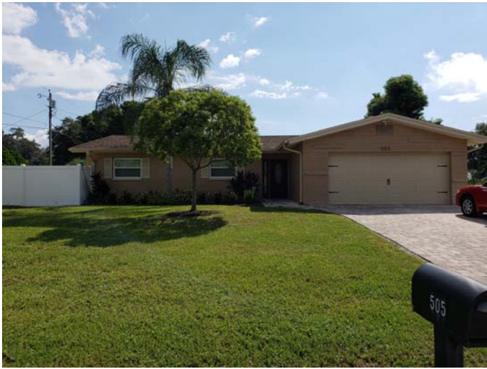
View looking east at subject property, 505 Moss Avenue.