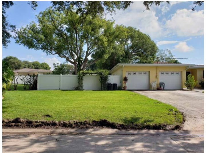
Across the street, to the east of the subject property