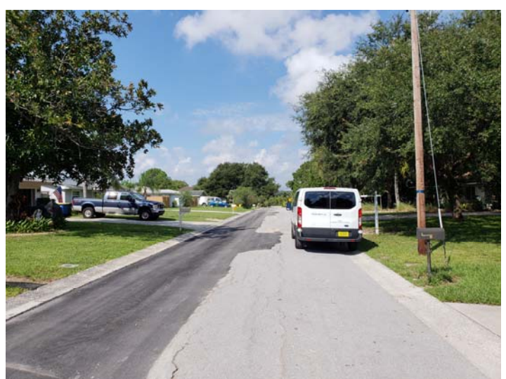
View looking westerly along Grand View Avenue

ANX2018-09018 Cynthia Howard 3059 Grand View Avenue