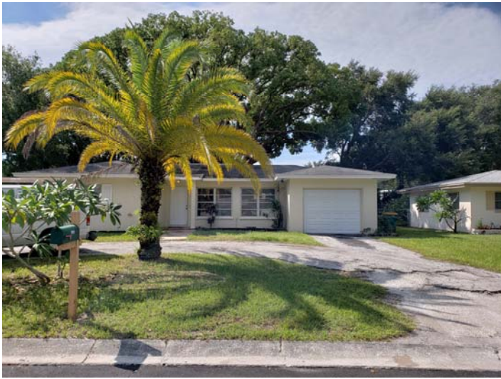
View looking south at subject property, 3059 Grand View Avenue.