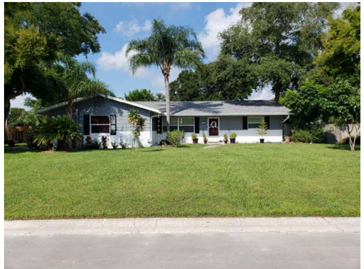
Across the street, to the west of the subject property