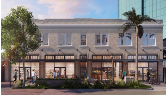
615-621 Cleveland Street