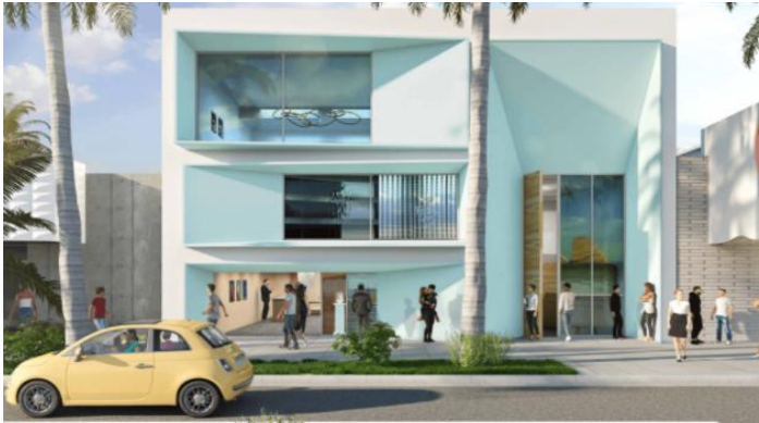
639 Cleveland Street