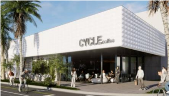
645 Cleveland Street