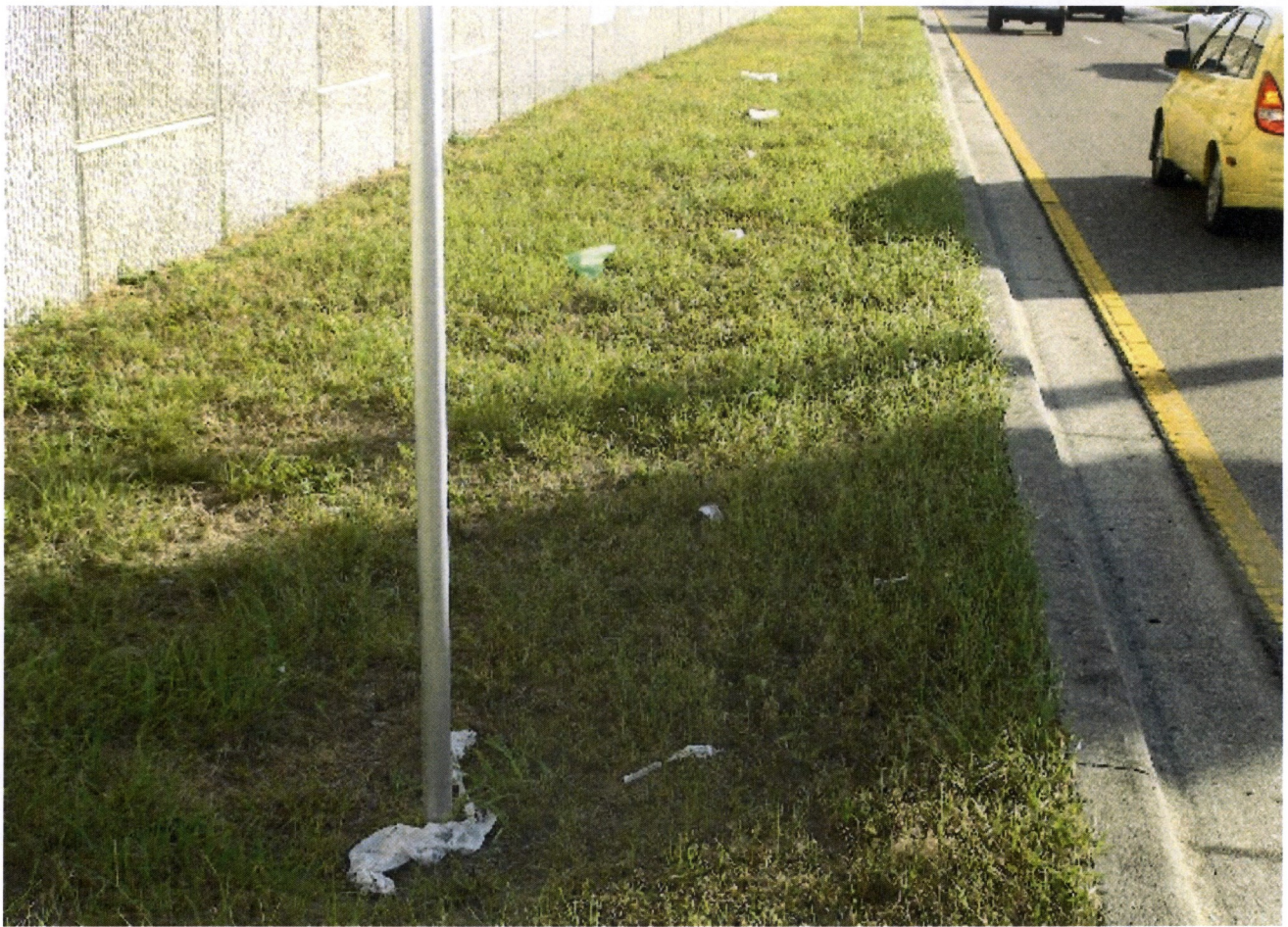
Clearwater near Sunset Point Twelve Feet Wide