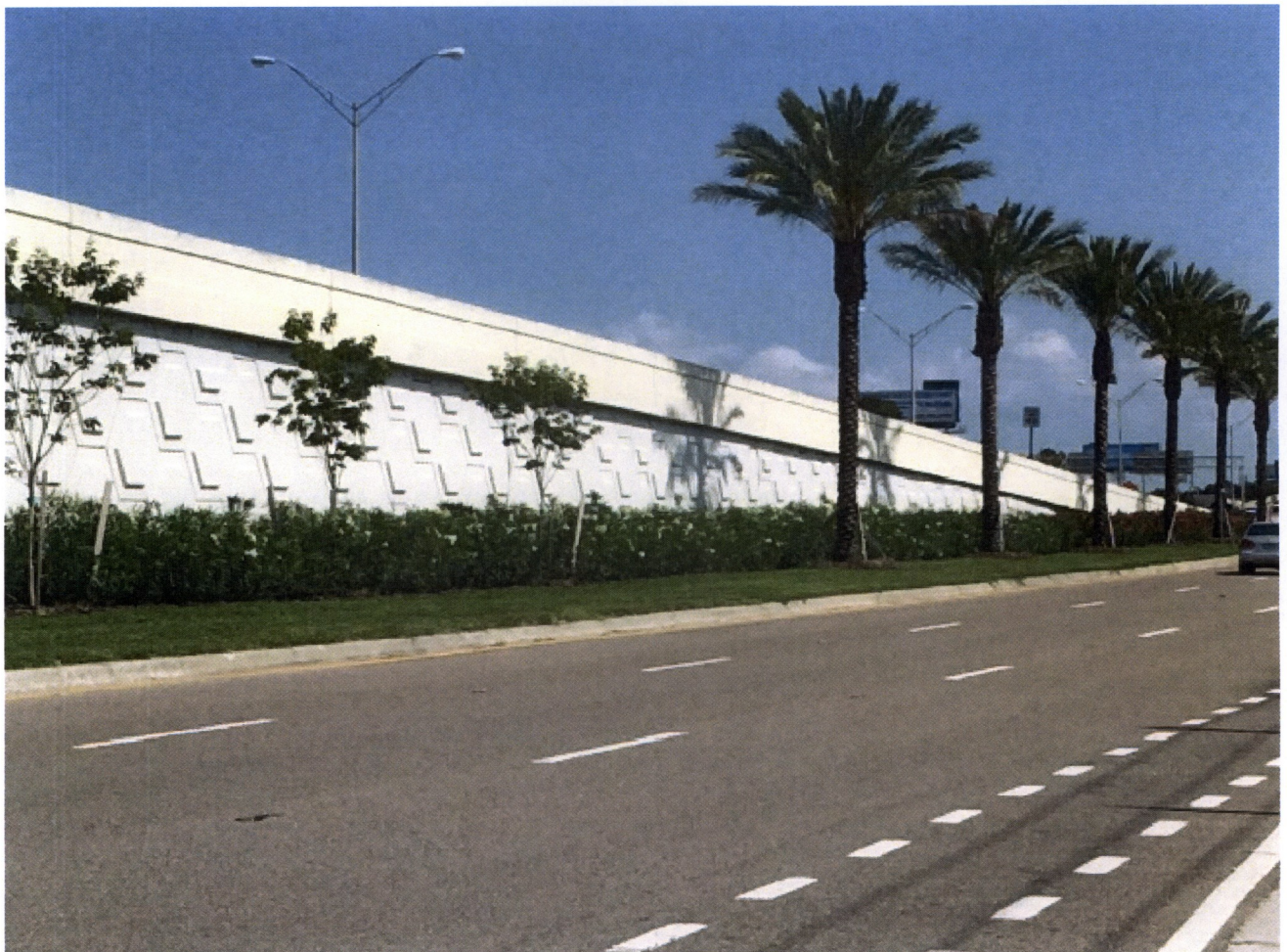
Largo US 19 at East Bay