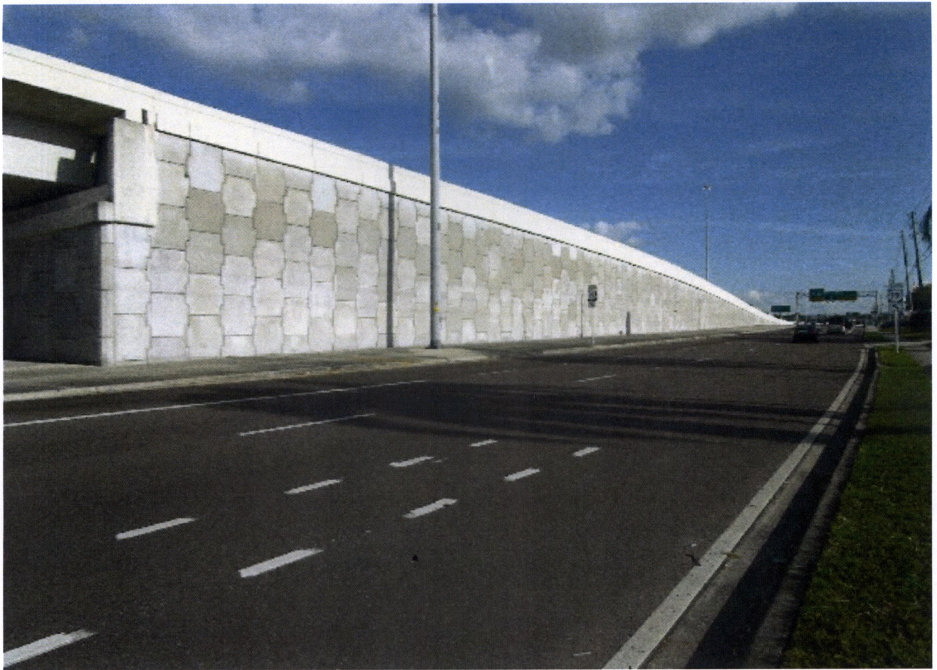
Clearwater US 19 at SR 580