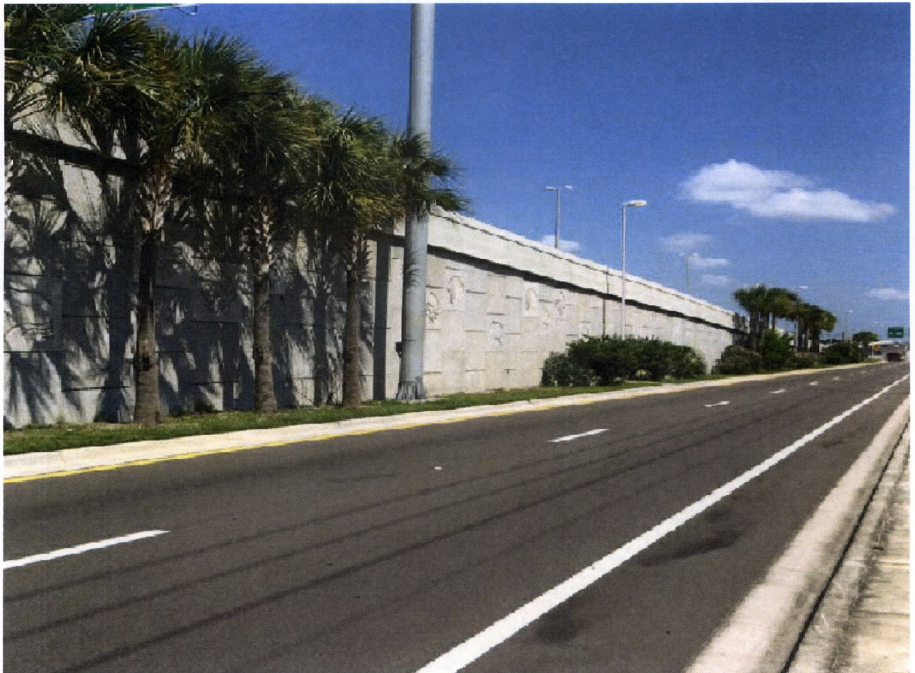
Pinellas Park US 19