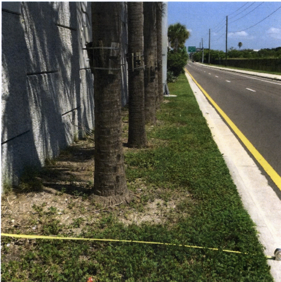
Pinellas Park near 118th