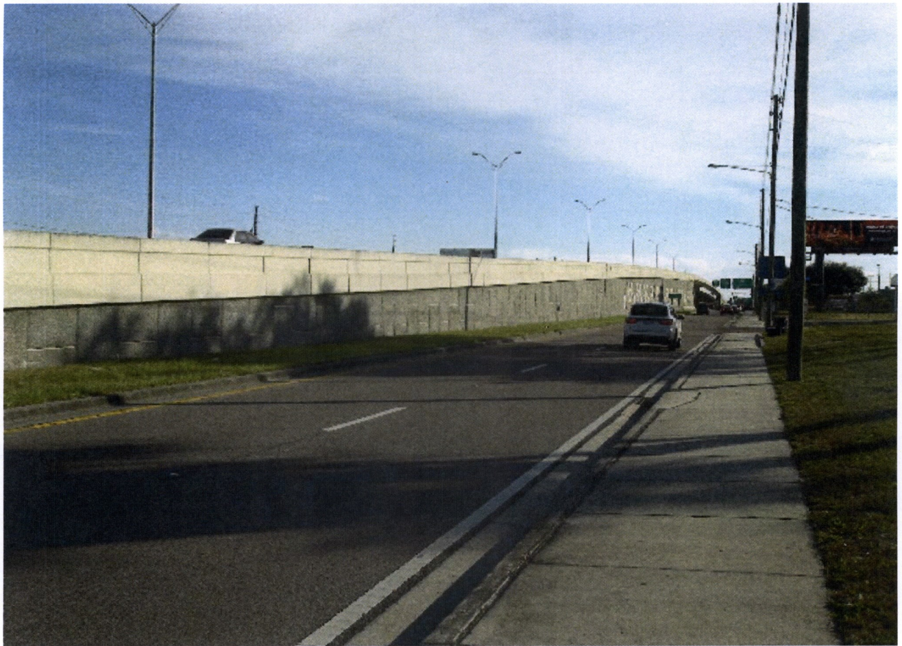
Clearwater US 19 SB approaching Sunset Point