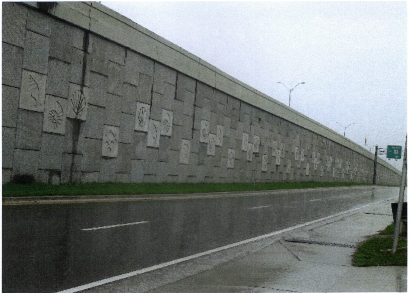
Clearwater US 19 South of Sunset Point