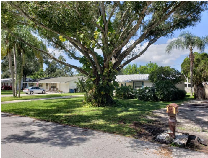
West of the subject property