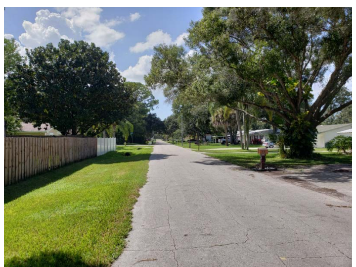
View looking westerly along Terrace Drive North

ANX2018-07013 Feliciano & Barbara Flores 2780 Terrace Drive North