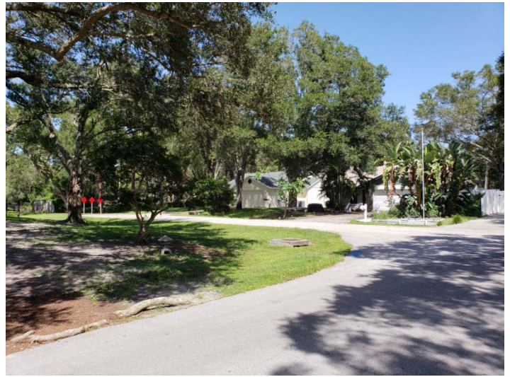
East of the subject property