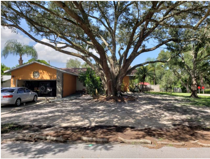
View looking north at the subject property 2780 Terrace Drive North