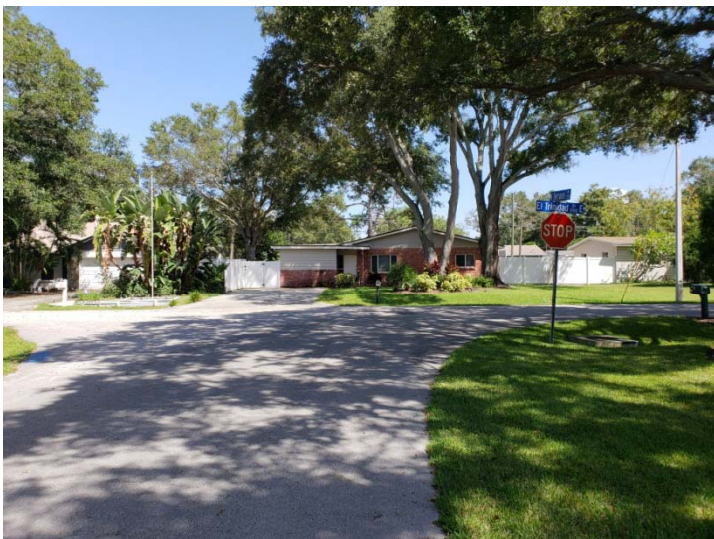
View looking easterly along Terrace Drive North