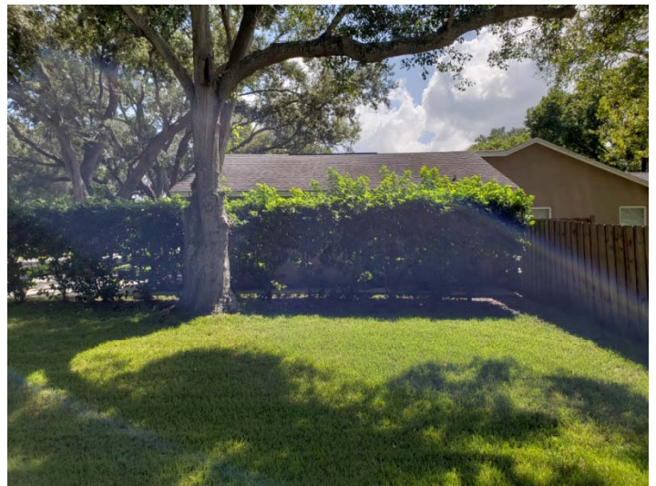
Across the street, to the south of the subject property