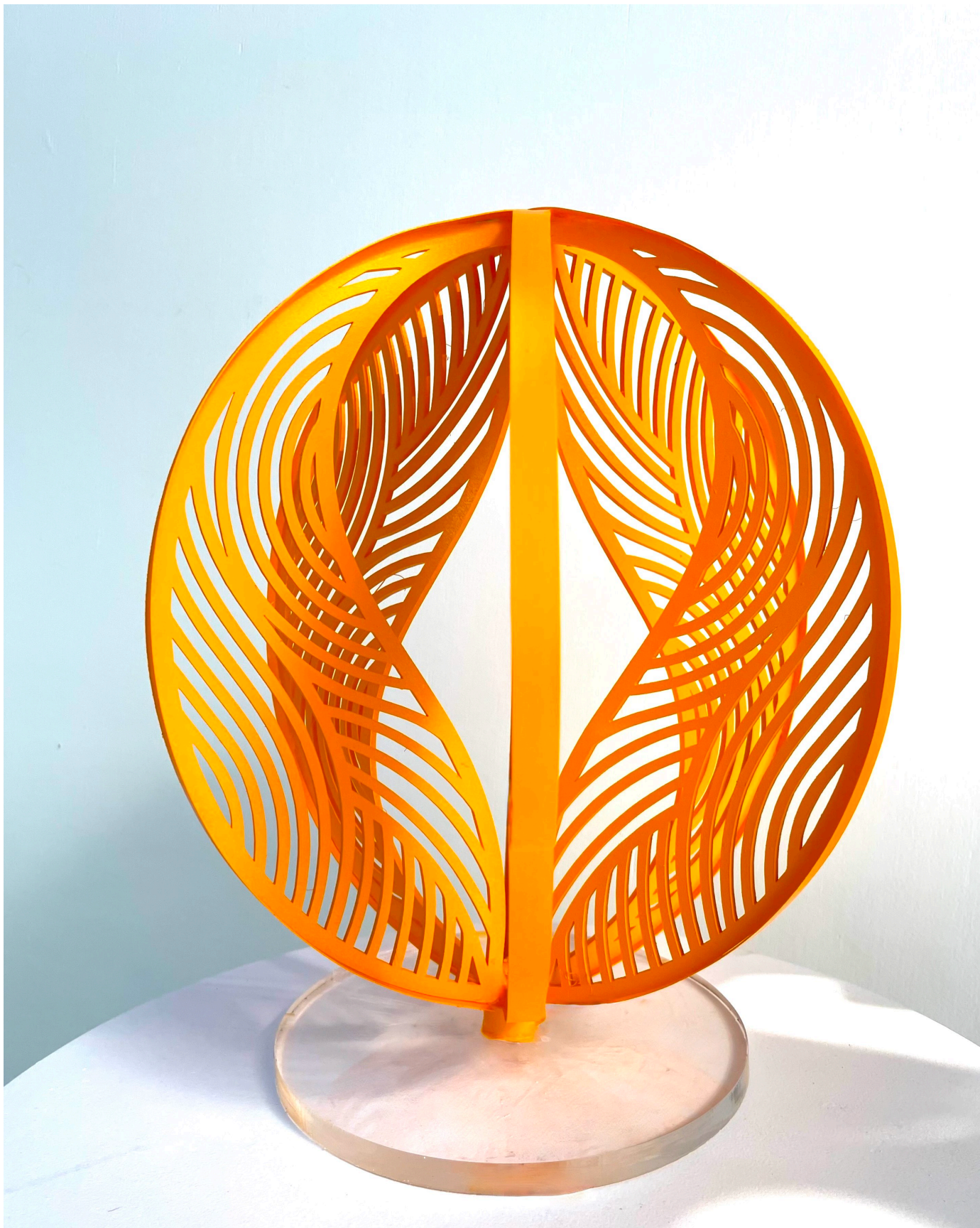
Cecilia Lueza Art Projects 2025