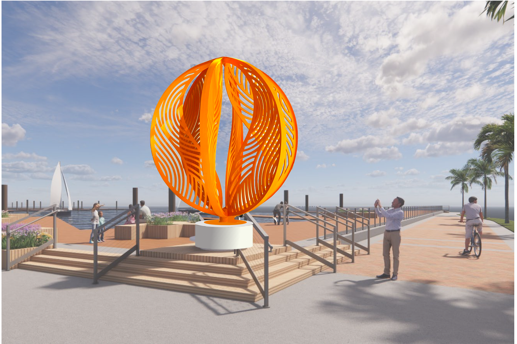
Cecilia Lueza Art Projects 2025