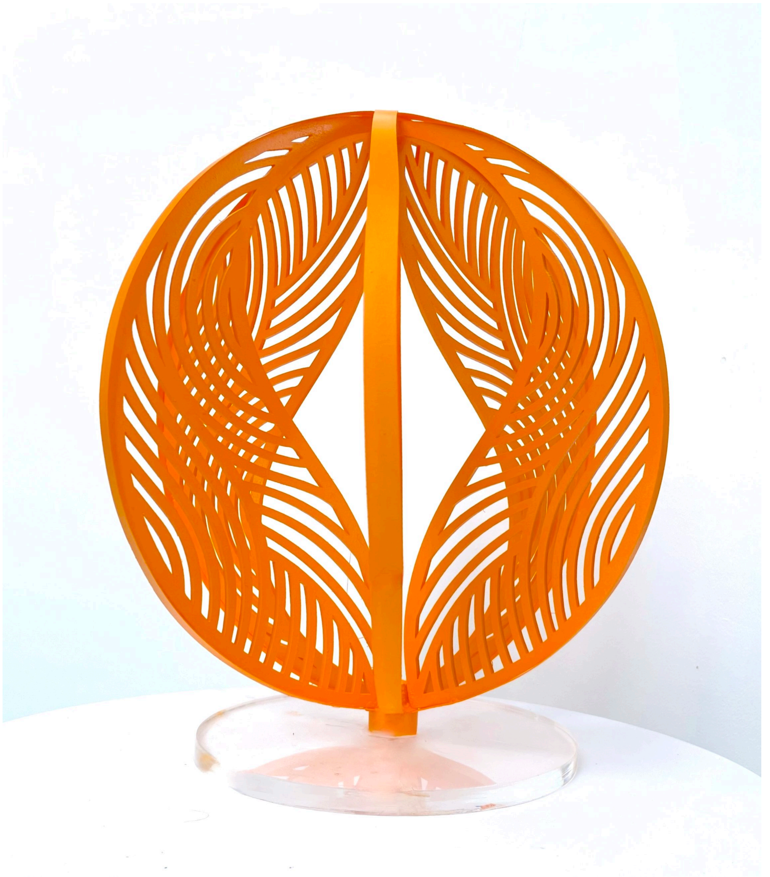
Cecilia Lueza Art Projects 2025