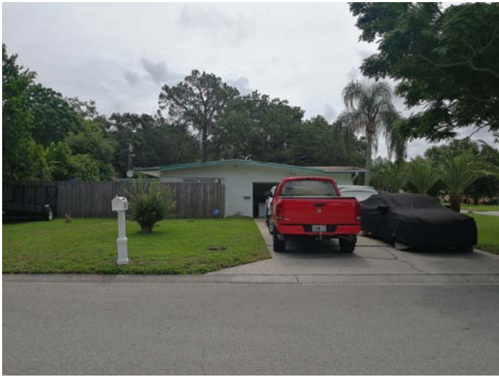
View looking east at subject property, 1015 Woodside Ave.