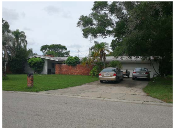
West of subject property, across Woodside Avenue