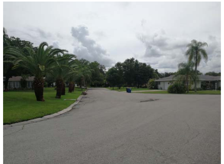
View looking easterly along Jeffords Street

ANX2019-06001 Marvin D. Gulley 1015 Woodside Avenue