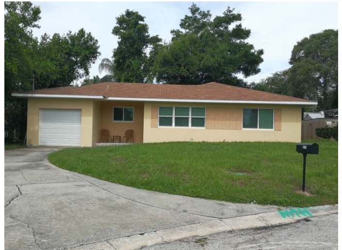
North of subject property