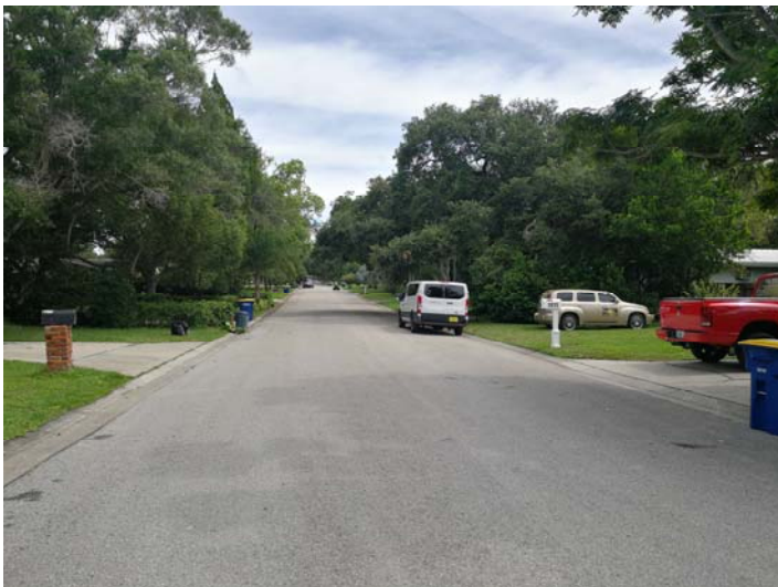
View looking northerly along Woodside Avenue