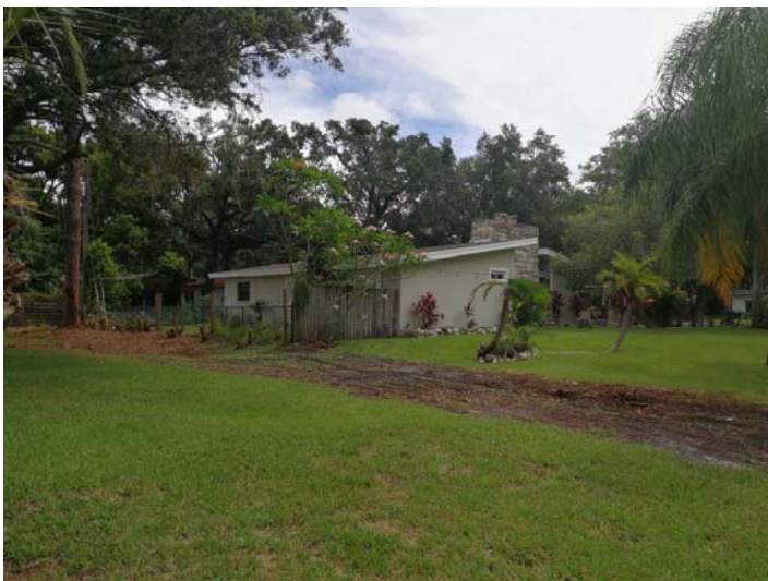
East of subject property