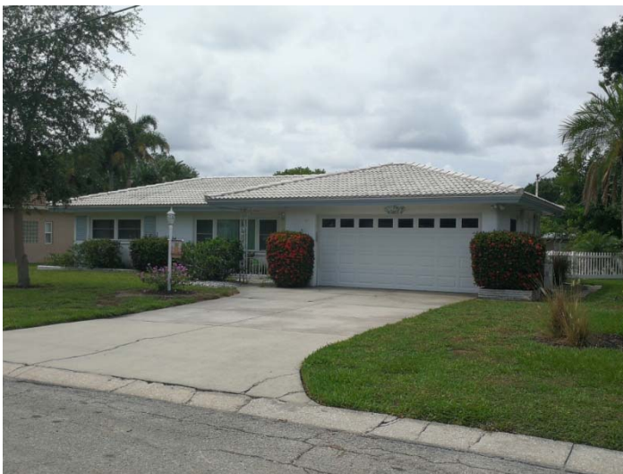
East of subject property