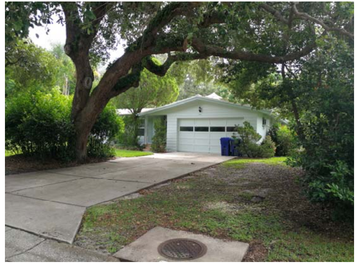
North of subject property