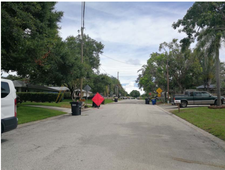
View looking northerly along Audubon Street