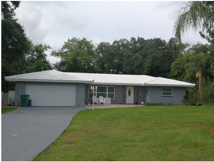
View looking south at subject property, 1819 Audubon Street