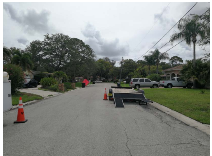
View looking easterly along Audubon Street

ANX2019-06001 Daniel De La Cruz Palma 1819 Audubon Street