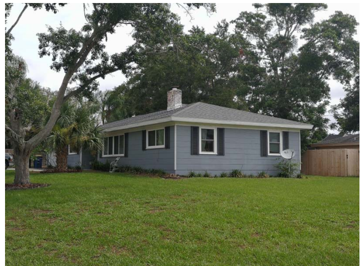
North of subject property, across Audubon Street