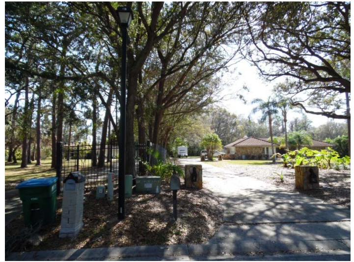
Across the street, east of the subject property