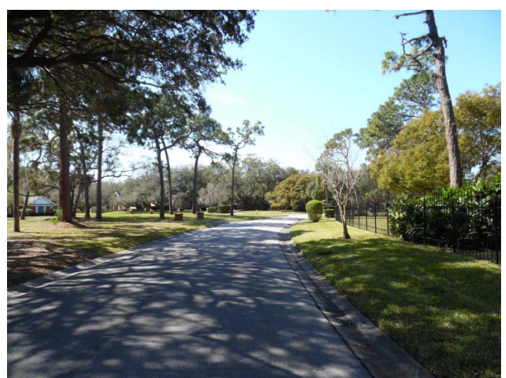
View looking southerly along McCauley Road