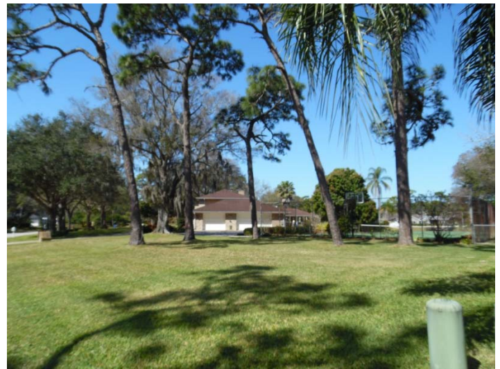
South of the subject property