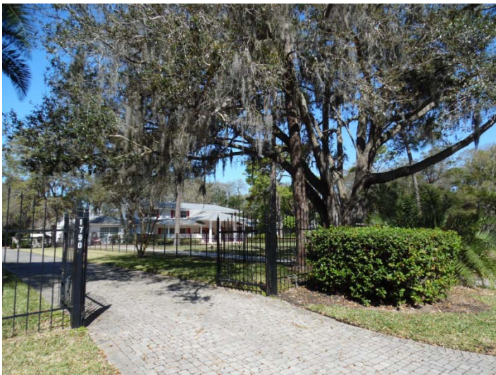
North of the subject property