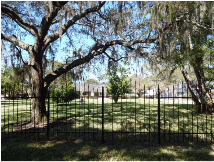
View looking west at the subject property, 1790 McCauley Road