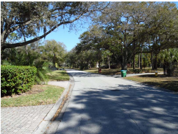
View looking northerly along McCauley Road