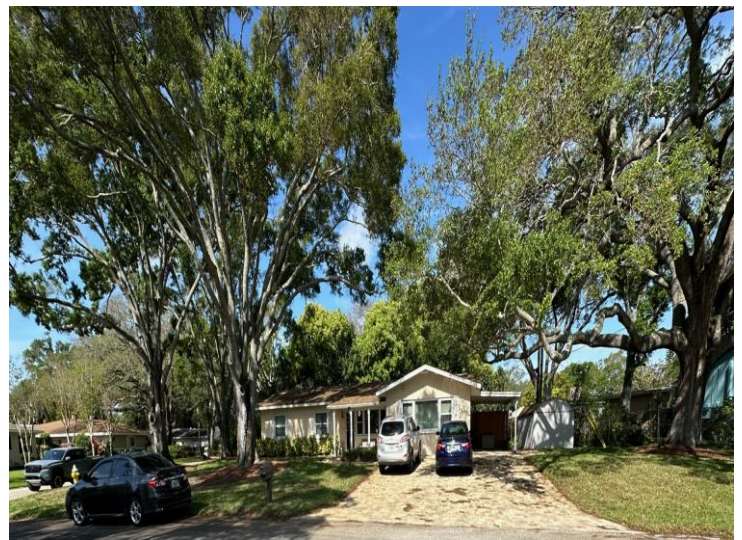
Across the street, to the west of the subject property